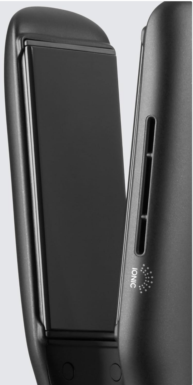
Image: A close-up view of the iron's CurvEdge design, illustrating the rounded edges that enable versatile styling beyond just straightening.