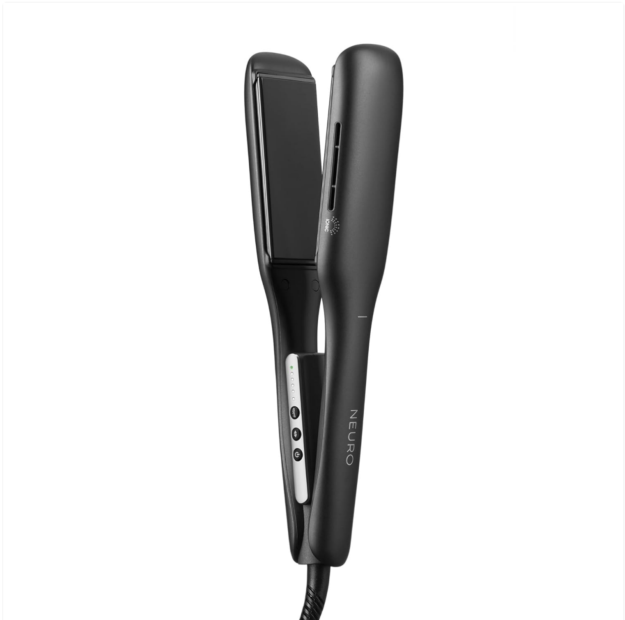
Image: The Neuro by Paul Mitchell Smooth+ 1.75" Ceramic Straightening & Styling Iron, shown in its open position, highlighting the wide ceramic plates and sleek black design.

The Neuro by Paul Mitchell Smooth+ 1.75" Ceramic Straightening & Styling Iron is designed for efficient and versatile hair styling. It features extra-wide CeraShine™ ceramic plates for faster styling, powered by NeutraHeat™ Technology to minimize damage by eliminating hotspots. The CurvEdge design allows for both straightening and curling, while a powerful ion generator helps neutralize static frizz for smooth, shiny results.