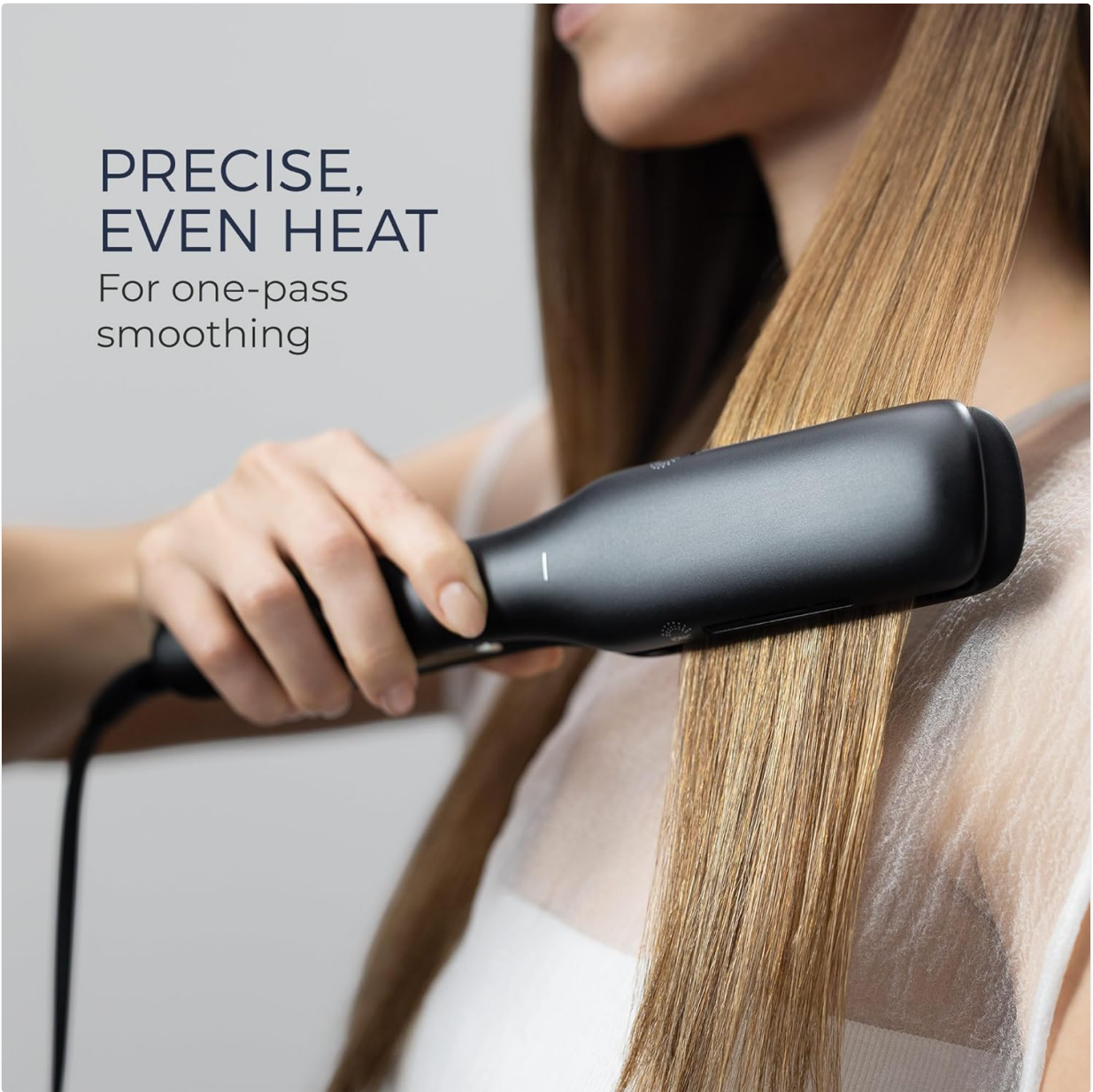
Image: A person using the Neuro Smooth+ iron to straighten a section of hair, demonstrating the smooth glide of the plates.