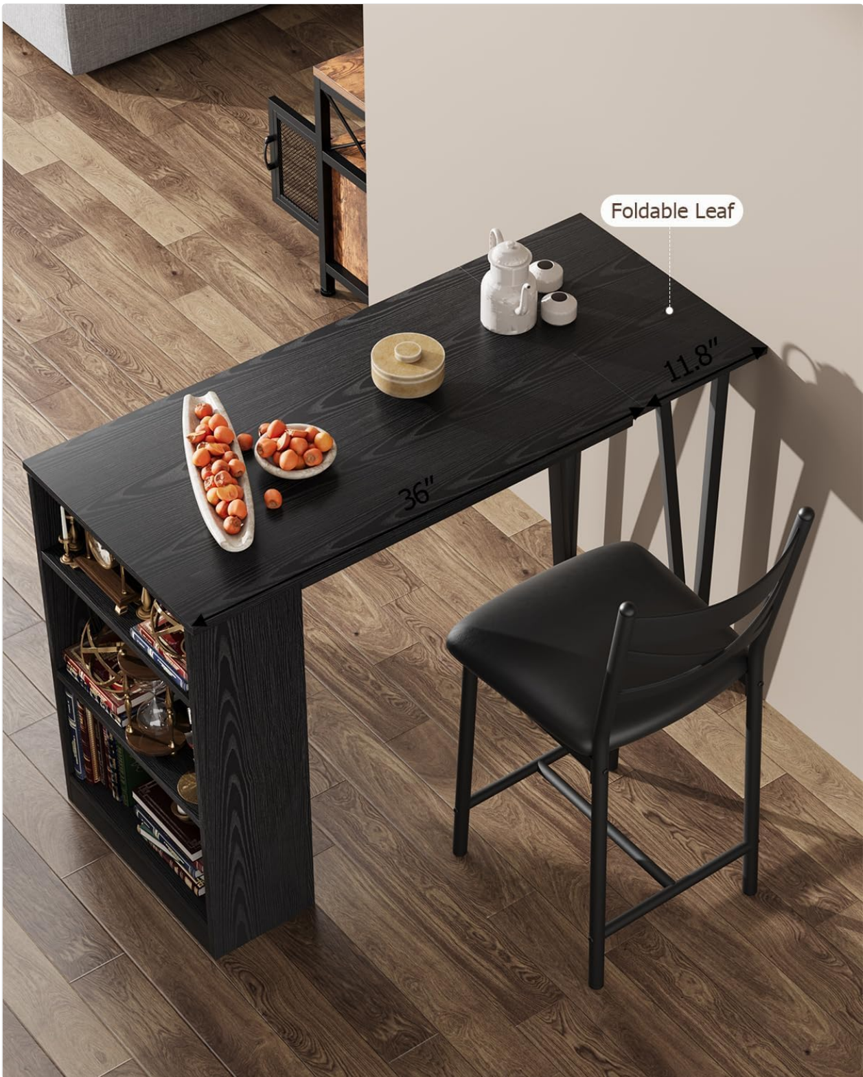
Image: A view of the bar table with its flip-top extension partially open, demonstrating the expandable feature.