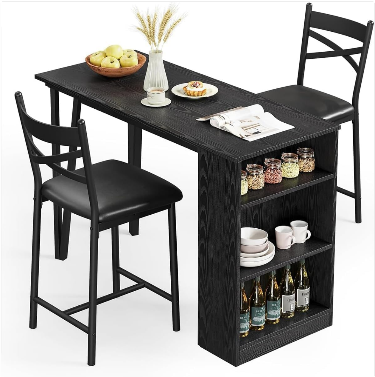
Image: The complete bar table set, showing the table with its storage shelves and two chairs positioned around it.

Your browser does not support the video tag.