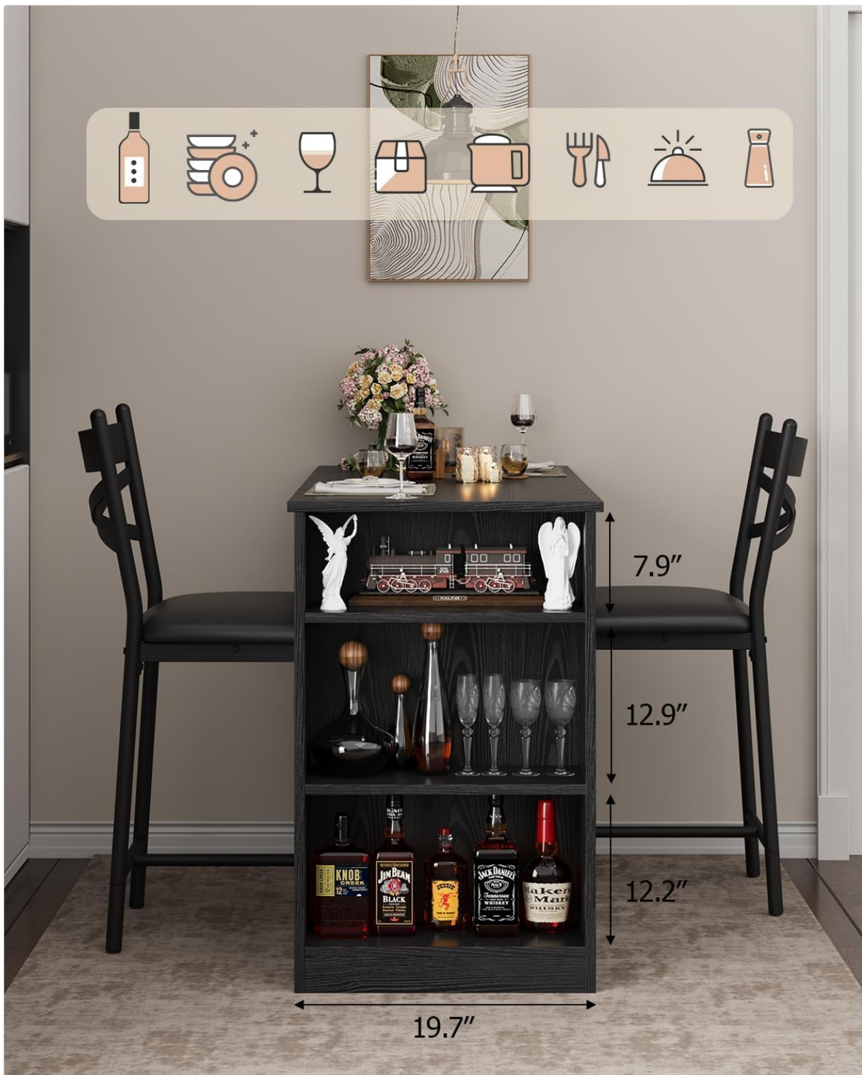
Image: The bar table showcasing its three storage shelves, filled with various items like bottles and decorative pieces.