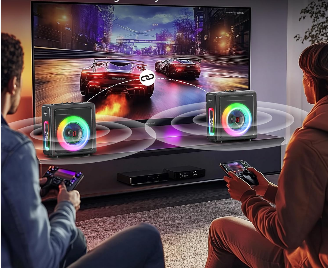
Image: True Wireless Stereo Pairing with two MS75-T units.

Equipped with Bluetooth 5.3 to provide zero-latency high-fidelity stereo sound.