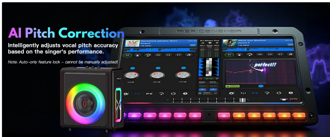
Image: AI Pitch Correction for vocal accuracy.