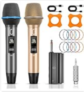
Image: Contents of the PPMIC MS75-T Karaoke Machine package.