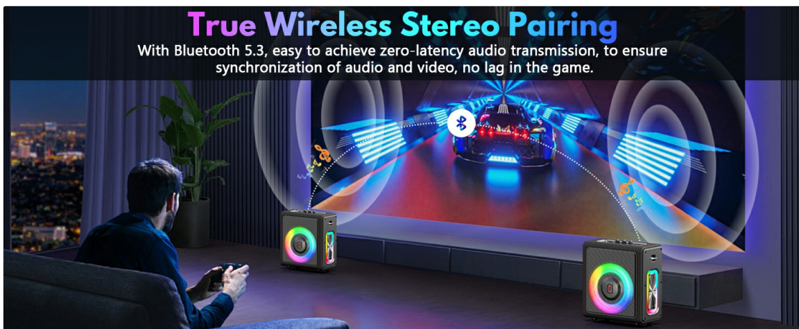
Image: Connecting to a Smart TV via Bluetooth or AUX Cable.