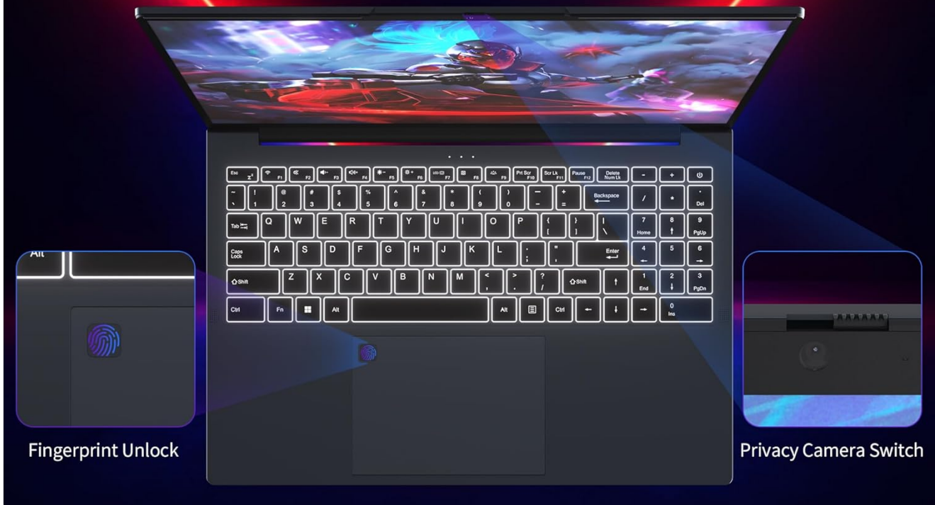
Image: Close-up of the laptop keyboard showing the fingerprint unlock sensor, typically integrated into the power button or touchpad area.

Equipped with a backlight keyboard, which is perfect for working in low-light environments