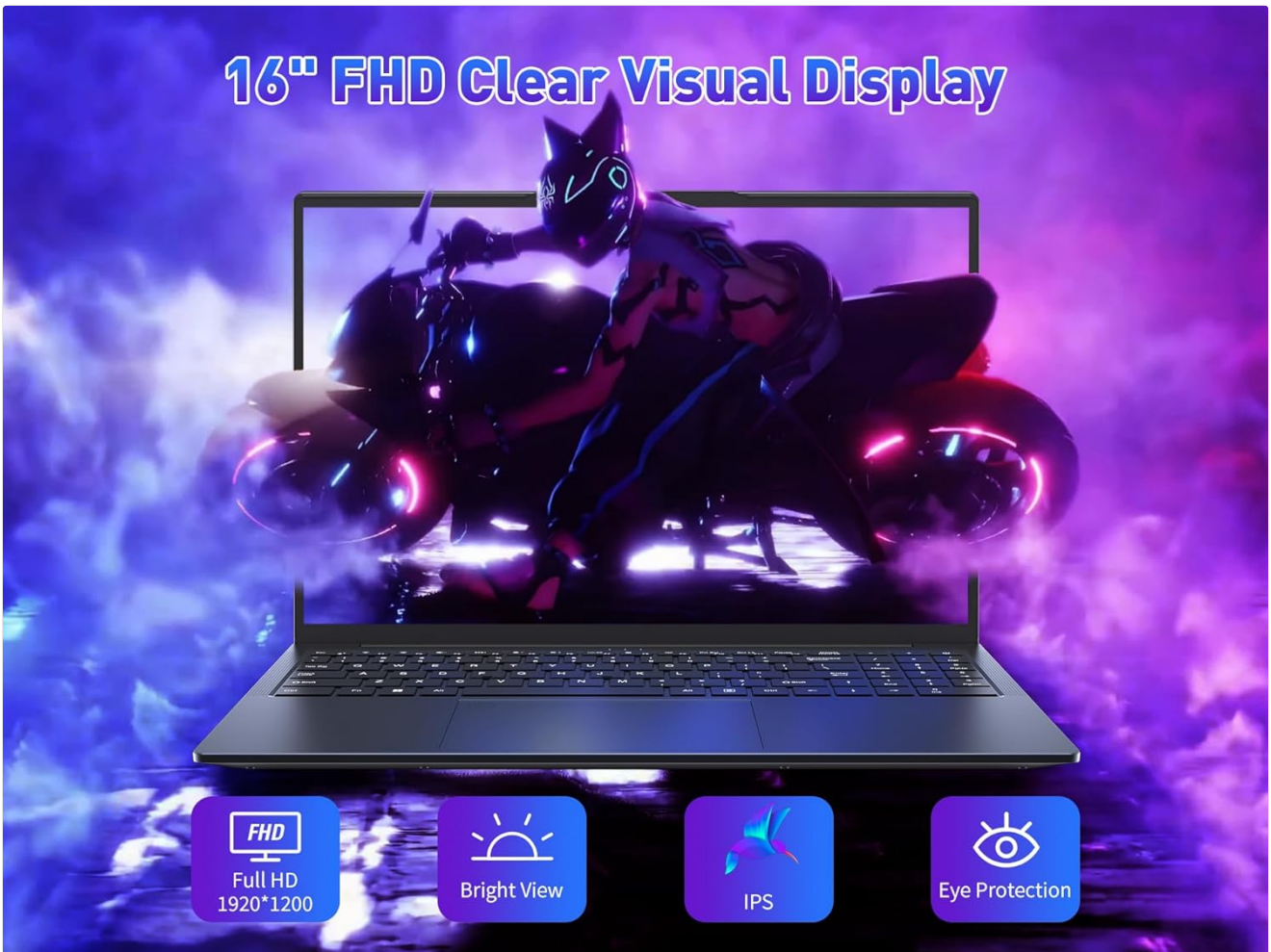
Image: The laptop screen displaying a high-resolution image, emphasizing its visual quality.