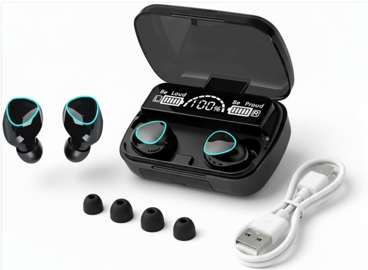
Image: All components included in the M10 TWS Wireless Earbuds package.