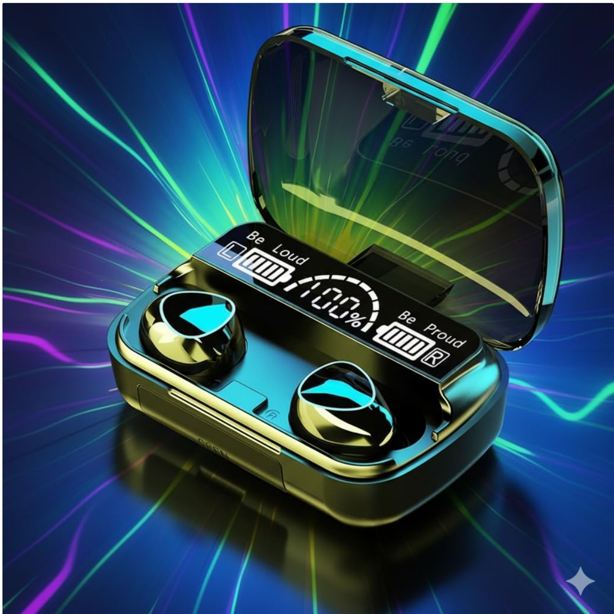
Image: The M10 charging case with earbuds inside, connected to a power source for charging.