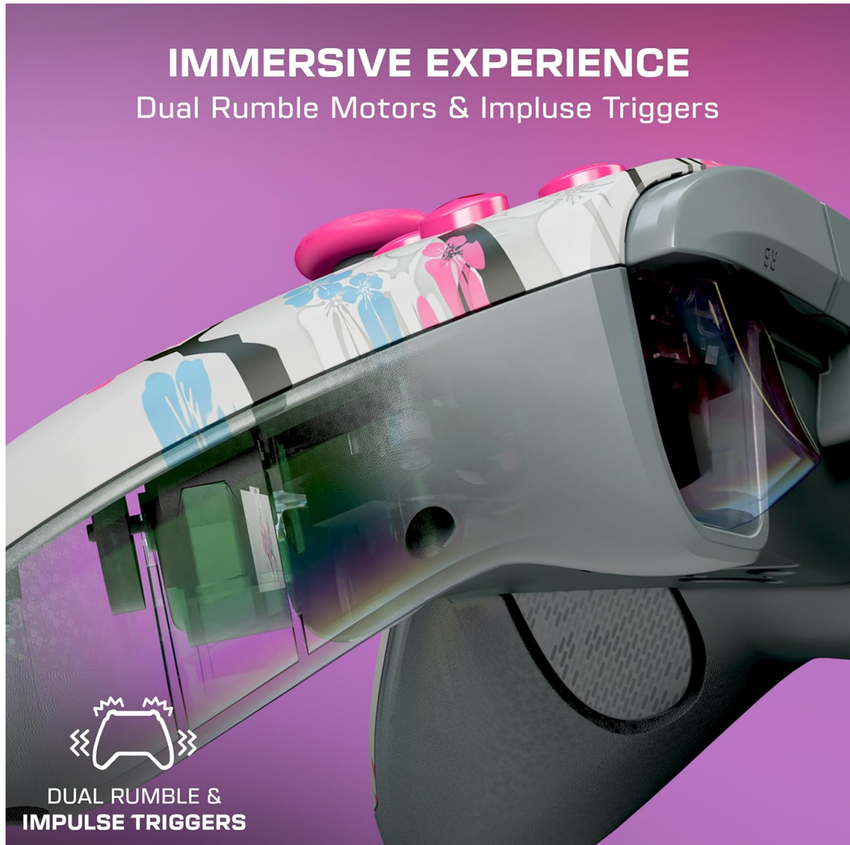
Image: The Cherry Blossom controller design illuminated with a glow-in-the-dark effect.

The Cherry Blossom design features elements that glow in the dark after exposure to UV light, adding a unique visual effect to your controller.