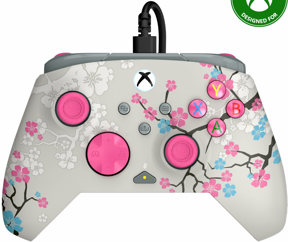
Image: The Turtle Beach Rematch Advanced Wired Gaming Controller in Cherry Blossom design, showcasing its vibrant aesthetic.