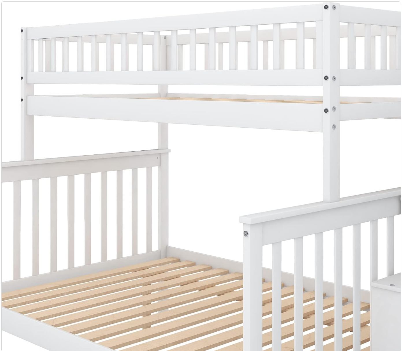
Figure 1: A close-up view illustrating the height of the guardrail on the upper bunk, designed to enhance safety and prevent falls. The wooden slats providing mattress support are also visible.