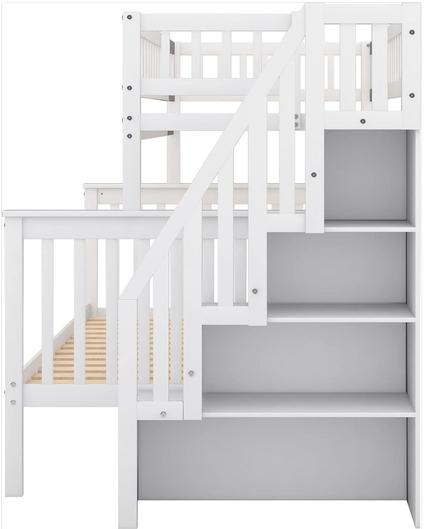
Figure 5: A detailed view of the integrated storage staircase, highlighting the individual steps and the storage compartments built into the side.