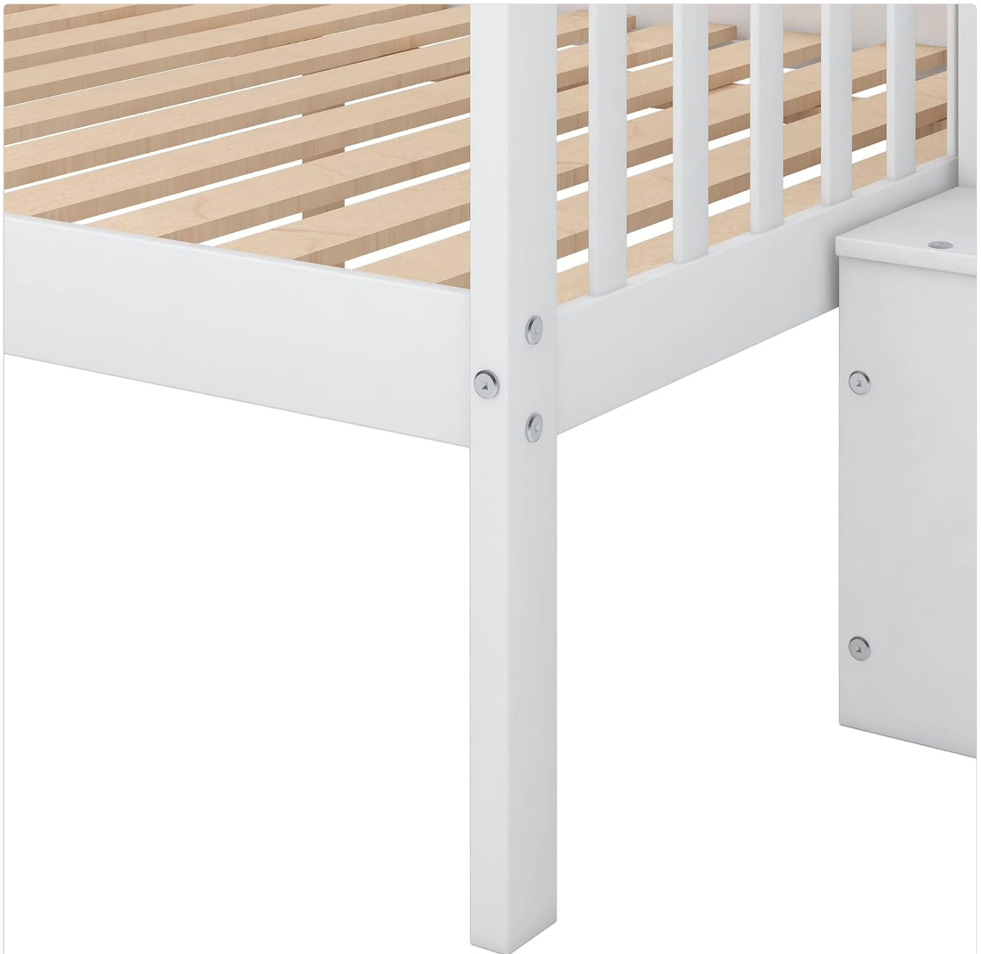
Figure 6: A detailed view of a bed leg and its connection to the frame, emphasizing the importance of regularly checking and tightening all hardware for stability and safety.