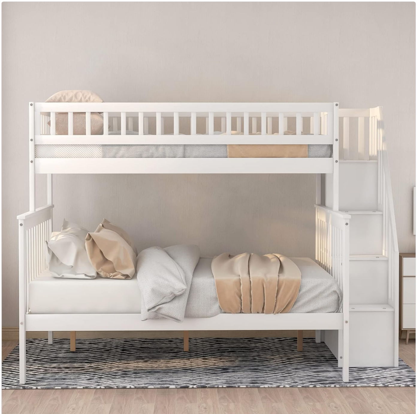
Figure 3: An assembled Merax Twin Over Full Bunk Bed with storage stairs, shown in a room with bedding. This image provides a visual reference of the complete product.