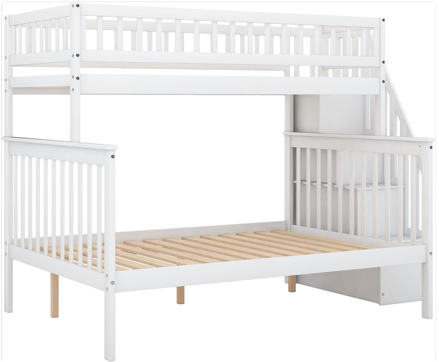
Figure 4: A close-up view of the wooden slats that provide support for the mattress on both the upper and lower bunks. These slats eliminate the need for a box spring.