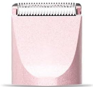
Hair Trimmer Head