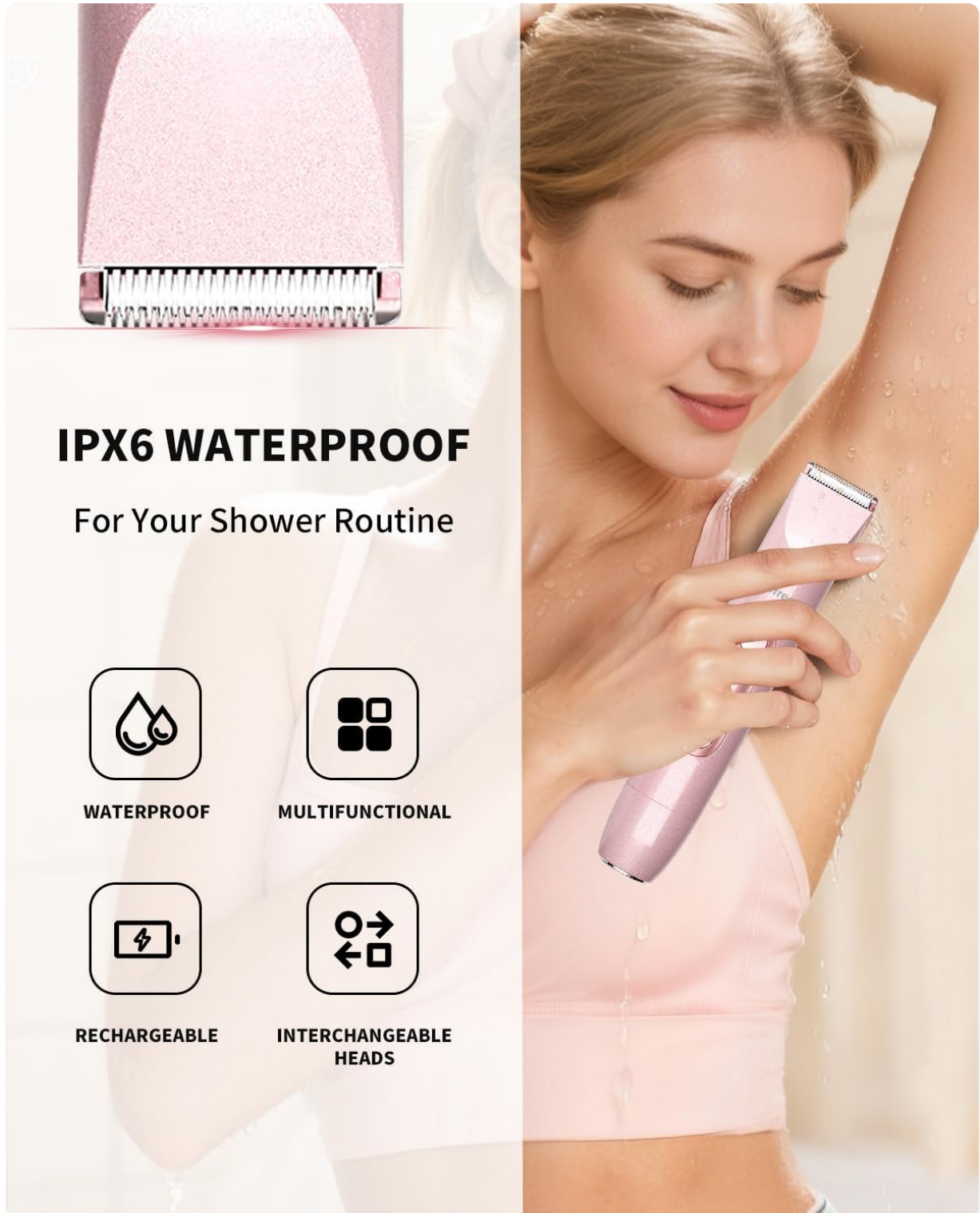
Image: A woman using the Ufree Electric Trimmer on her underarm in a wet environment, demonstrating its IPX6 waterproof capability.

The Ufree trimmer is IPX6 waterproof, allowing for both dry and wet shaving. You can use it in the shower or with shaving cream/gel for added comfort. Always ensure the charging port is dry before connecting the charging cable.