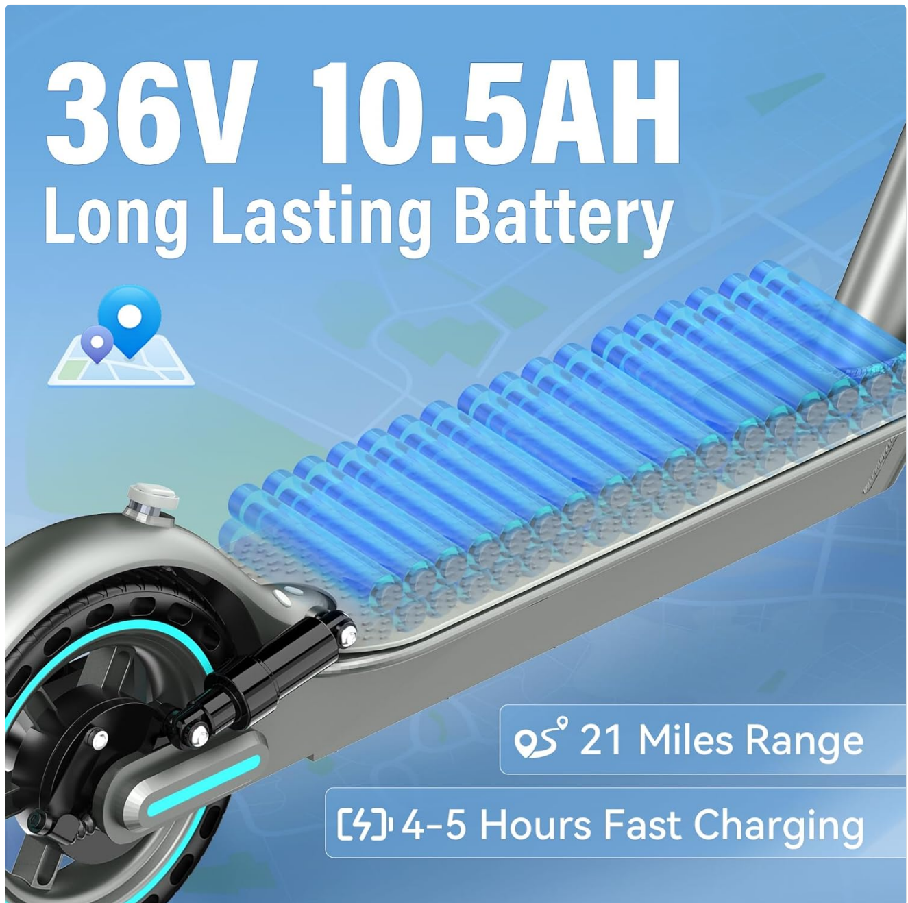
Image: An internal view illustrating the 36V 10.5AH battery cells within the scooter's deck, highlighting its long-lasting capacity and 4-5 hour fast charging capability.

Before first use, fully charge the scooter's battery. Connect the charger to the charging port and then to a power outlet. The charging indicator will show the charging status. A full charge typically takes 4-5 hours.