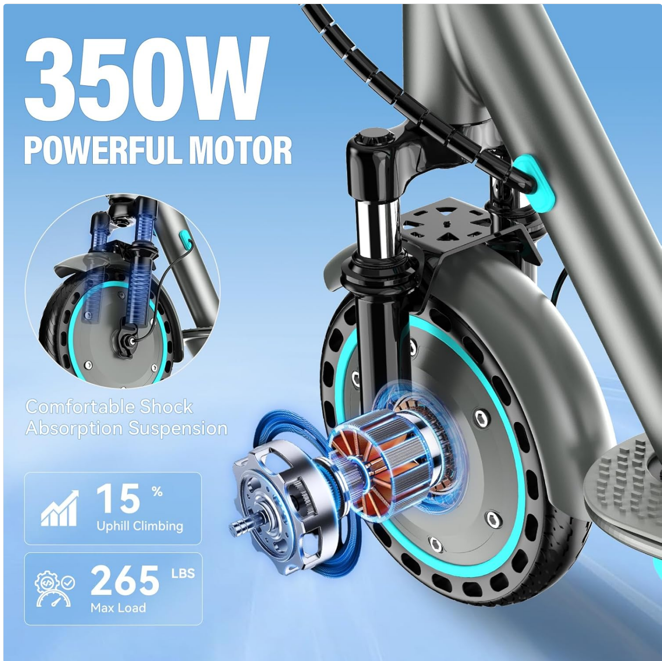
Image: A detailed view of the EGGKING D8 Pro's front wheel, showcasing the comfortable shock absorption dual suspension and the integrated 350W powerful brushless motor.