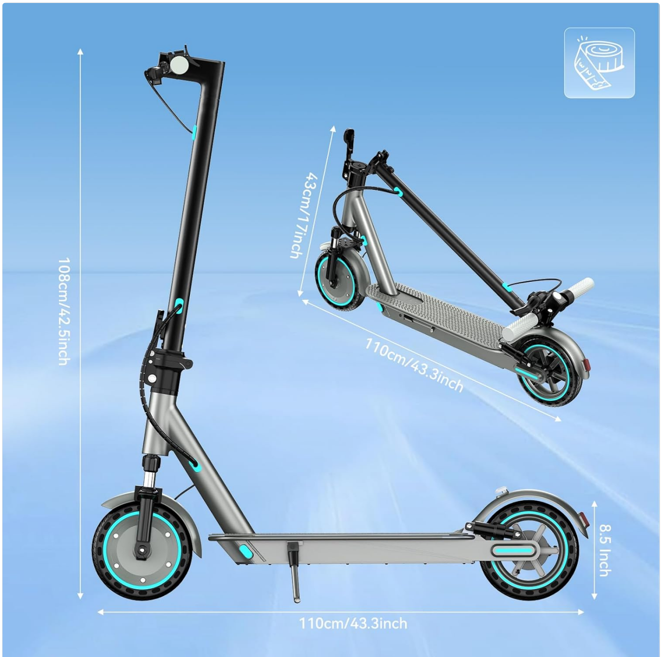
Image: A diagram illustrating the dimensions of the EGGKING D8 Pro Electric Scooter in both its unfolded and folded configurations, including wheel size.