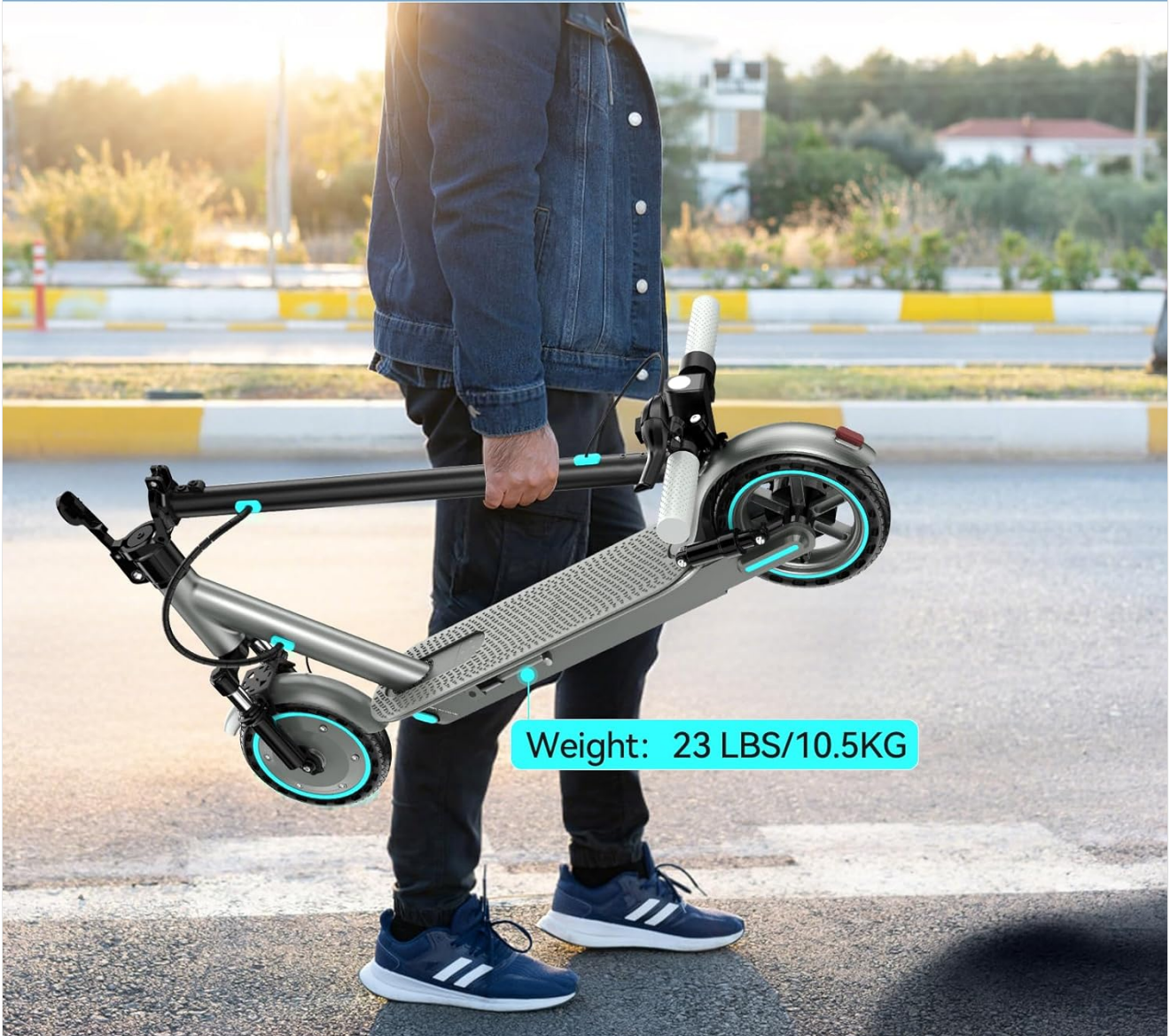
Image: A person carrying the EGGKING D8 Pro Electric Scooter in its folded state, demonstrating its portability and compact design for transport.