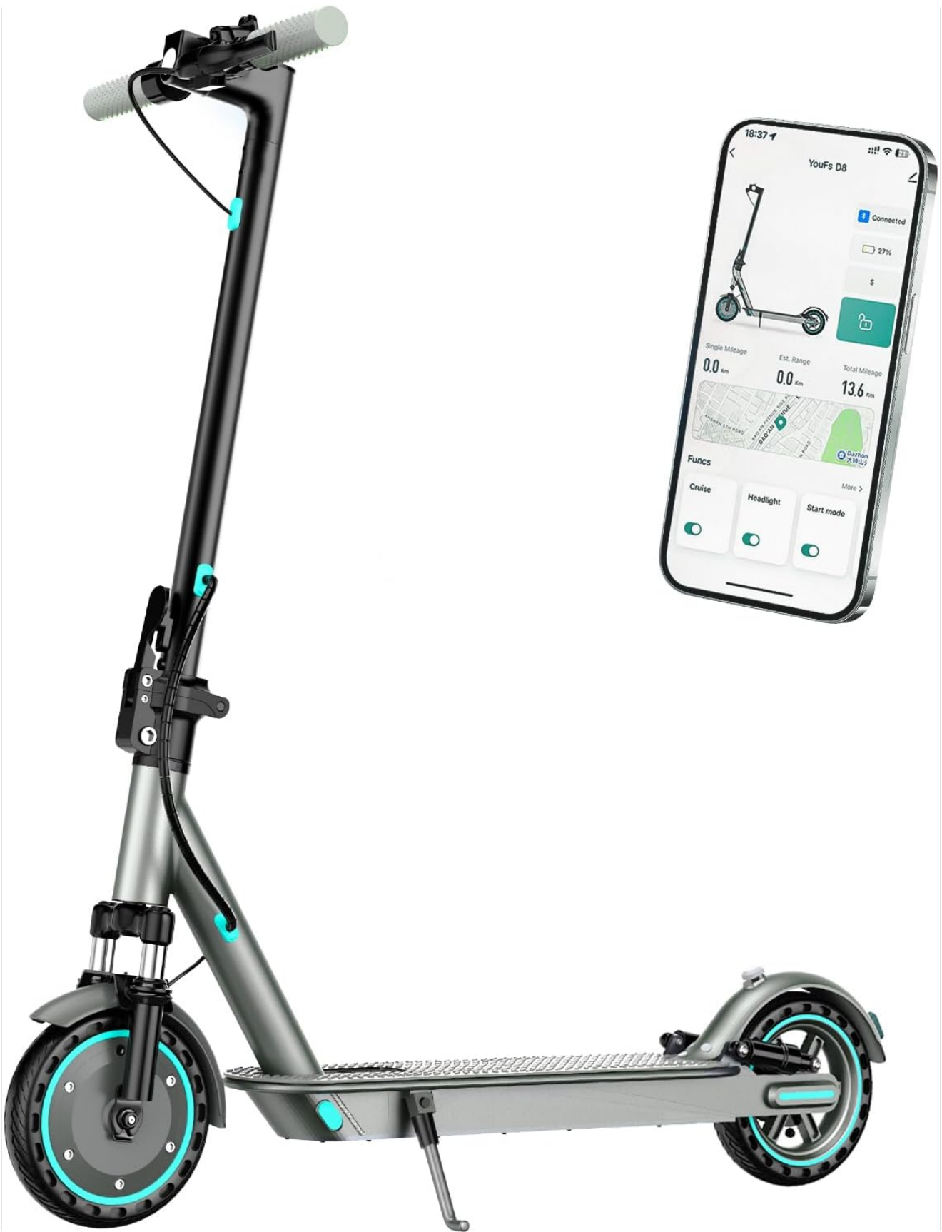
Image: The EGGKING D8 Pro Electric Scooter shown alongside a smartphone displaying its companion app interface.