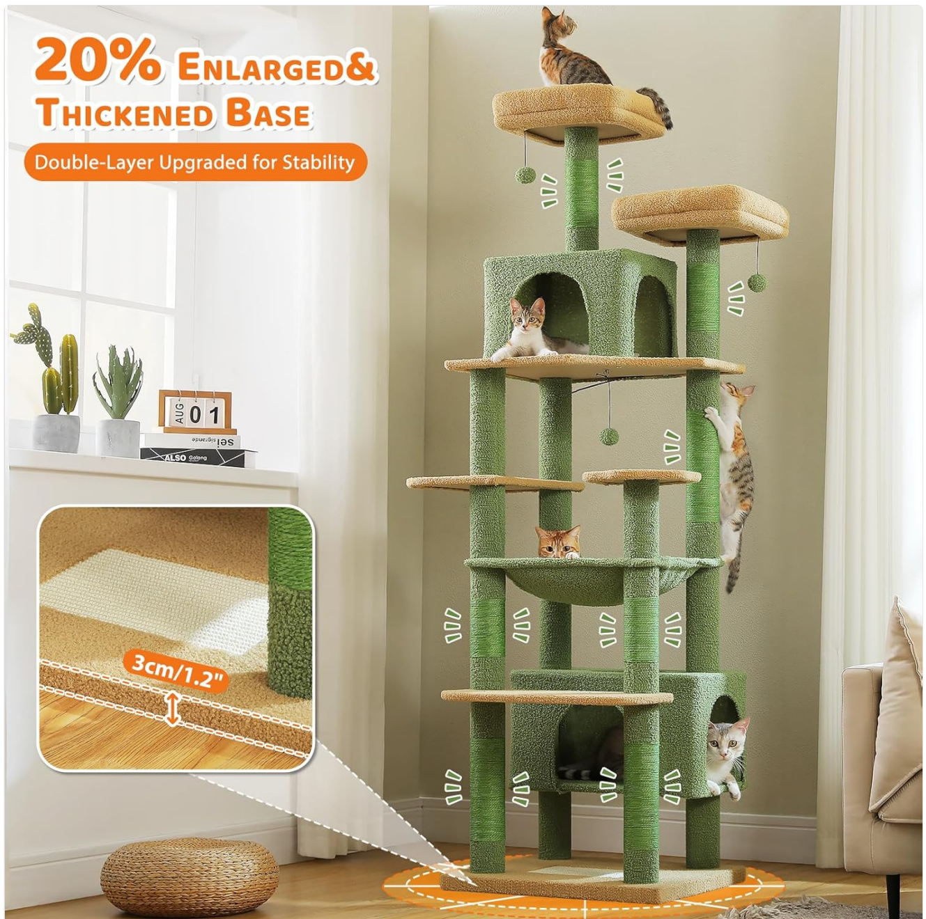
Image: Close-up of the thickened and enlarged base, showing its 1.2-inch thickness for enhanced stability.