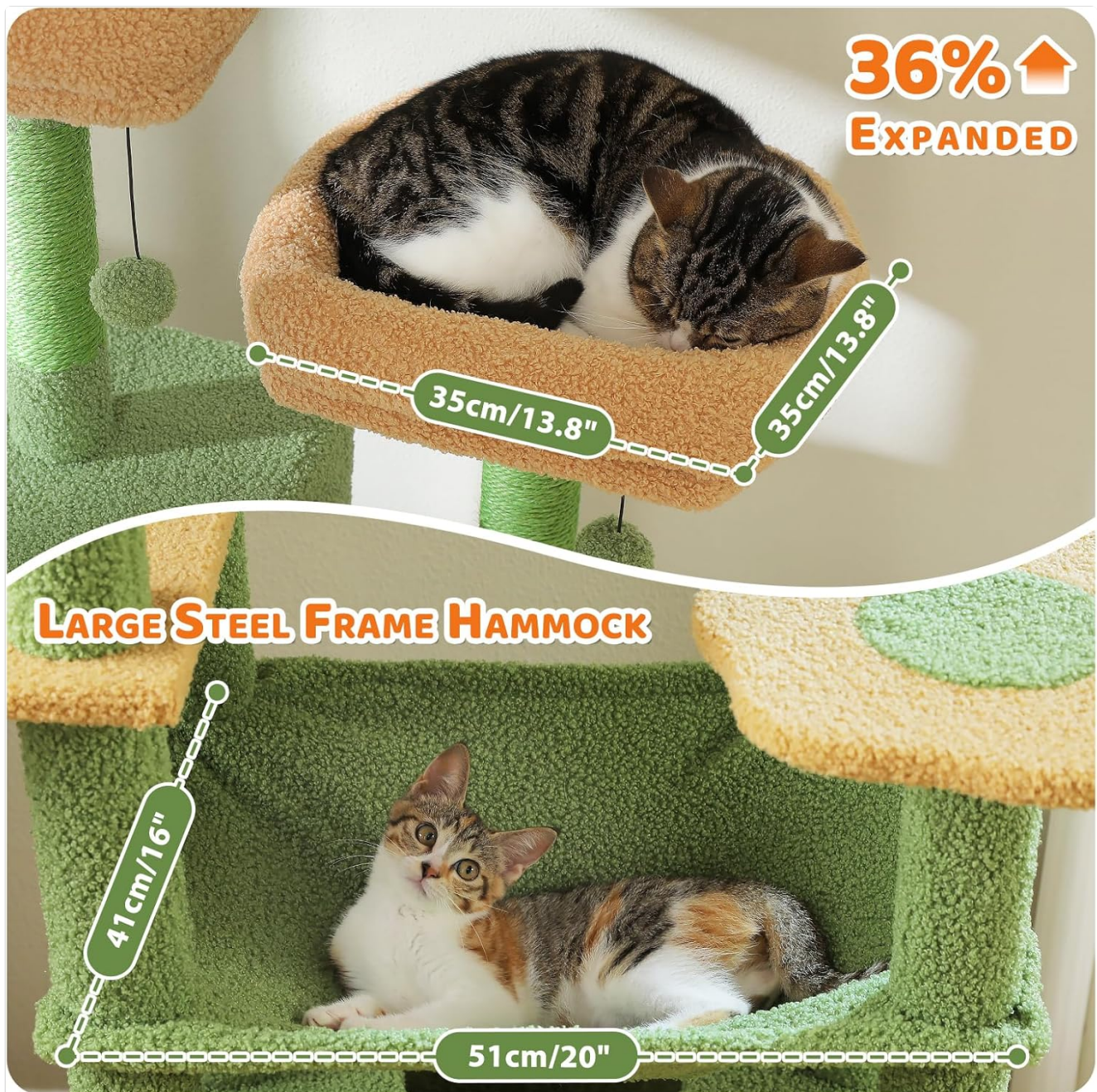
Image: A cat resting comfortably in the large hammock, highlighting its spacious design. Another cat is visible on an upper perch.