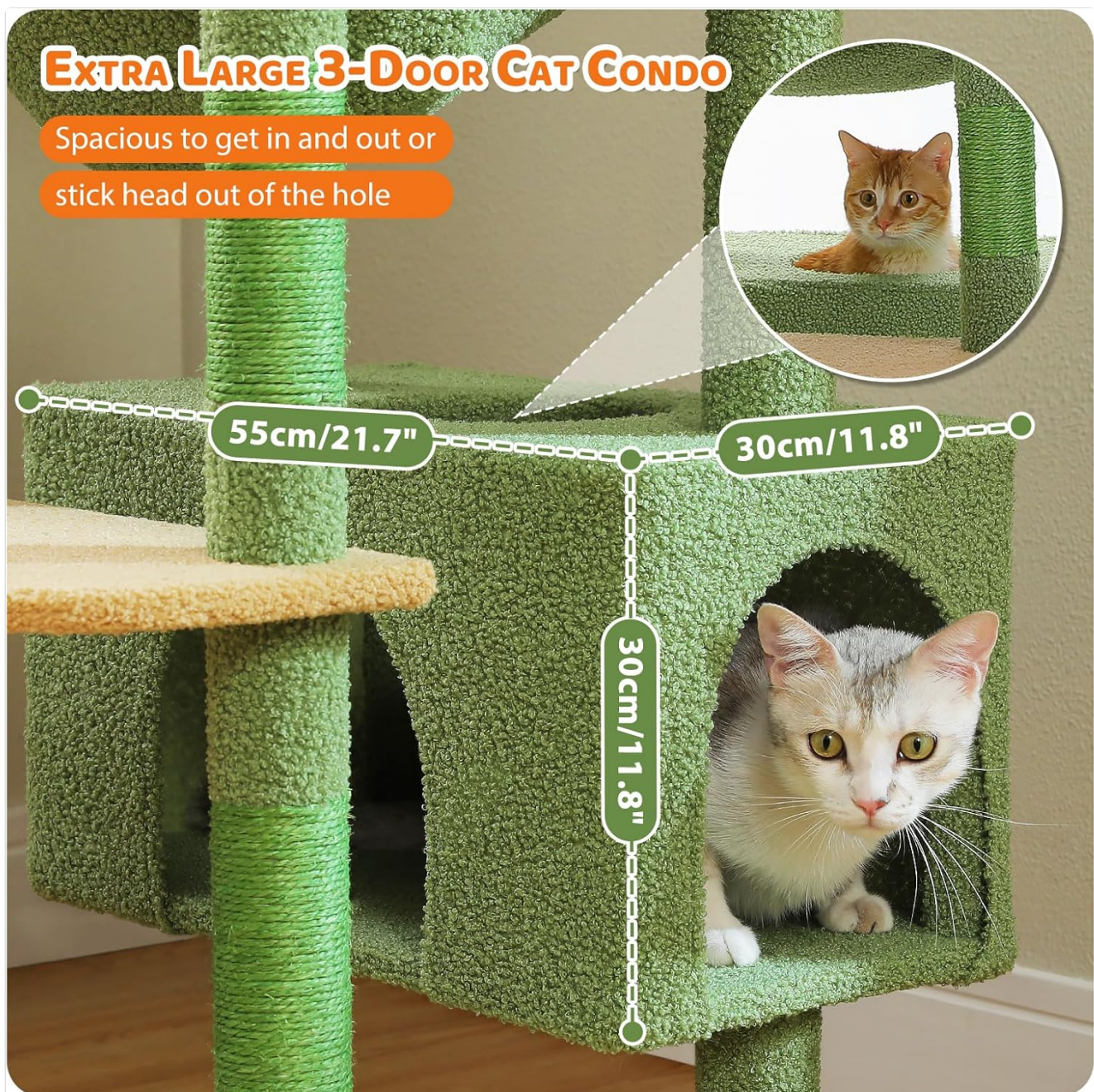
Image: A cat exploring one of the extra-large cat condos, demonstrating the ample space and multiple entry points.