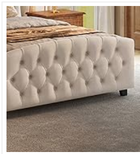
Image: The completed bed frame assembly.

Review all connections to ensure they are tight and secure. The bed frame is now ready for your mattress.