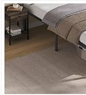
Image: Positioning the steel slats for mattress support.

Lay the steel slats (e.g., G) across the bed frame. Ensure they are evenly spaced and fit securely into the designated slots or connectors.