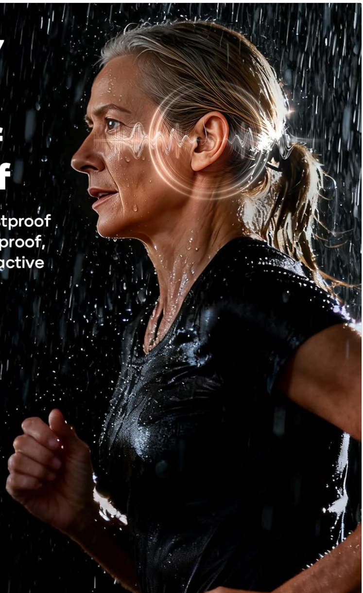
Image: A woman is shown running in the rain, highlighting the IP67 waterproof and dustproof capabilities of the iBstone Edge hearing aids, suitable for active lifestyles.

Safe Even Under Sweat & Rain Extent the service life of the product