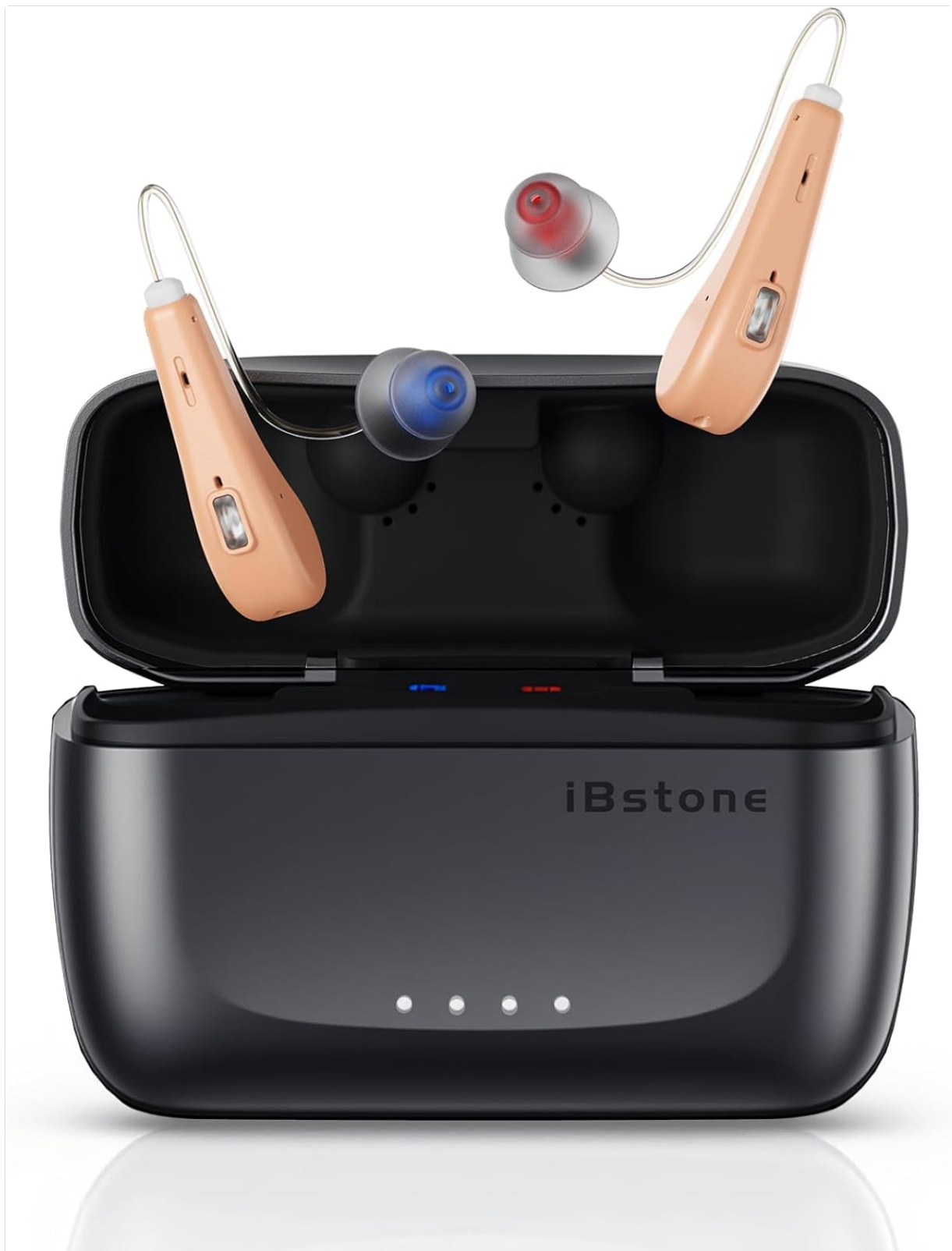
Image: The iBstone Edge hearing aids are shown resting in their open charging case, illustrating their compact design and how they are stored.