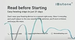
Read before Starting

Image: All components included in the iBstone Edge Hearing Aids package, featuring the charging case, hearing aids, domes, cleaning brush, wax guard filters, USB cable, and documentation.