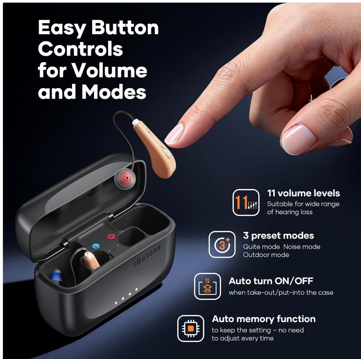
Image: A hand is shown interacting with the control button on an iBstone Edge hearing aid, illustrating the ease of adjusting volume and modes.

The hearing aids are equipped with an automatic memory function that retains your last used volume and mode settings, eliminating the need to readjust them every time you put them on.