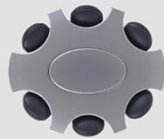
Wax Guard Filters