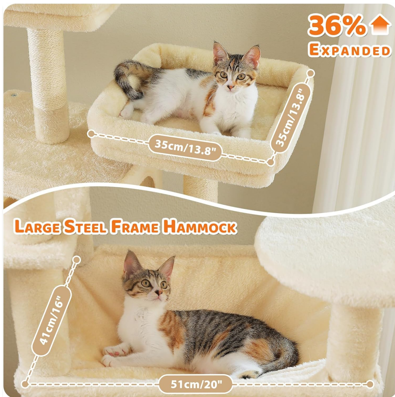
Image 3: A cat comfortably resting in the spacious hammock, highlighting the generous dimensions of the lounging areas.

The PAWZ Road Cat Tree is designed to cater to your cat's natural instincts for climbing, scratching, playing, and resting. Encourage your cat to explore all levels and features.