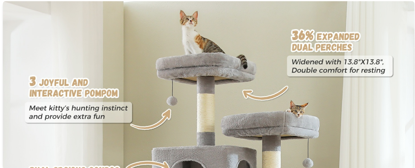
Image 4: A cat actively using one of the sisal scratching posts, demonstrating the intended use for claw care.

Regular maintenance will extend the life of your cat tree and keep it hygienic for your pets.