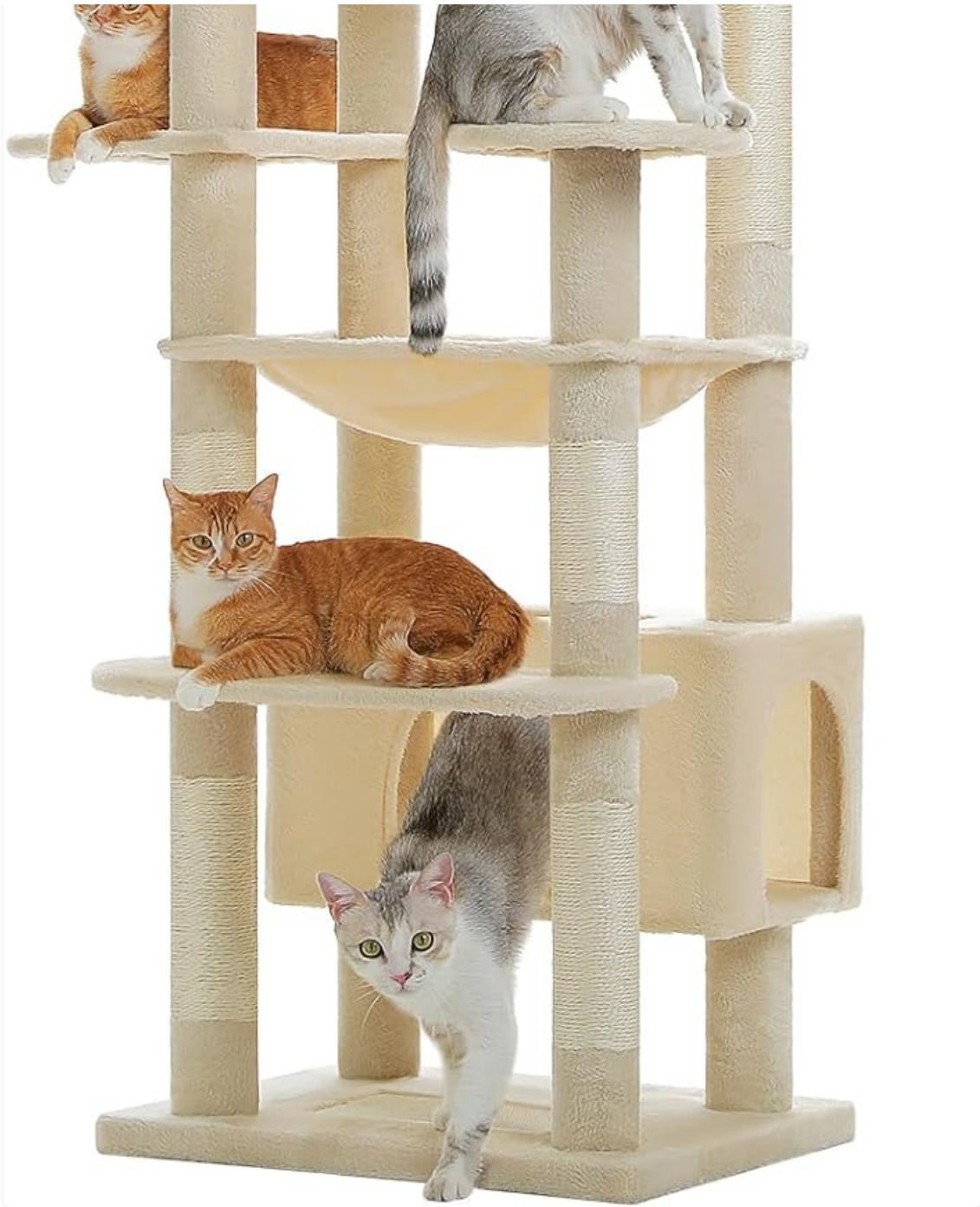
Image 1: The PAWZ Road 81-Inch Cat Tree in beige, showcasing its multi-level design with several cats enjoying the various platforms and condos.