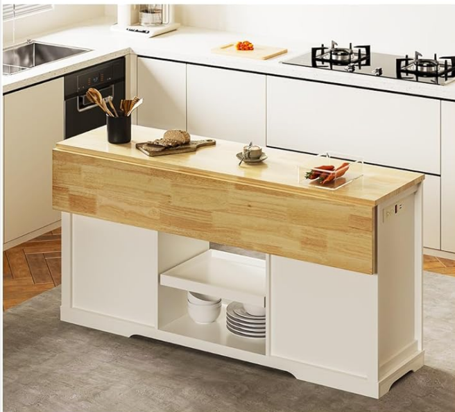
Fold up desktop

Simply open or close the latch, and it's done in one step.