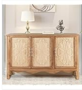
Figure 5.1: The rubberwood tabletop is designed for easy cleaning and water resistance. Promptly wipe spills with a soft cloth.