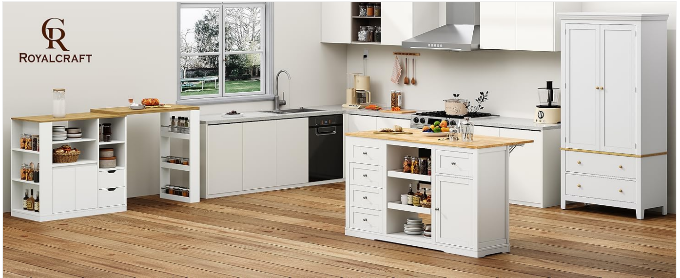
Figure 8.1: RoyalCraft customer support is available to assist with product inquiries.

RoyalCraft prioritizes customer satisfaction and offers support for its products. For any questions regarding assembly, operation, missing parts, or warranty claims, please contact RoyalCraft customer service. Refer to the packaging or included documentation for specific warranty details and contact information. You can typically reach support via email at support@royalcraft.store .