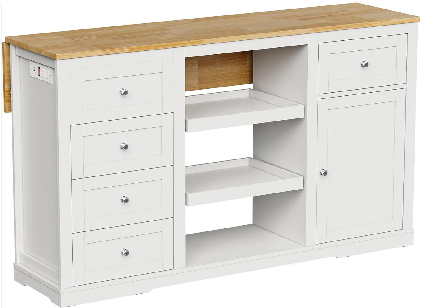
Figure 4.2: The kitchen island demonstrating its ample storage space with open drawers and pull-out trays, organized with kitchen essentials.

accommodate various items, from small dishes to larger appliances.