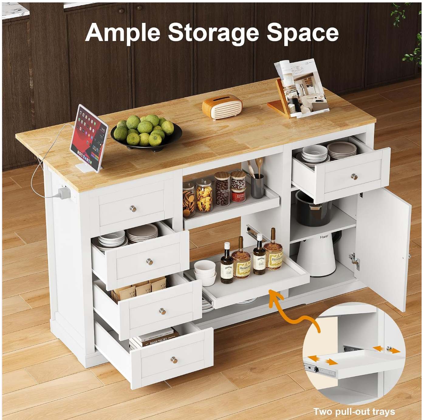
Two pull-out trays