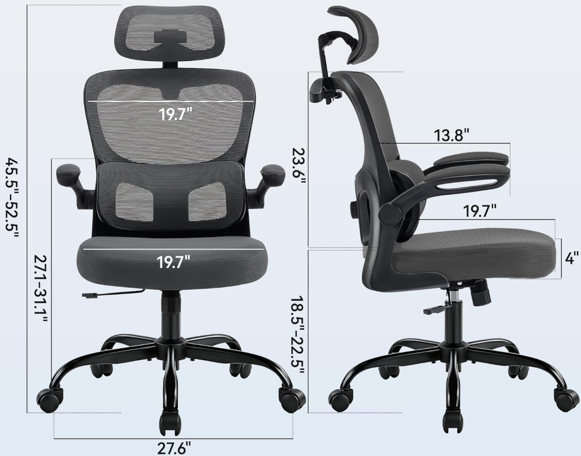
Diagram showing the chair's dimensions, including the seat height adjustment range.