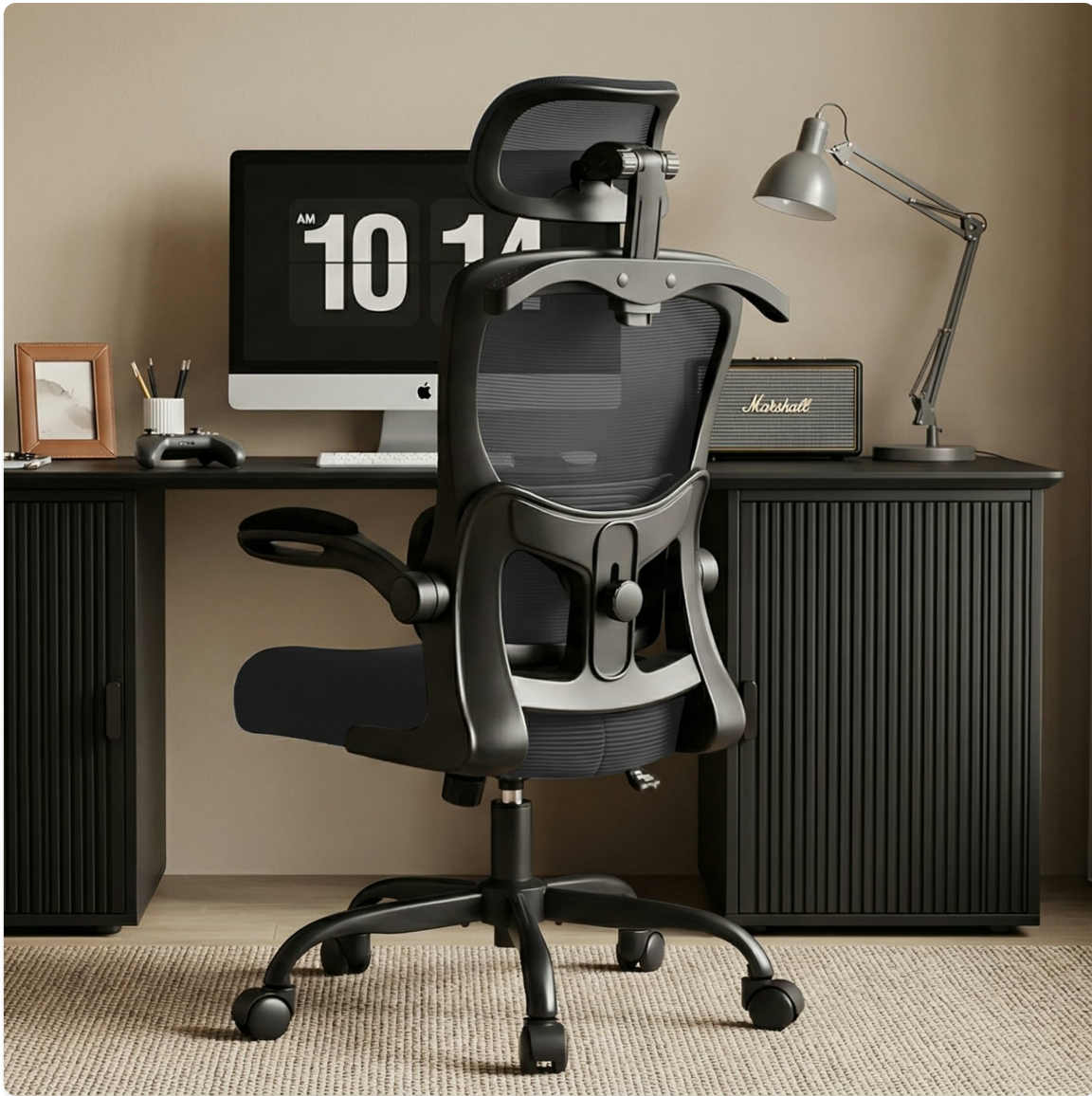
The AreShark MC02 Ergonomic Office Chair, designed for comfort and support.