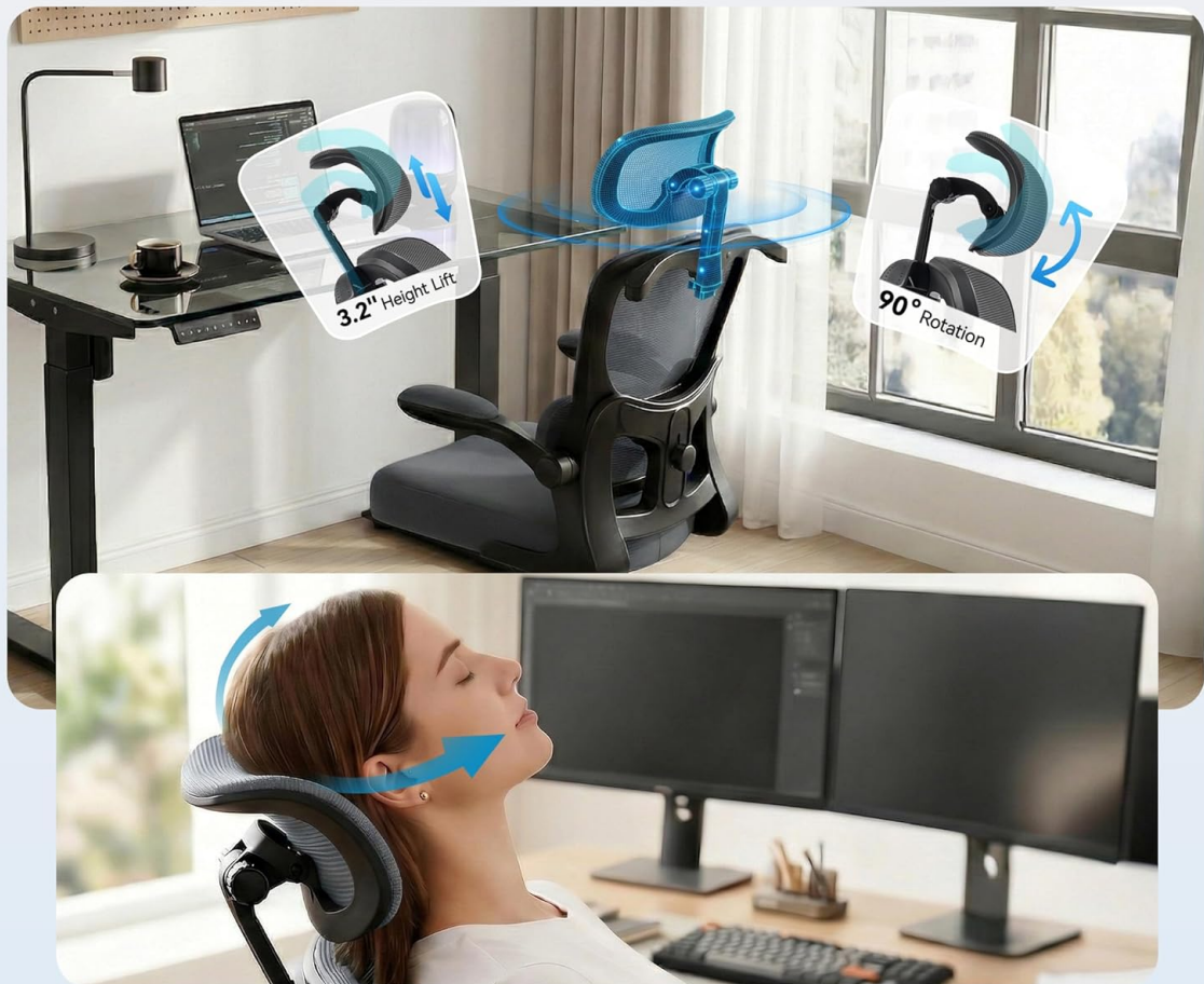
Image illustrating the vertical and rotational adjustments of the headrest.