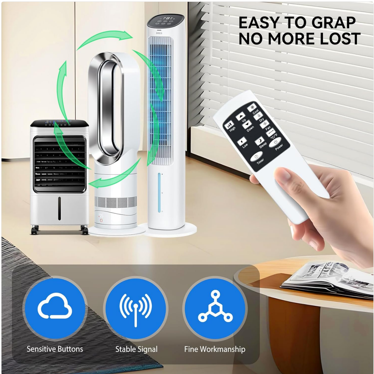
Image: The remote control's ergonomic design and responsive features, including sensitive buttons and stable signal.