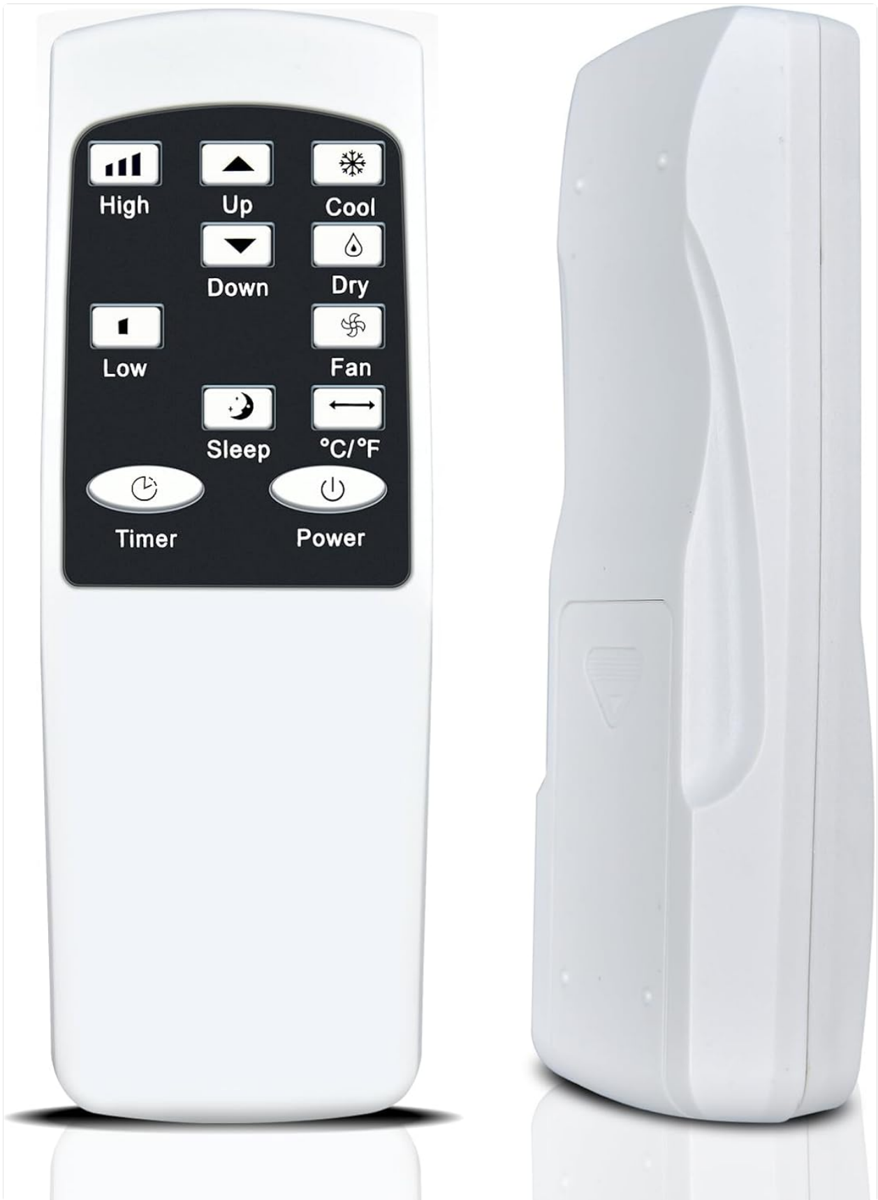
Image: Front and side views of the remote control, displaying its layout and buttons.