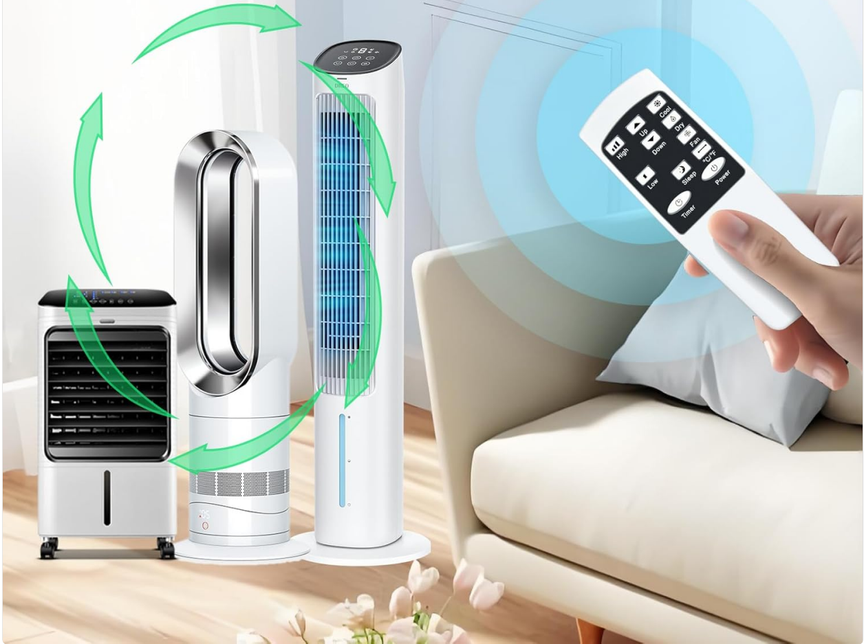
Image: The remote control in a home environment, highlighting its ease of use for a comfortable life.