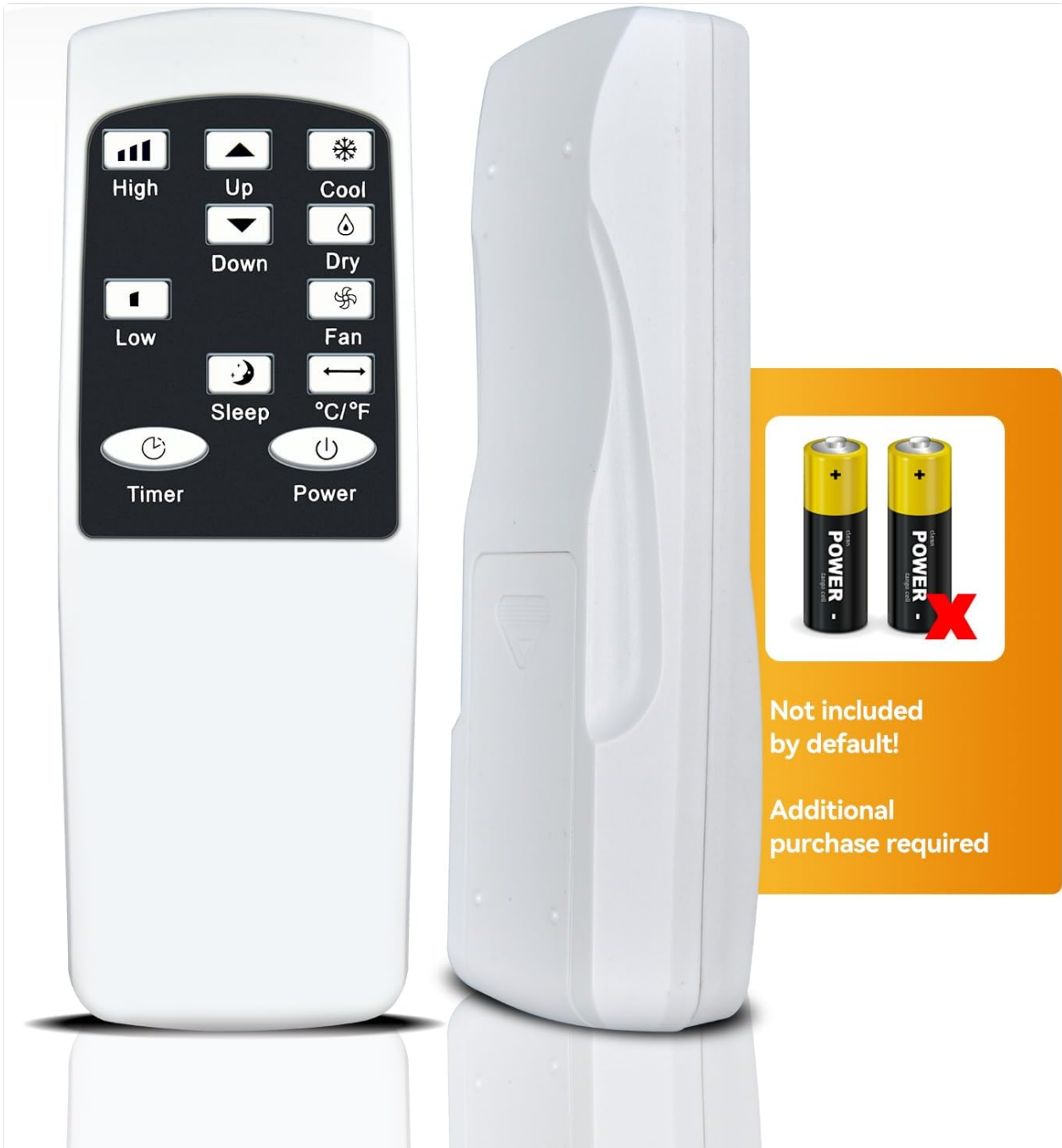
Image: The remote control's battery compartment, illustrating that batteries are not included with the product.