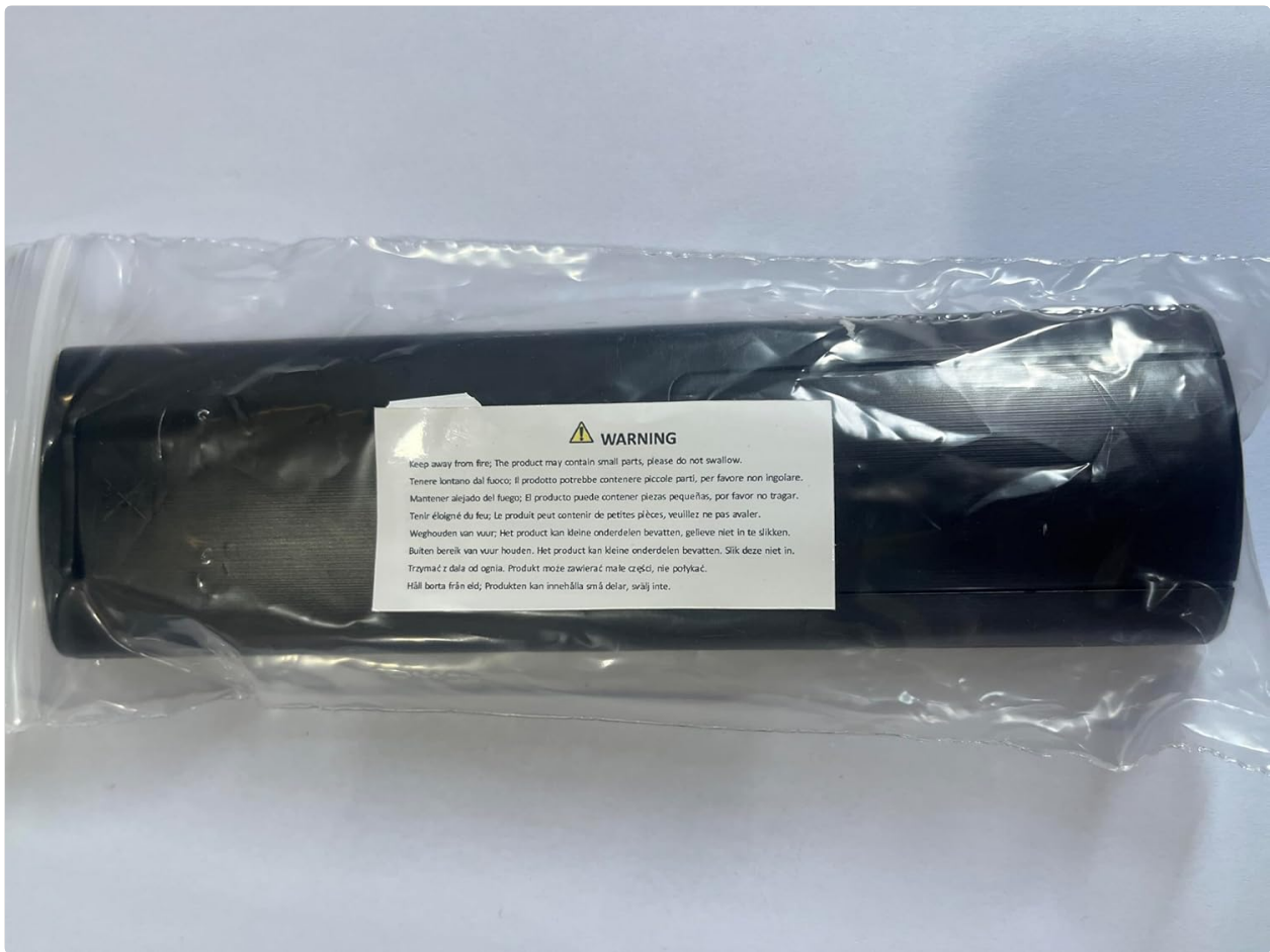
Image: A warning label emphasizing the presence of small parts and the need to keep the product away from fire.