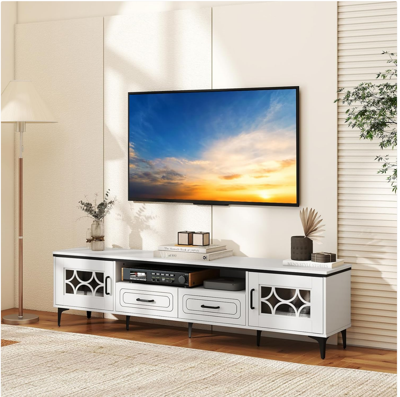
Image: The TV stand positioned in a modern living room, demonstrating its suitability for various interior designs.