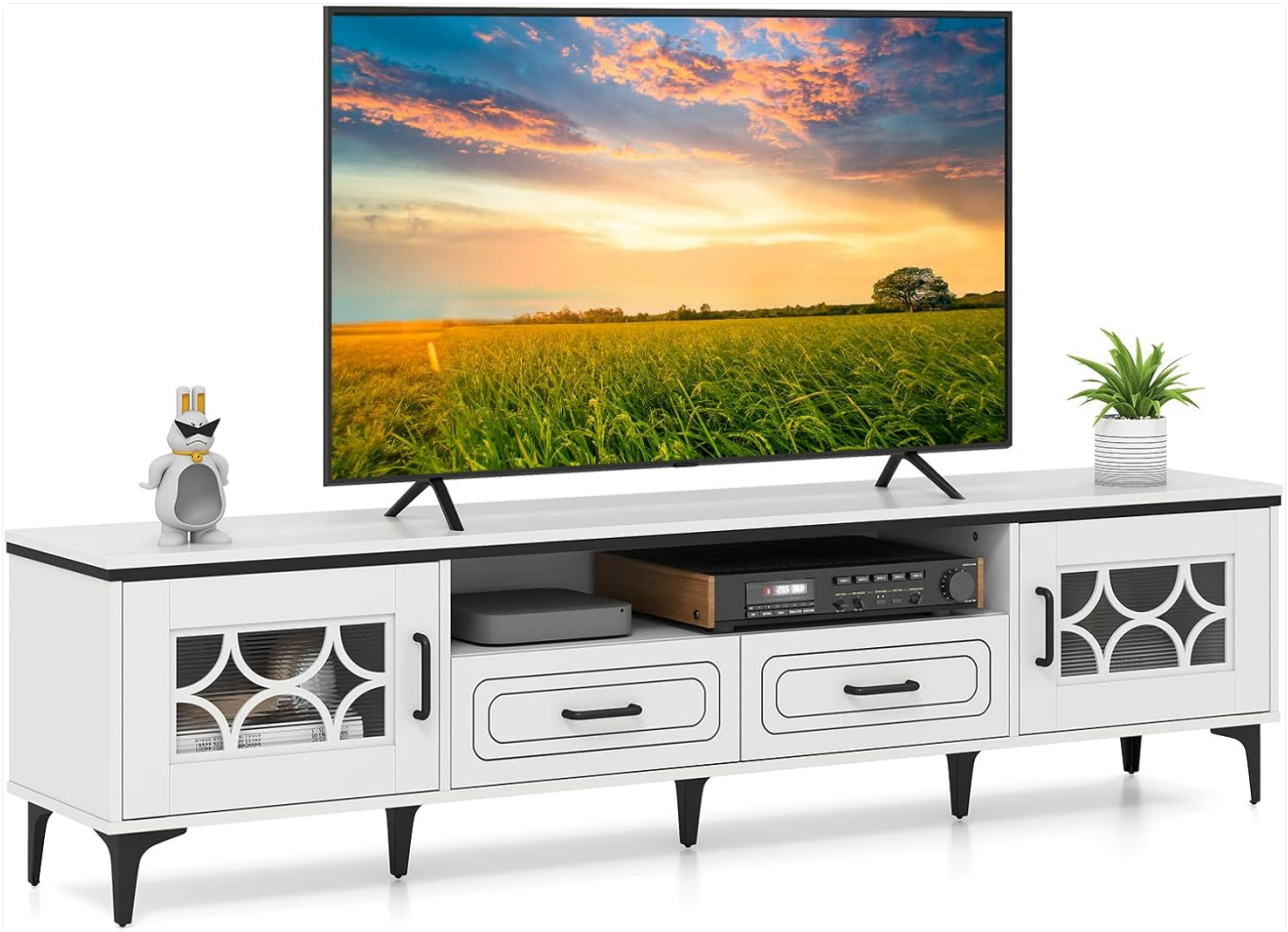
Image: The Tangkula Farmhouse TV Stand in antique white, supporting a large television, with decorative items and media devices in its compartments.

This stand features two pull-out drawers, two spacious cabinets, and an open compartment, ensuring all your entertainment essentials are neatly organized. Supported by seven raised metal legs, it offers enhanced stability and durability. A convenient cable management hole helps maintain a tidy appearance by concealing wires.