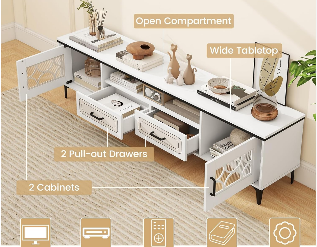
Image: An overhead view illustrating the various storage options: a wide tabletop, an open central compartment, two pull-out drawers, and two side cabinets.