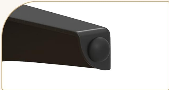
Non-slip Foot Pads