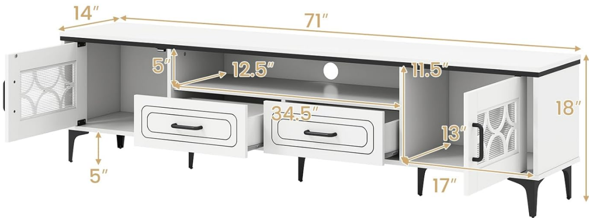
Image: A comprehensive diagram illustrating all key dimensions of the TV stand and its internal storage areas, along with weight capacities.