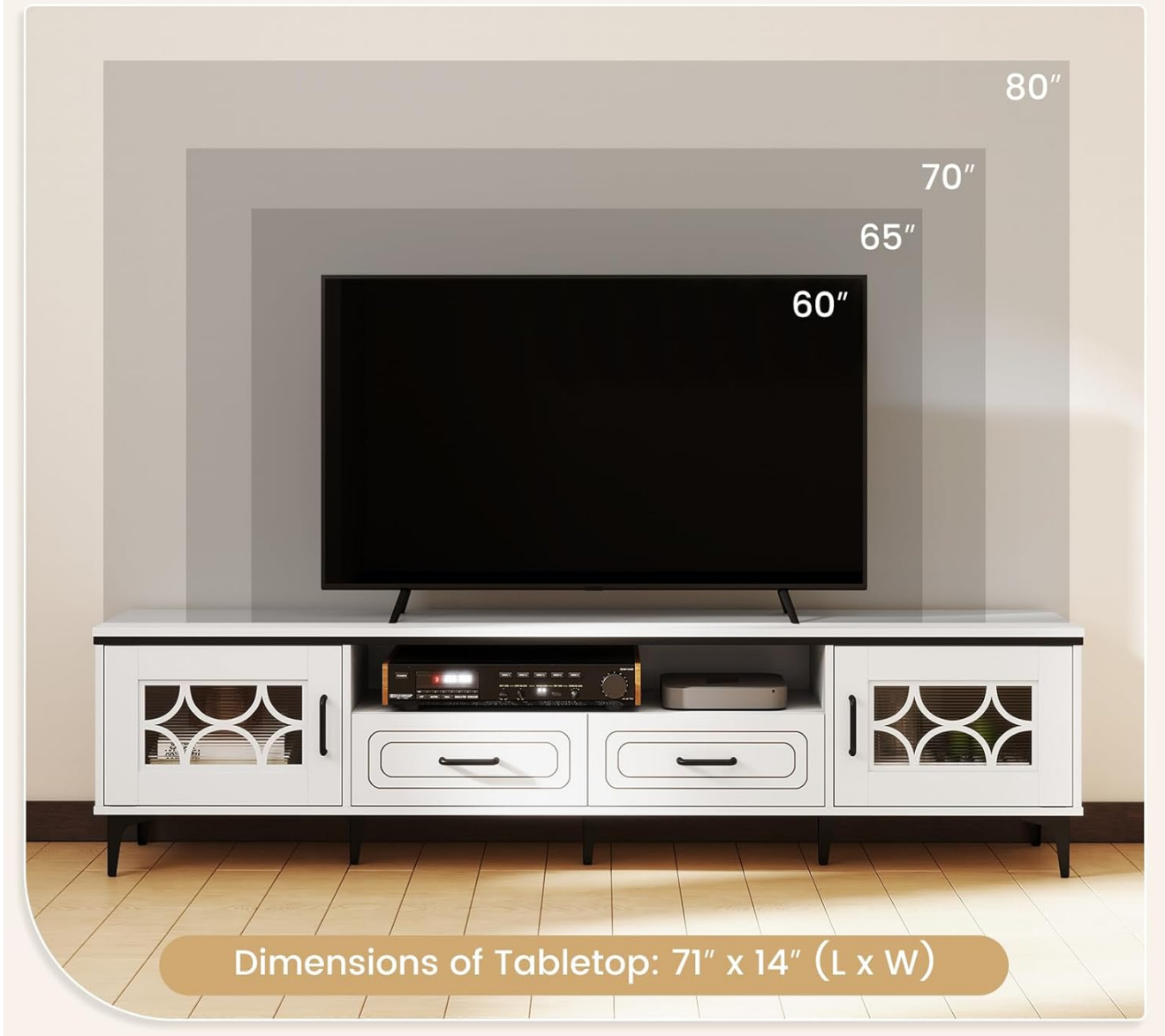
Image: A visual guide demonstrating the TV stand's capacity to hold flat screen TVs ranging from 60 to 80 inches, highlighting the 71" x 14" tabletop dimensions.