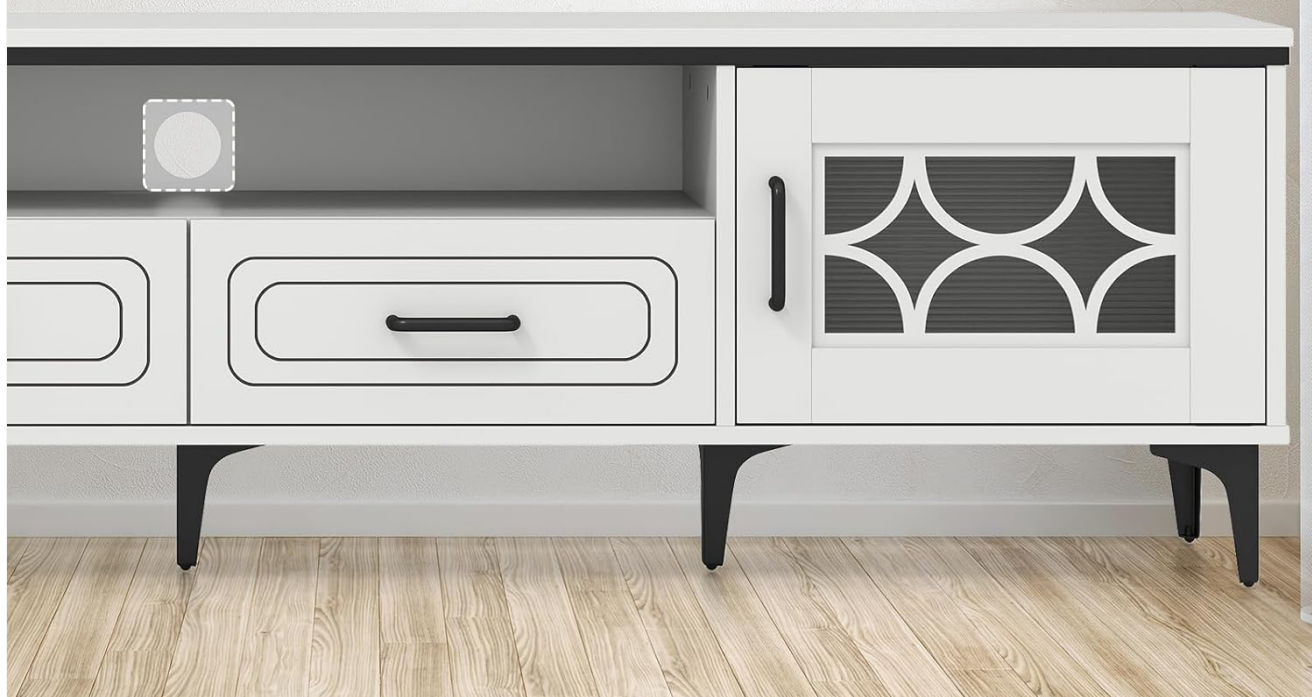
Image: A detailed view of the cable management hole located at the back of the TV stand, designed to keep wires tidy.