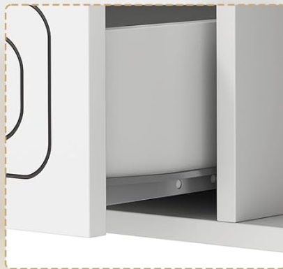
Smooth Metal Drawer Slides