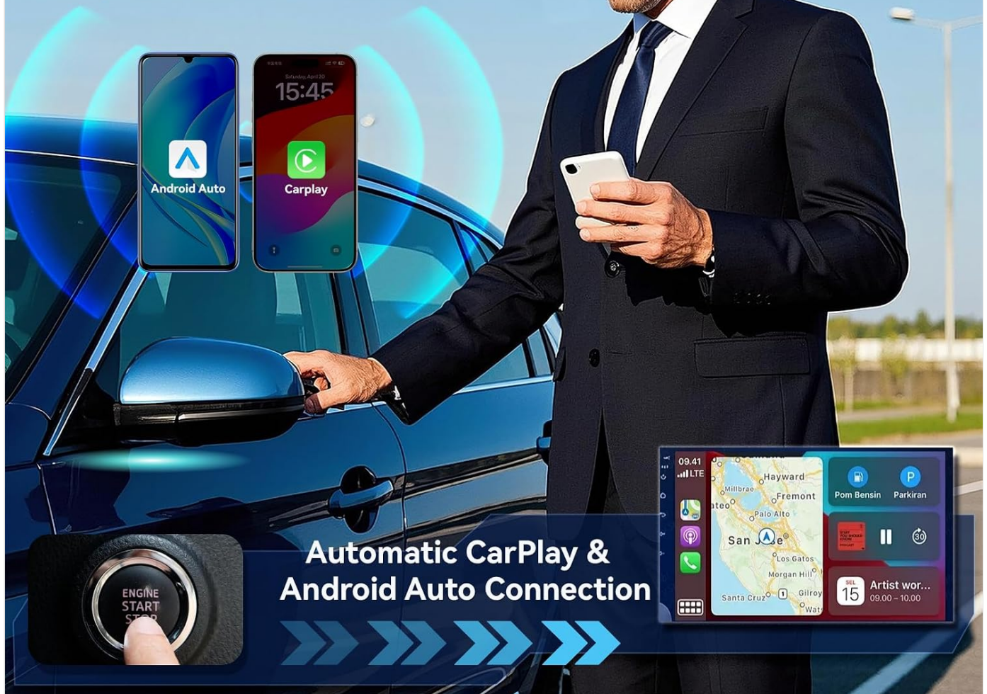
Image: Depiction of the automatic wireless connection feature, where the adapter connects to the phone upon entering the car.

After pairing, just turn on your phone's Wi-Fi and Bluetooth for quick reconnection next time