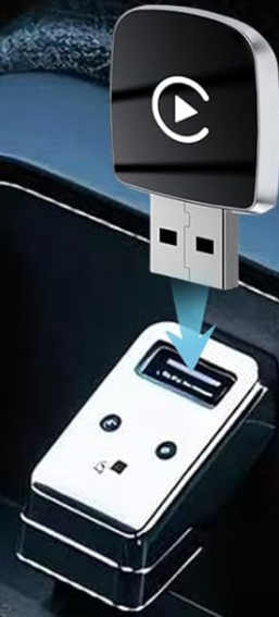
Image: Visual guide illustrating the three-step plug-and-play setup process for the wireless adapter.

Connect to enjoy wireless Carplay&Android auto function