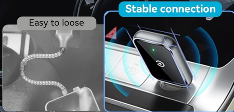
Image: The compact size of the Hantan adapter, compared to a US quarter, highlighting its stable connection design.