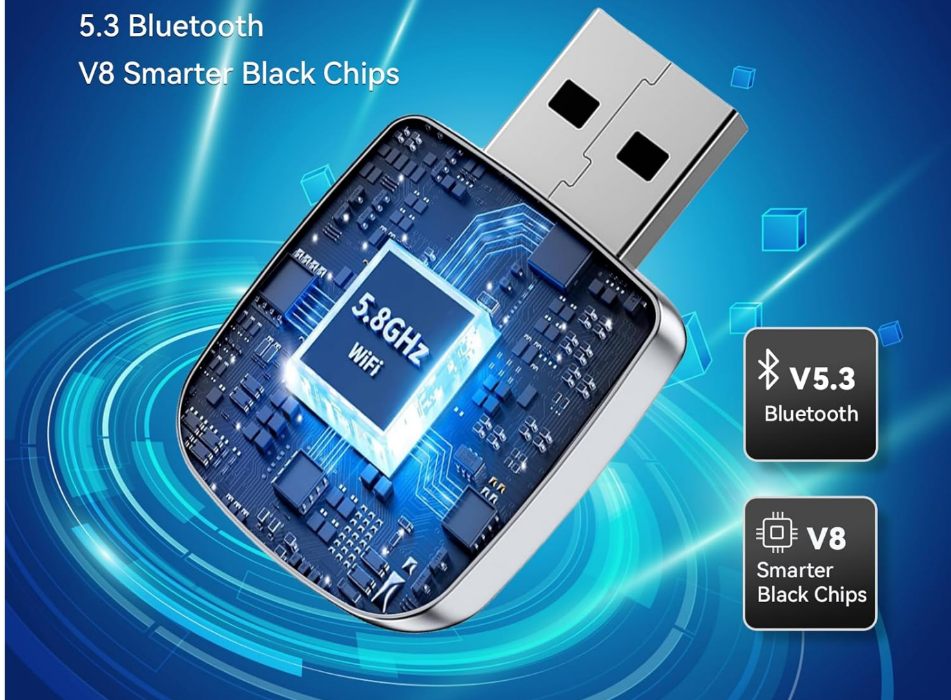
Image: Close-up of the adapter's internal components, emphasizing the 5.8GHz WiFi and Bluetooth 5.3 technology for stable connection.