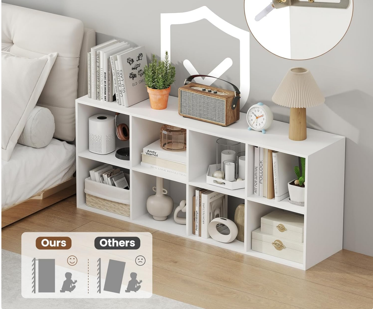
Image: Illustration of the anti-toppling kit, emphasizing safety and stability.