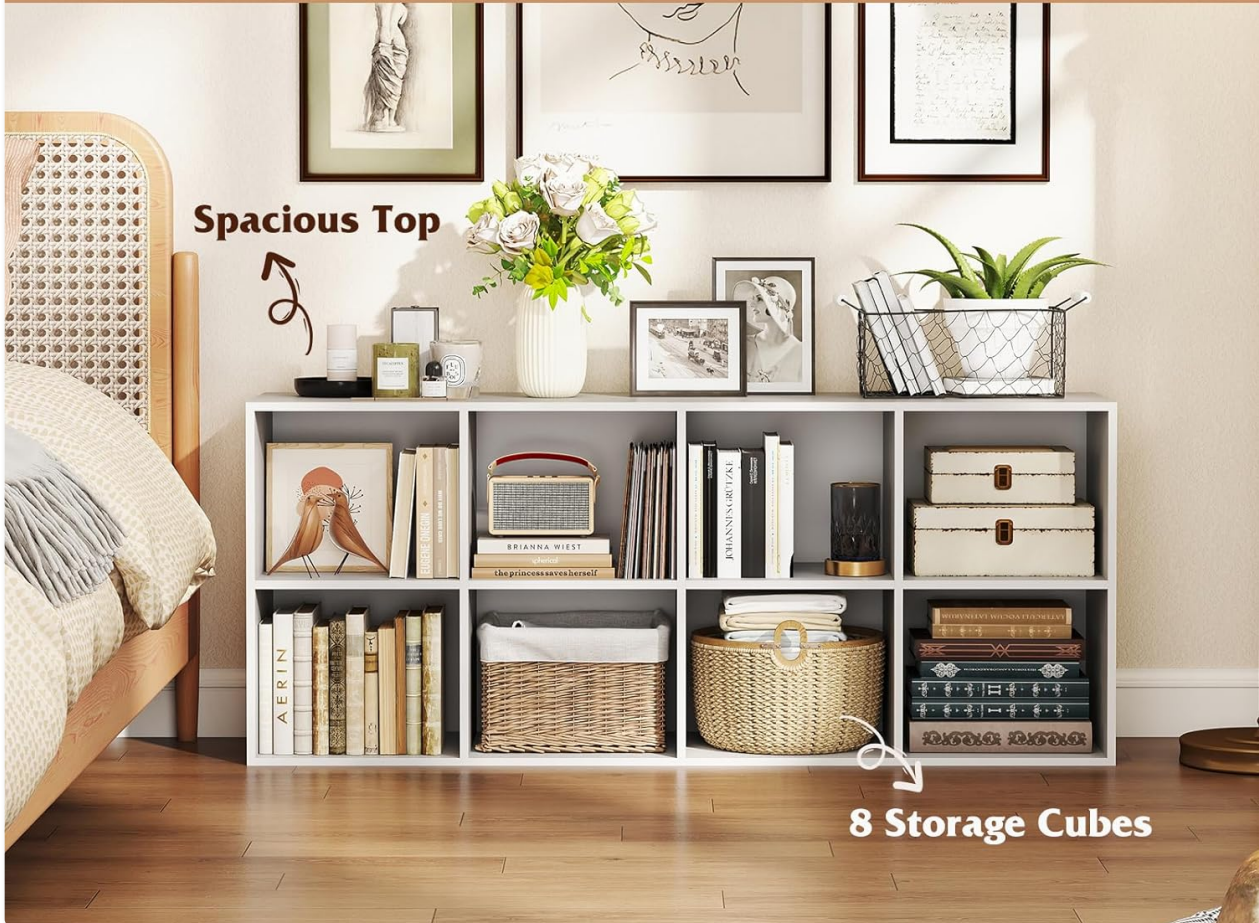
Image: Examples of items that can be stored and displayed in the 8-cube bookcase.