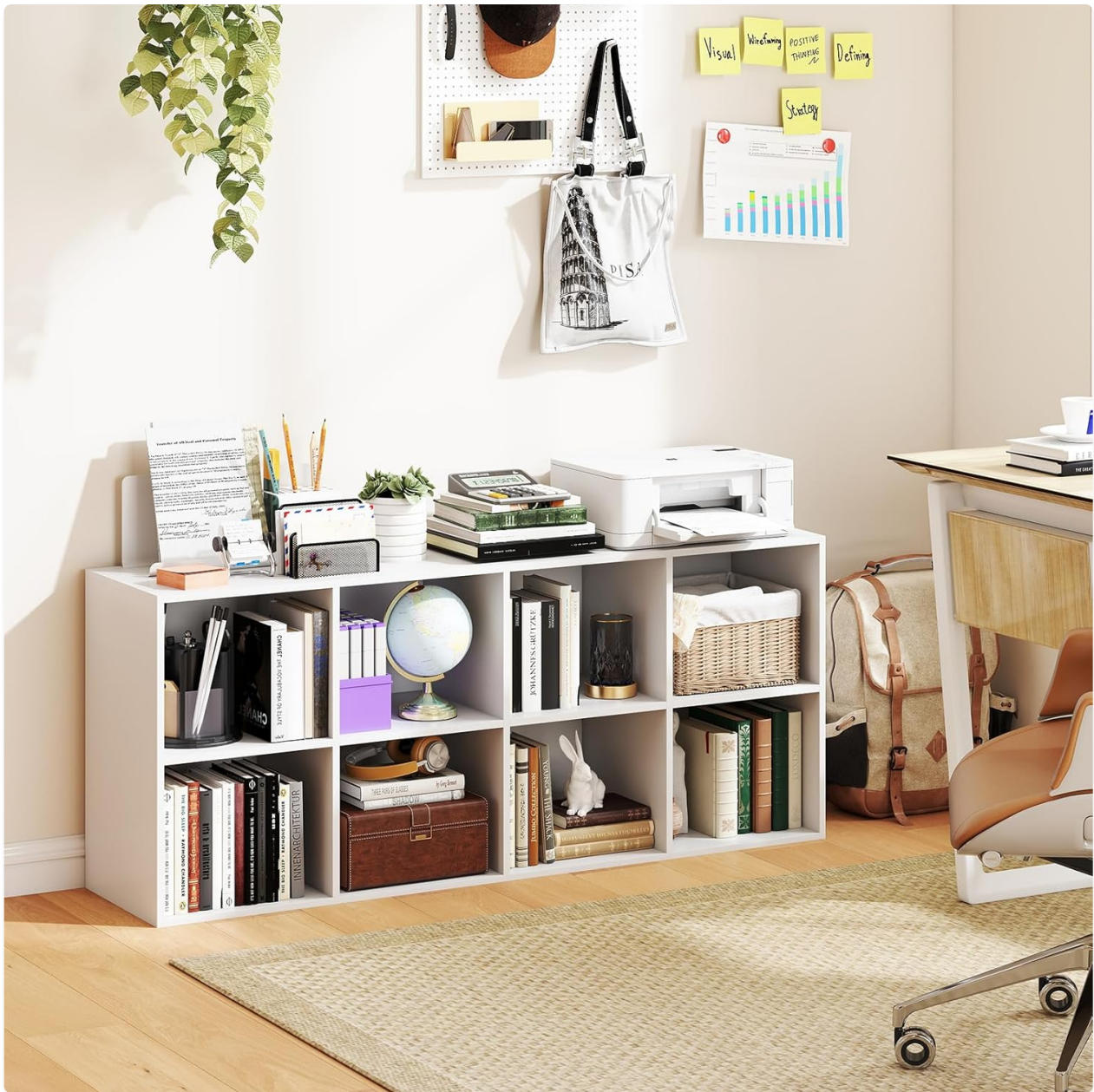
Image: The IFANNY 8 Cube Bookcase, showcasing its storage capacity and modern design in a home office environment.