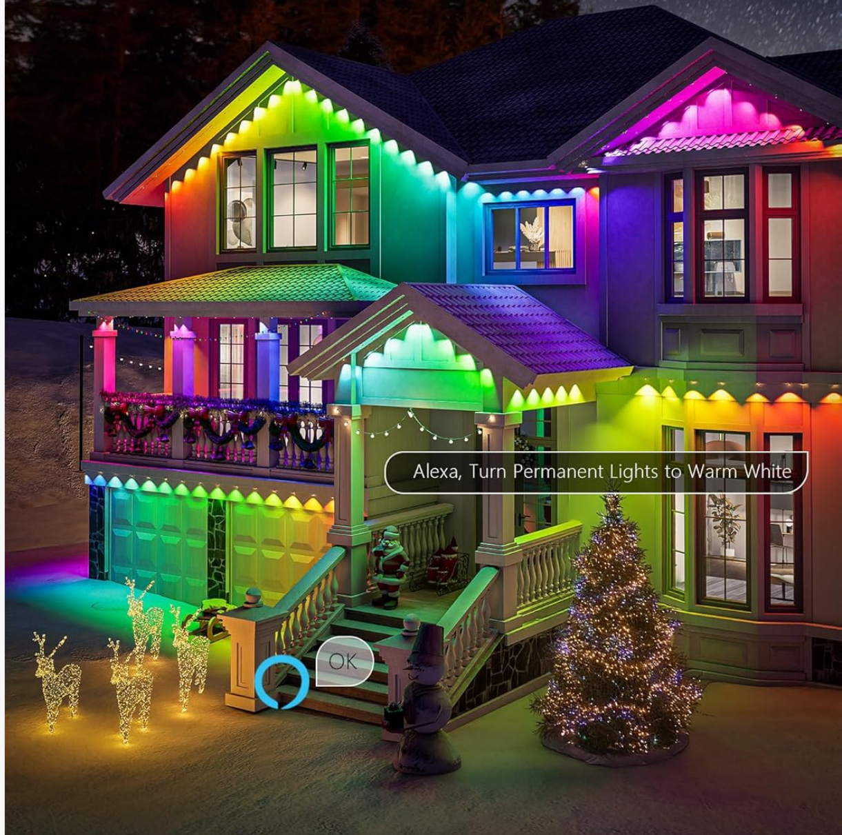
Image: A house illuminated with multi-colored Brizled lights, demonstrating voice control compatibility with Alexa and Google Assistant.

Your browser does not support the video tag.