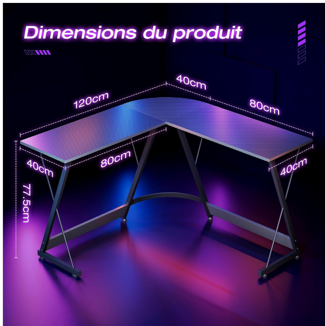
Figure 2: Product dimensions for planning your space.