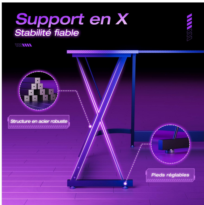
Figure 3: Detail of the robust X-shaped metal support and adjustable feet for stability.