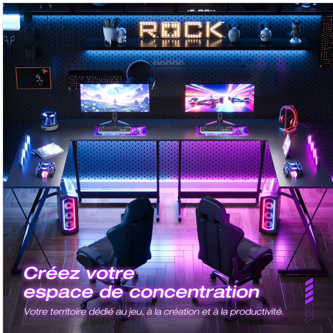
Figure 5: Example of creating a focused gaming or productivity space.