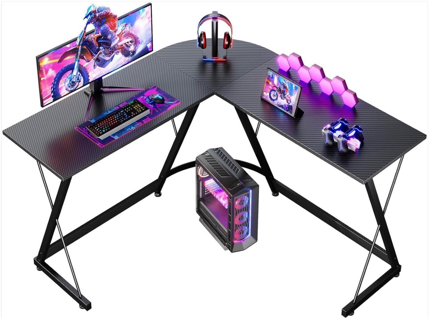
Figure 1: ODK L-Shaped Gaming Desk in a typical gaming environment.