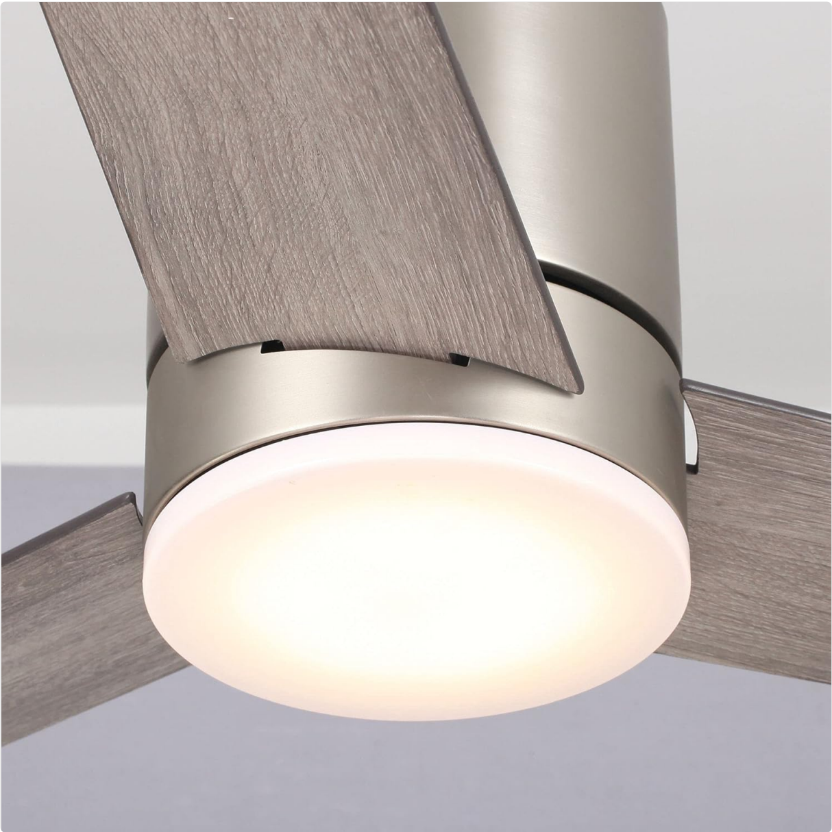
Image: The illuminated LED light panel of the fan, demonstrating its brightness and integrated design.