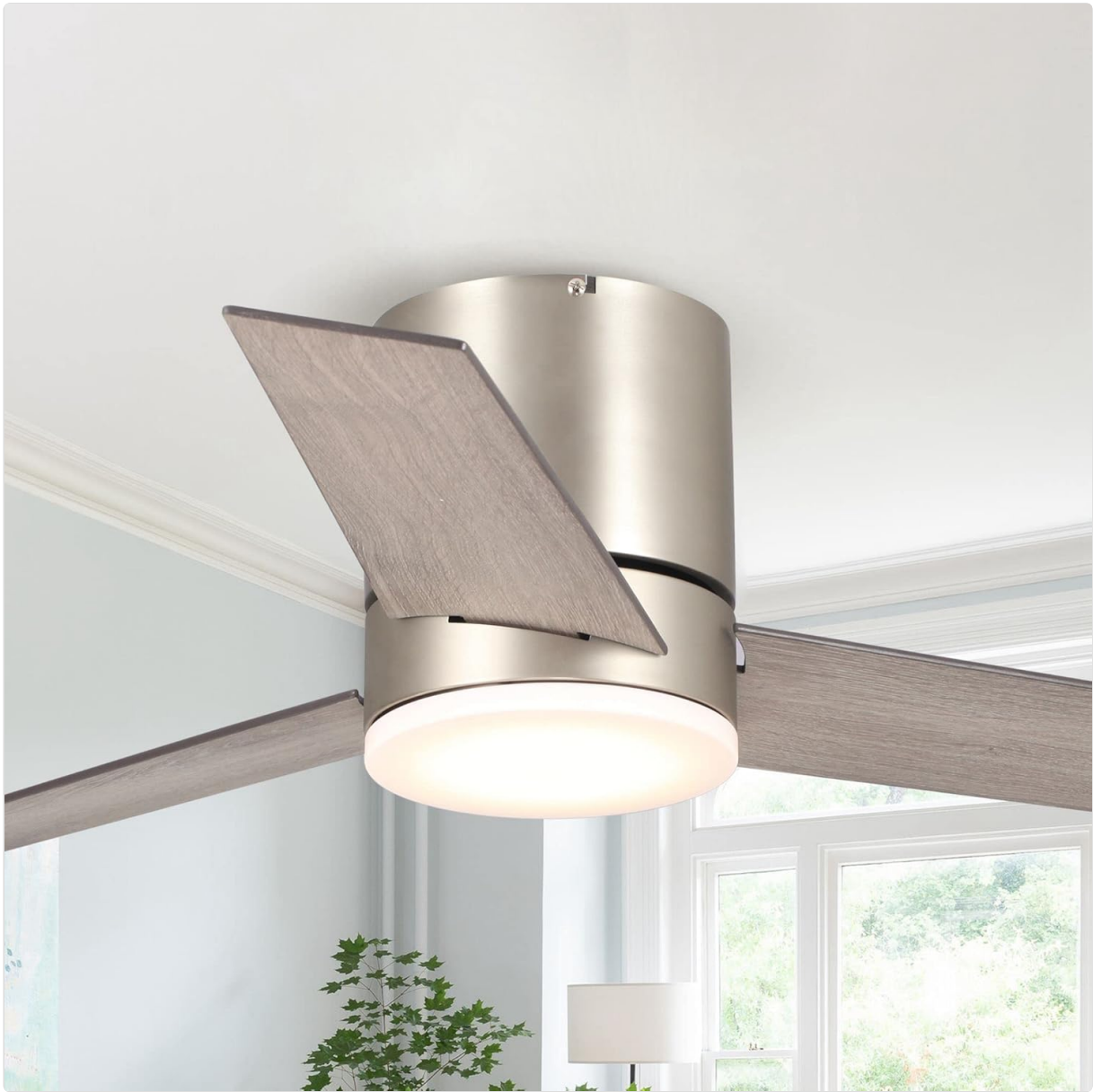
Image: A detailed view of the fan's main body, highlighting the brushed nickel finish and the attachment point for the blades.