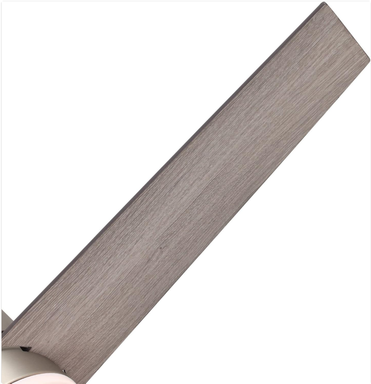
Image: A close-up view of one of the fan blades, highlighting its reversible wood-grain texture and finish.