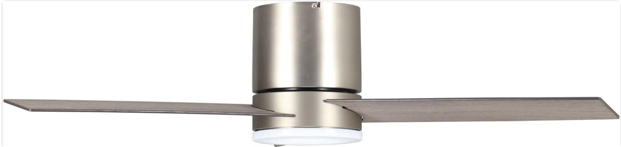
Image: A detailed view of the fan's central unit, showing the semi-matte nickel finish and the integrated LED light panel.