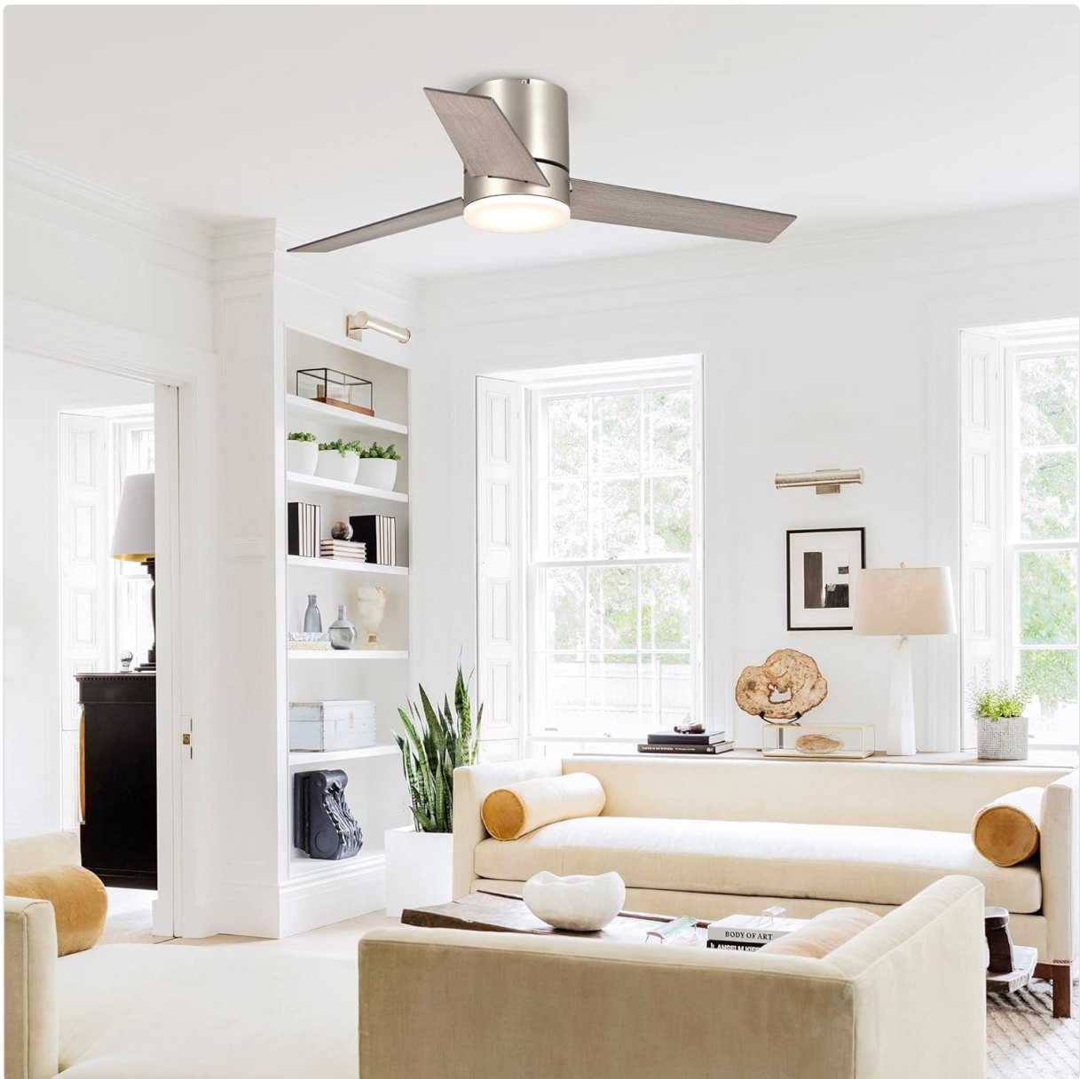
Image: The Vaczon 48 Inch Low Profile Ceiling Fan with light installed in a bright, modern living room, showcasing its sleek design and how it complements the decor.