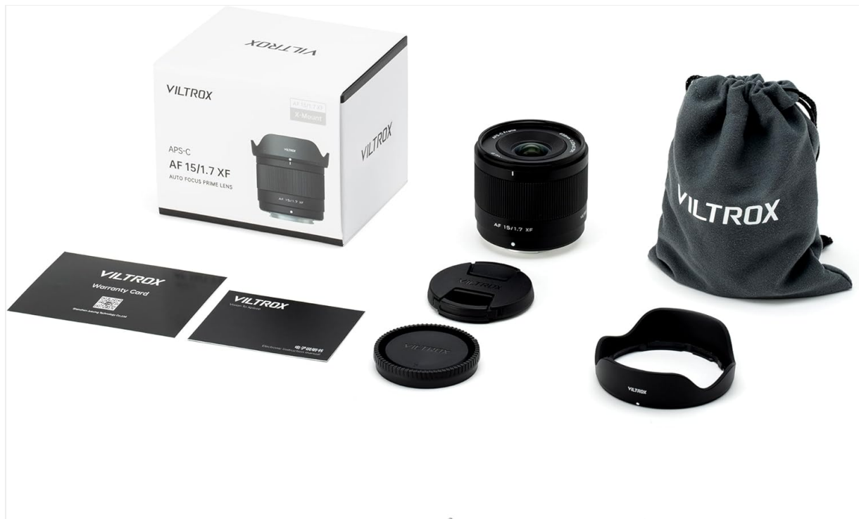
Figure 1: Package Contents