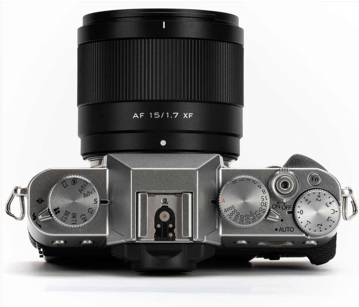
Figure 2: Lens mounted on a Fujifilm camera