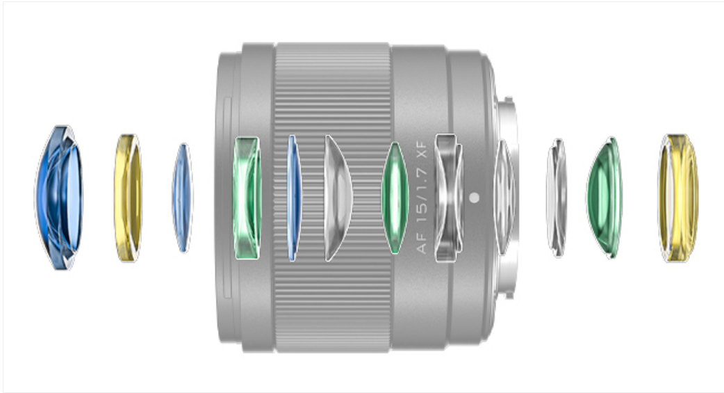
Figure 4: Optical Structure Diagram