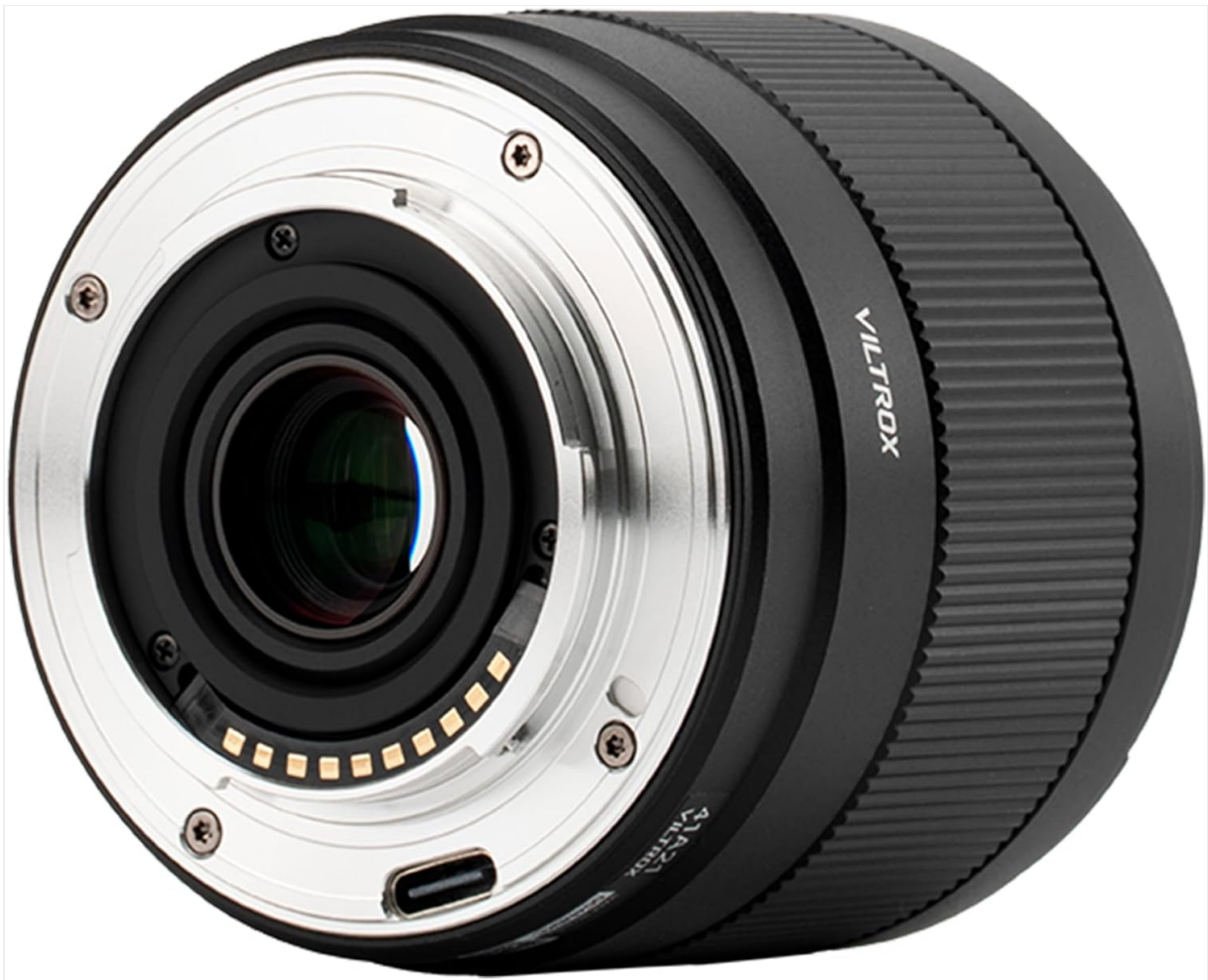
Figure 3: USB-C port for firmware updates