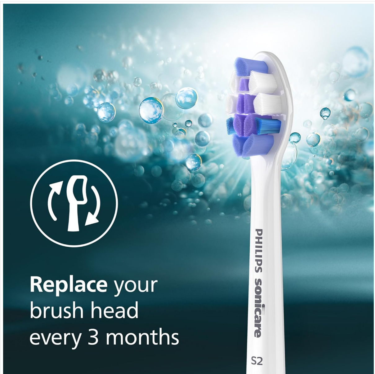
Image: An assortment of Philips Sonicare brush heads, including the S2 Sensitive, shown alongside a Philips Sonicare handle to illustrate universal click-on compatibility.