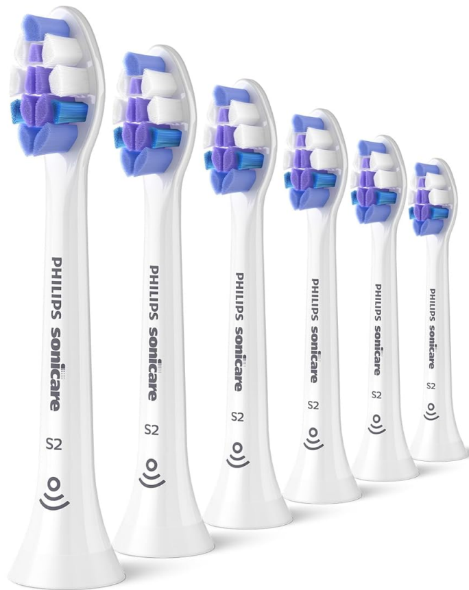
Image: Philips Sonicare S2 Sensitive replacement brush heads, showing a pack of six and individual heads.

Each S2 Sensitive brush head features long, thin, ultra-soft bristles, specifically engineered for a gentle touch. With over 3,000 densely packed bristles, these heads are capable of removing significantly more plaque than a manual toothbrush, even in areas that are typically difficult to reach.