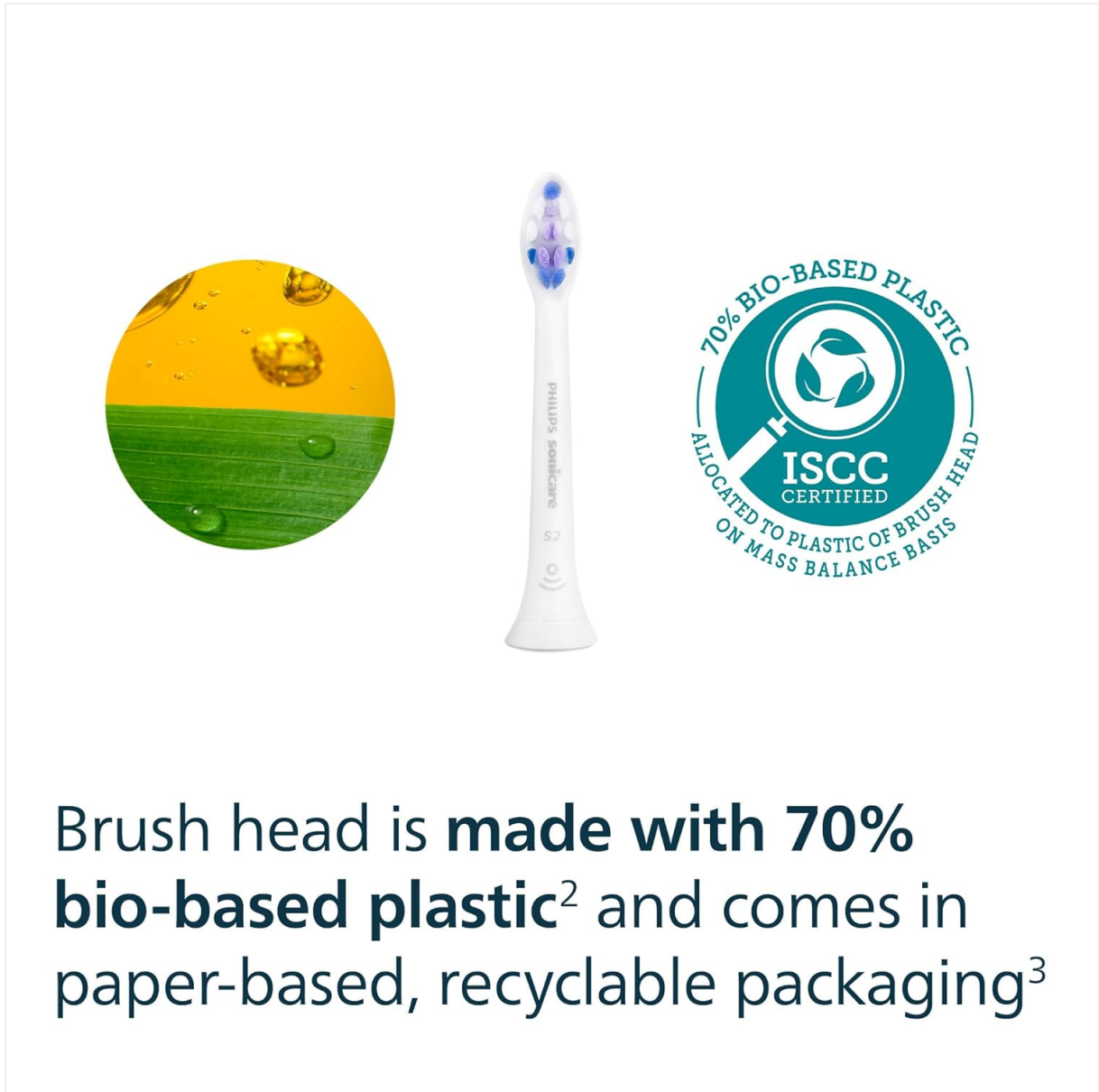
Image: Graphic illustrating the use of 70% bio-based plastic in the brush head and the recyclable paper-based packaging, with an ISCC certified logo.

Philips is committed to reducing environmental impact. The S2 Sensitive sonic toothbrush replacement heads are made with 70% bio-based plastic (allocated to plastic of brush head on mass balance basis). The packaging is paper-based and recyclable where facilities exist.