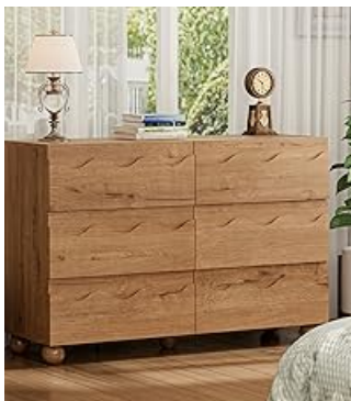
Image: Detail of the solid wood gourd-shaped leg.