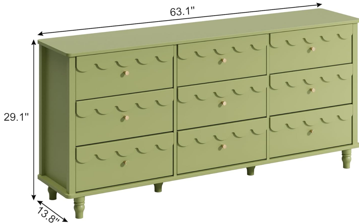
Image: Product dimensions diagram for the Anbuy 9-Drawer Scalloped Dresser.