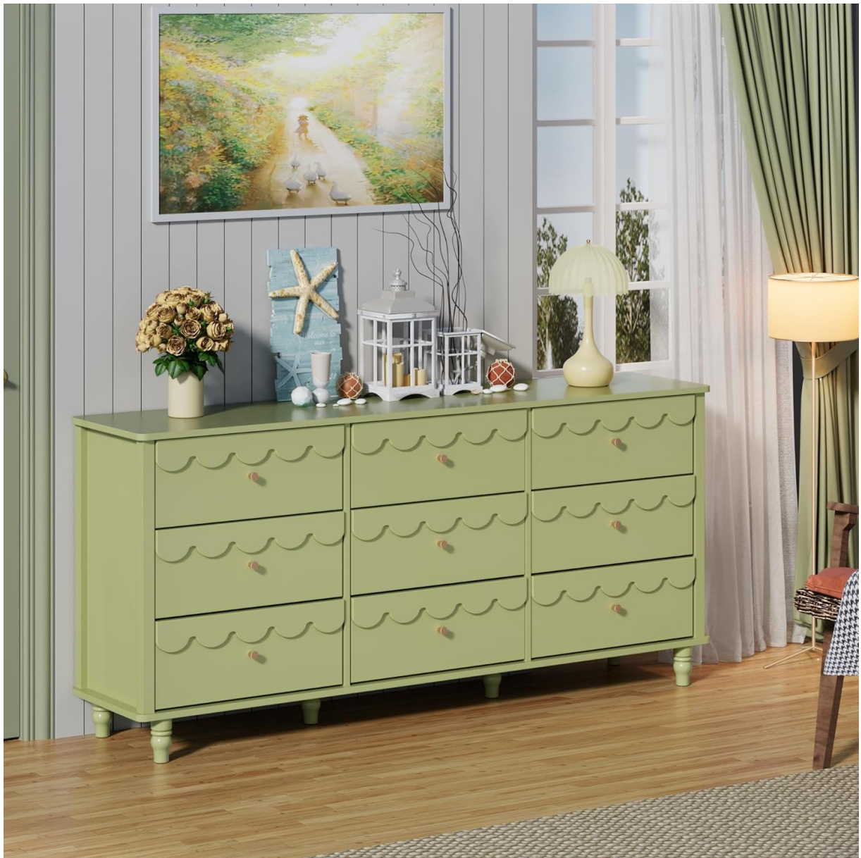
Image: The Anbuy 9-Drawer Scalloped Dresser, fully assembled and decorated.