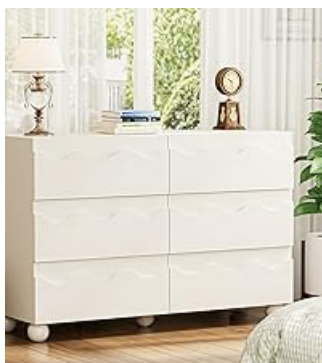
Image: Detail of the unique scalloped drawer front design.