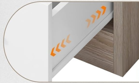
Smooth Drawers Slides

A close-up showing the three smooth-gliding storage drawers with their elegant handles, and an illustration of the drawer slide mechanism for easy operation. Proper assembly of these components is key for functionality.