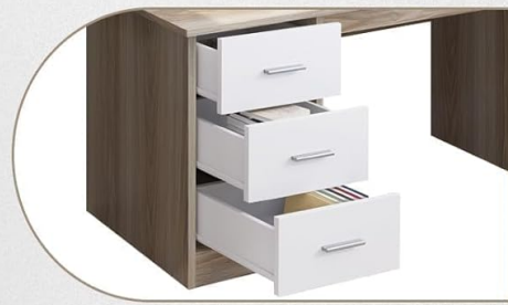
Ample Storage Space