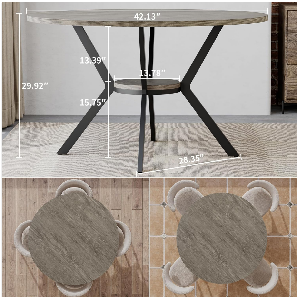
Image: Detailed dimensions of the 42-inch round dining table, including height and tabletop diameter.