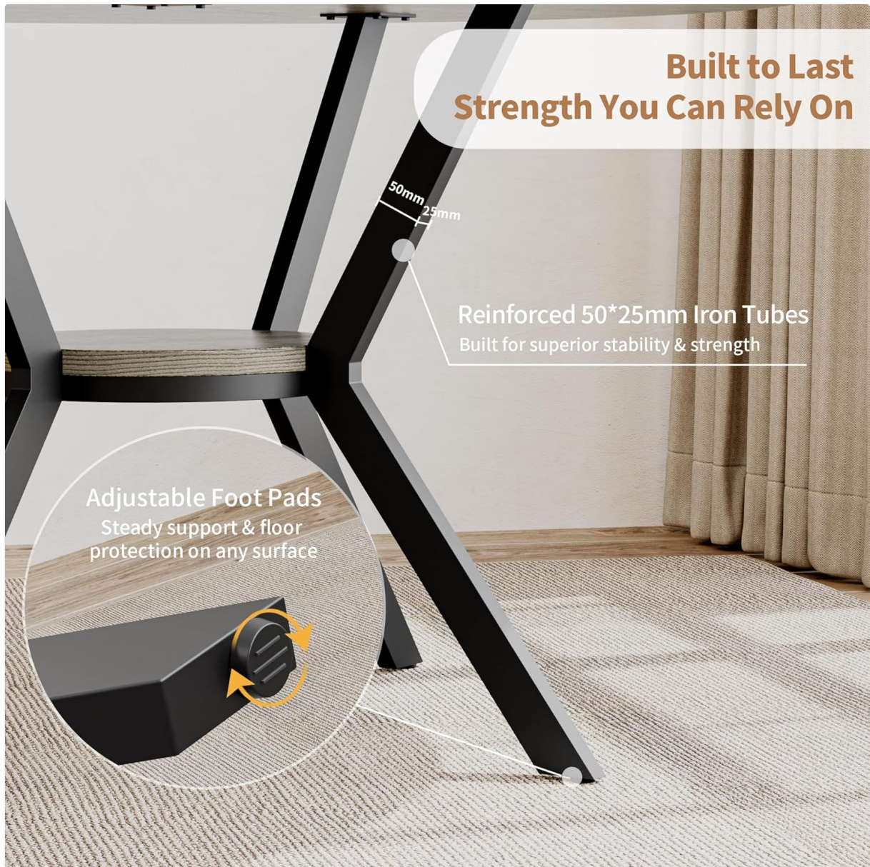
Image: Close-up view of the reinforced 50x25mm iron tubes forming the table legs and the adjustable, anti-slip foot pads for stability.