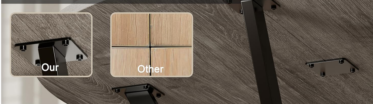
Image: Illustration of the metal fixing brackets used to secure the tabletop halves, highlighting the robust connection points.

Prevent loosening for a stable, seamless dining experience Only 2 table tops are joined together, ensuring easier installation and a seamless fit with minimal visible gaps