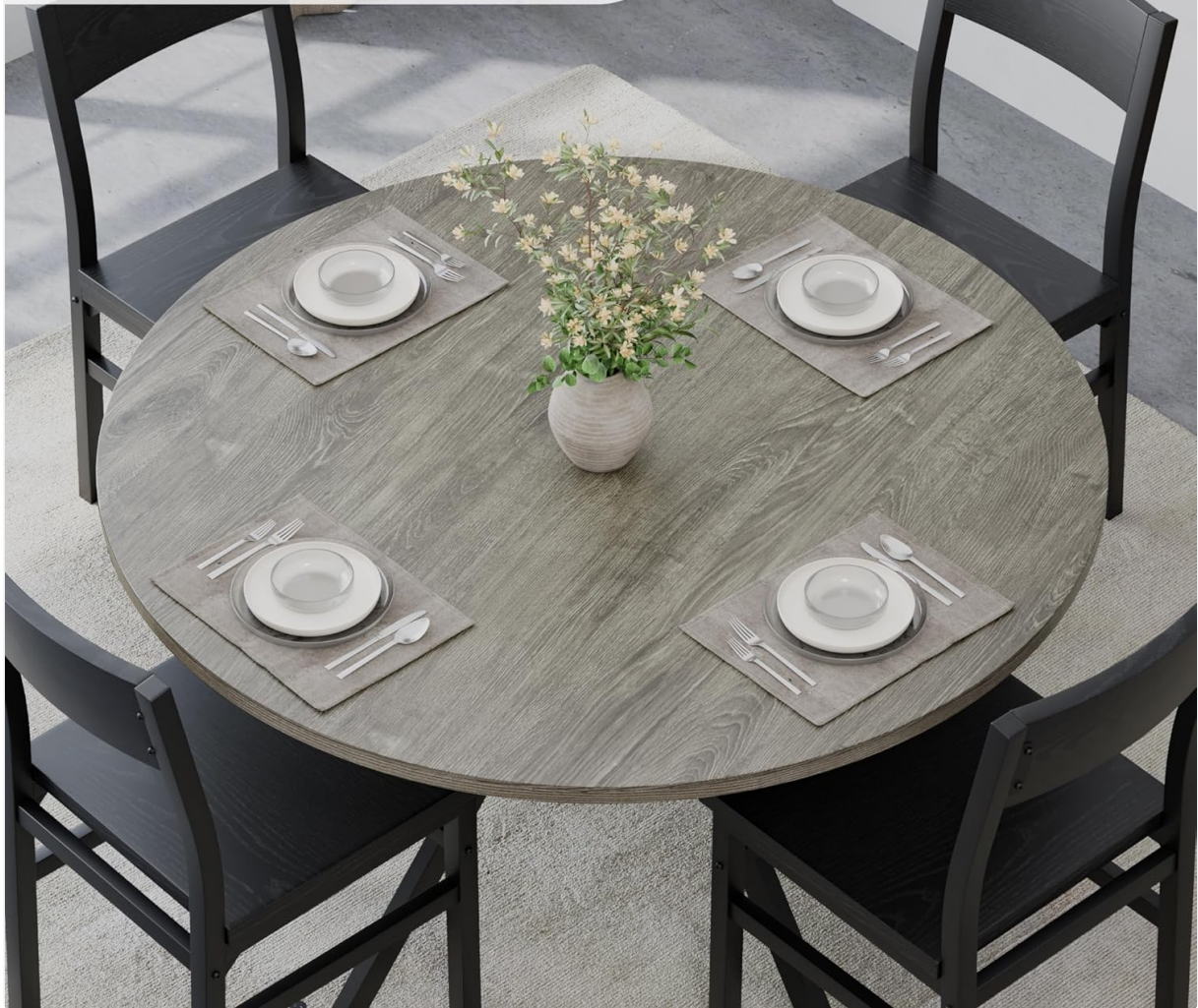
Image: The dining table featuring its convenient lower storage shelf, ideal for decorative items or small essentials.