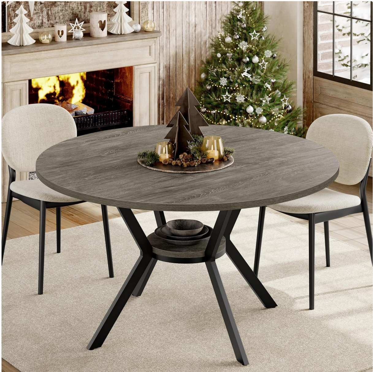
Image: The MECHYIN Round Dining Table (Model HH-14) in a modern dining room setting, showcasing its vintage gray tabletop and black metal legs.