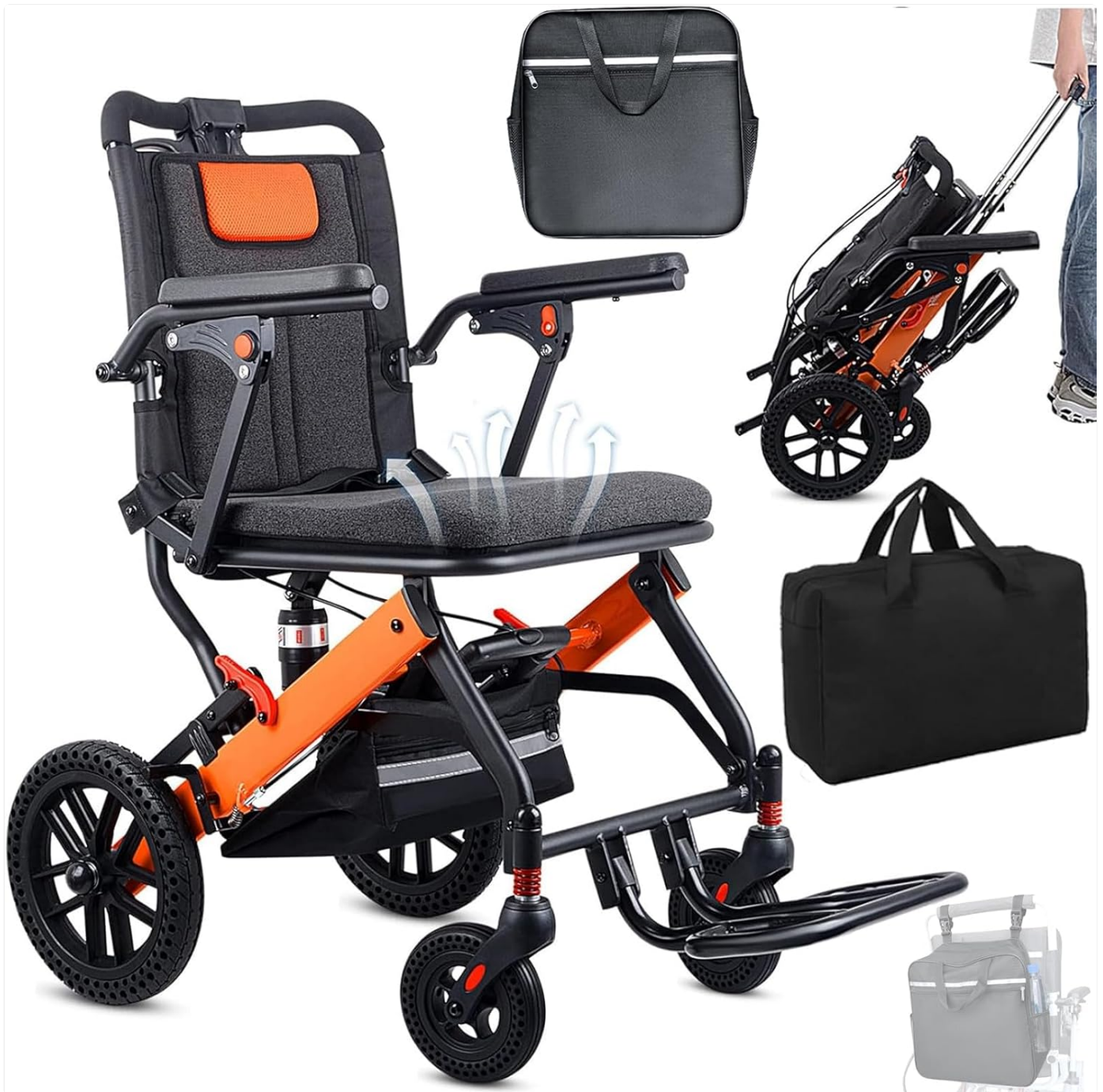
Figure 3: The Mujocooker M-Z80 wheelchair highlighting its integrated storage solutions, including a travel bag, a luxury back pocket, and a convenient under-seat storage pocket.