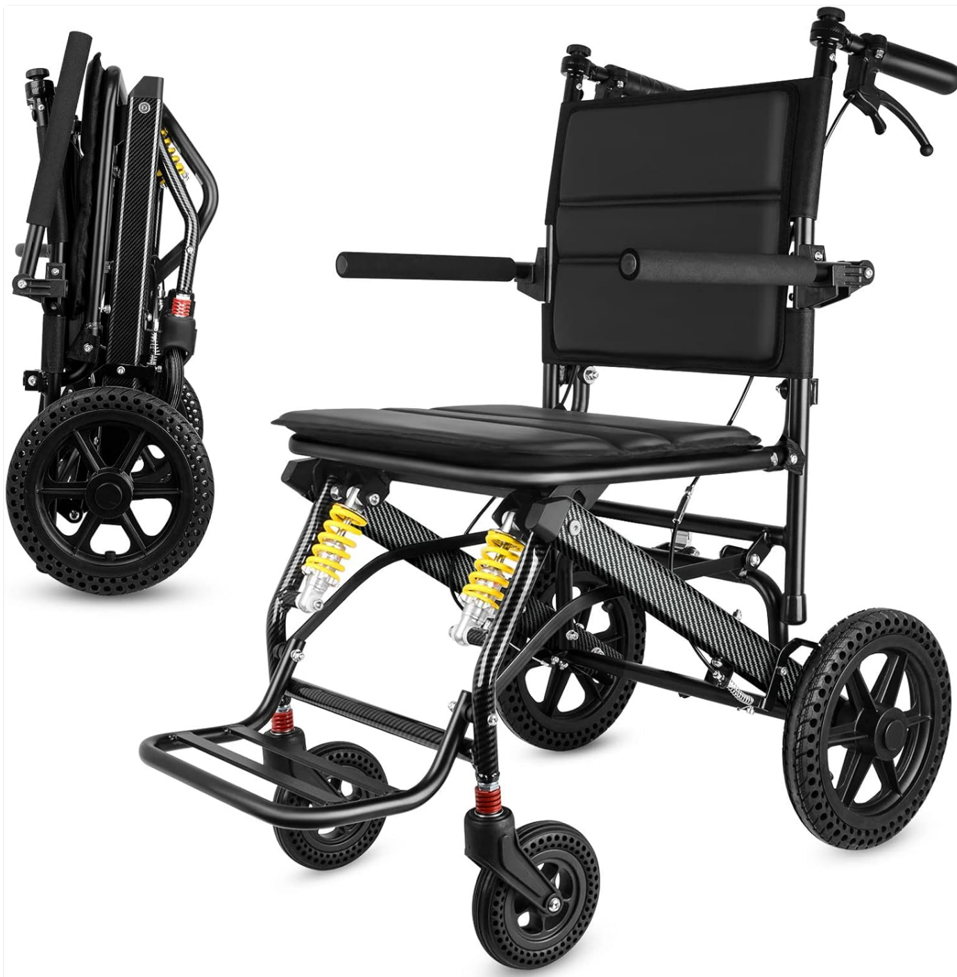
Figure 4: Visual representation of the Mujocooker M-Z80 transitioning from its folded, compact form to its fully unfolded, ready-to-use state.