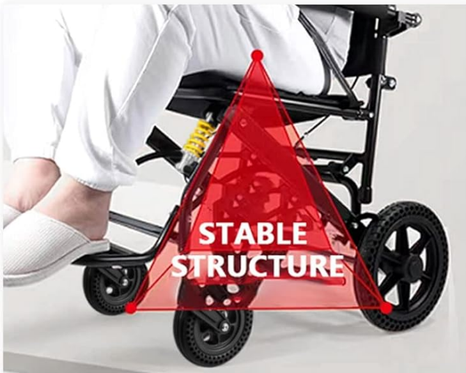
3 STABLE STRUCTURE Dispersed Stress Structure Is Stable