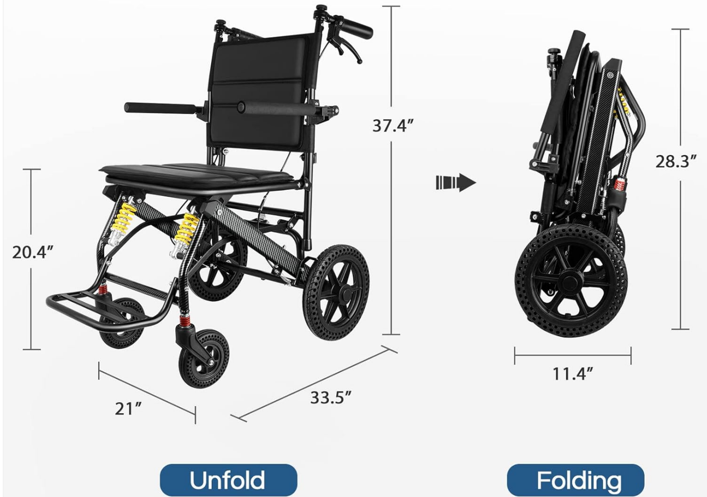
Figure 8: Detailed product dimensions for the Mujocooker M-Z80, illustrating its size when unfolded and its compact dimensions when folded, along with its 220 lbs weight capacity.