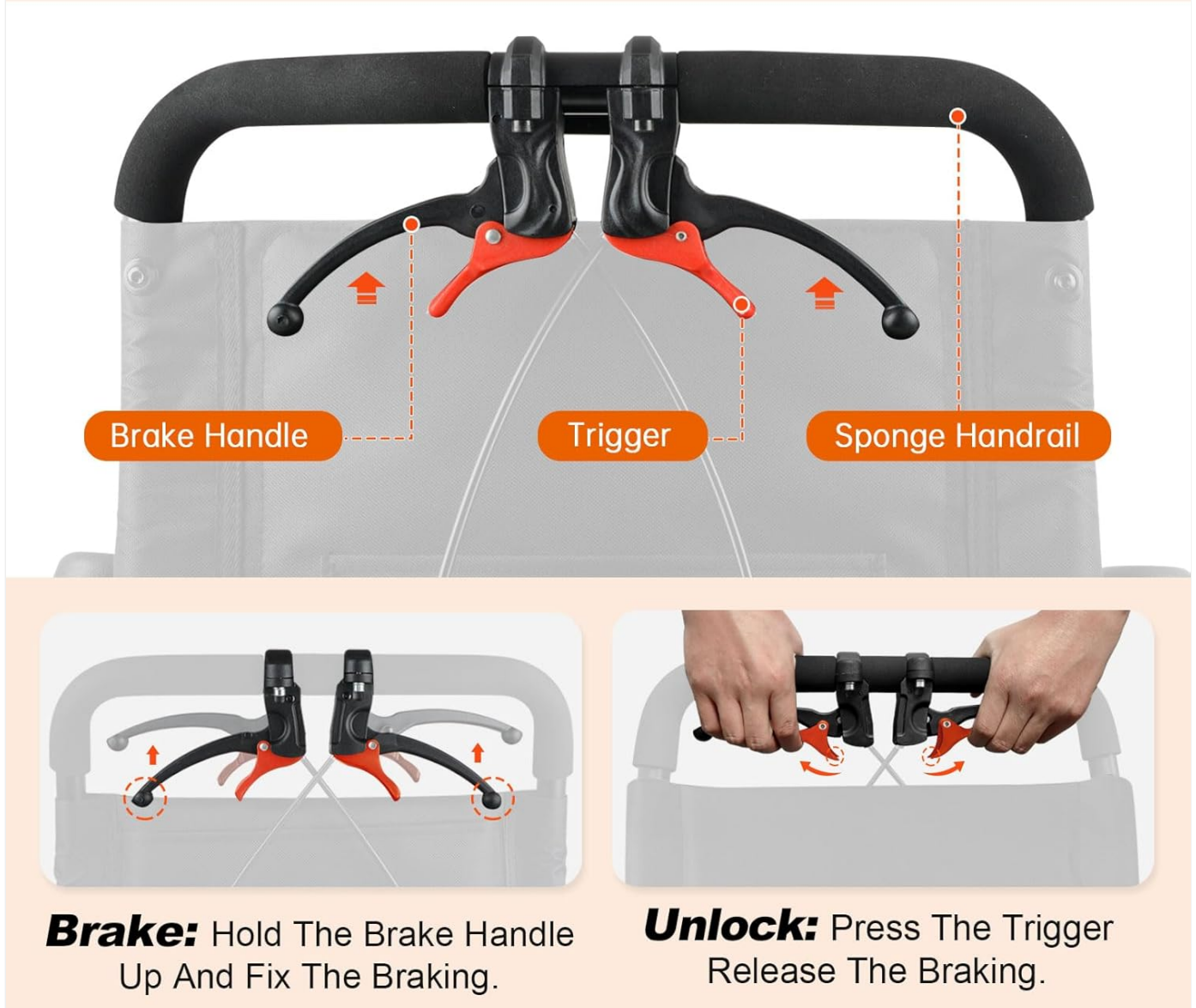
Figure 6: Close-up view of the Mujocooker M-Z80's double handbrake mechanism, illustrating how to engage the brake by holding the handle up and fixing it, and how to release it by pressing the trigger.