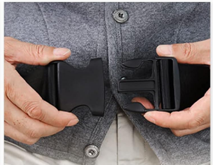
4 ANTI-FALL SAFETY BELT Ensure The Safety of Users During use