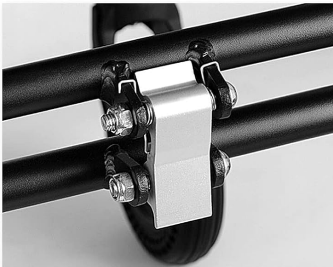
1 SAFTY BUCKLE Safty Buckle Keep The Wheelchair Fix And Not Easy To Deformation