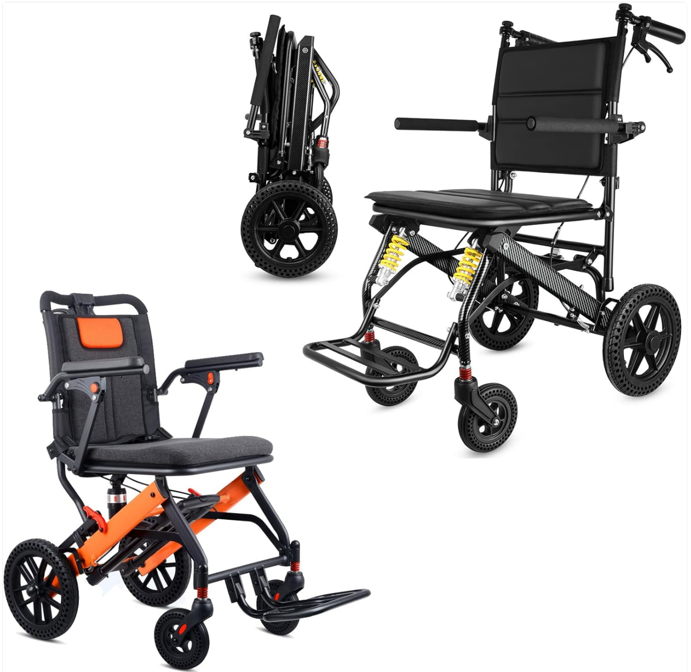
Figure 2: The Mujocooker M-Z80 Transport Wheelchair, illustrating its unfolded configuration ready for use and its compact folded state for storage or transport.