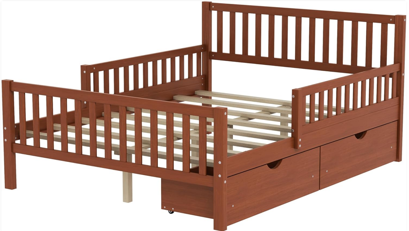
Image 4.1: The bed frame structure showing the wooden slats and the space for the storage drawers underneath.