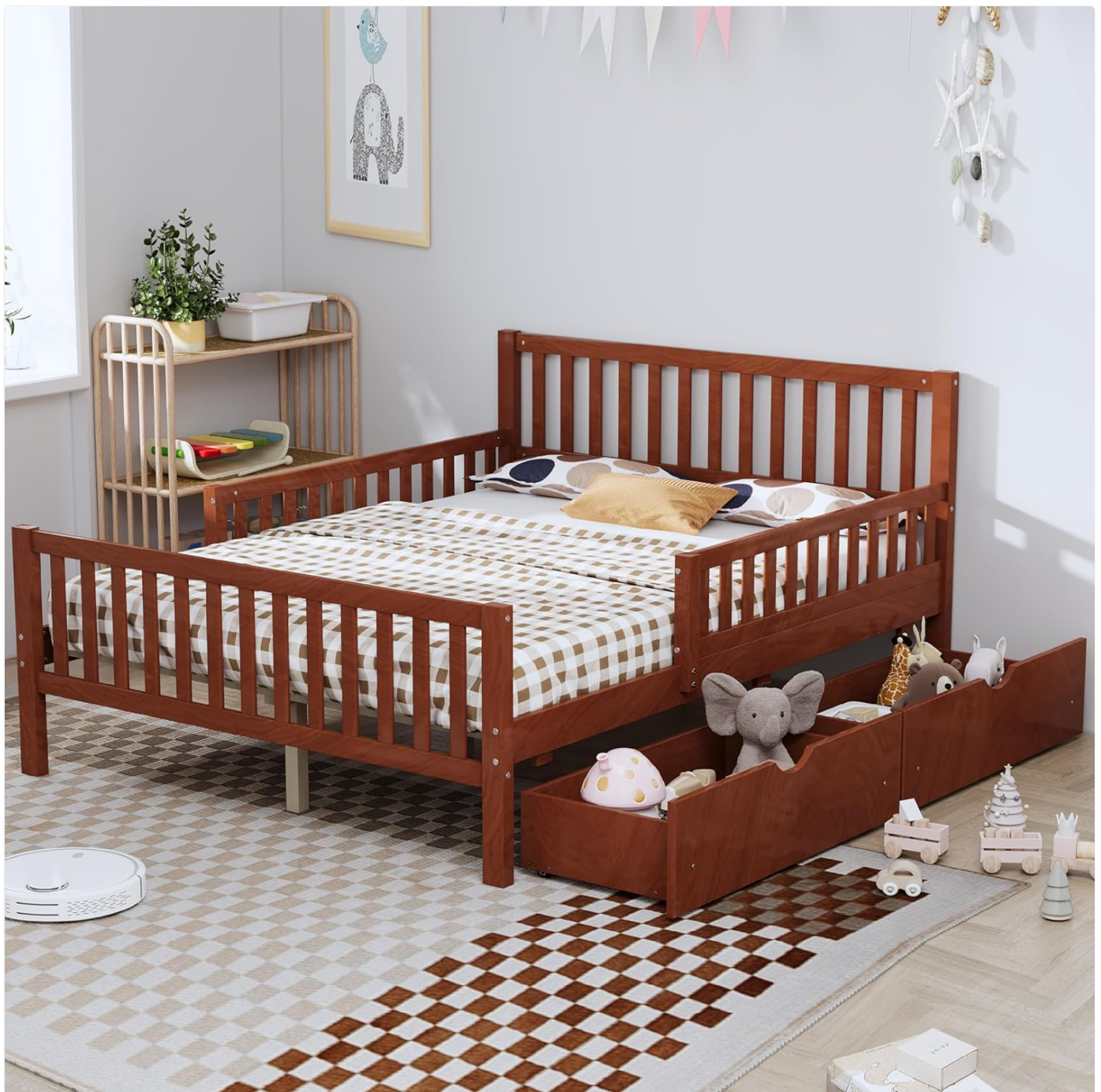
Image 1.1: Fully assembled Bellemave Full Bed Frame in walnut with storage drawers extended, shown in a bedroom setting.