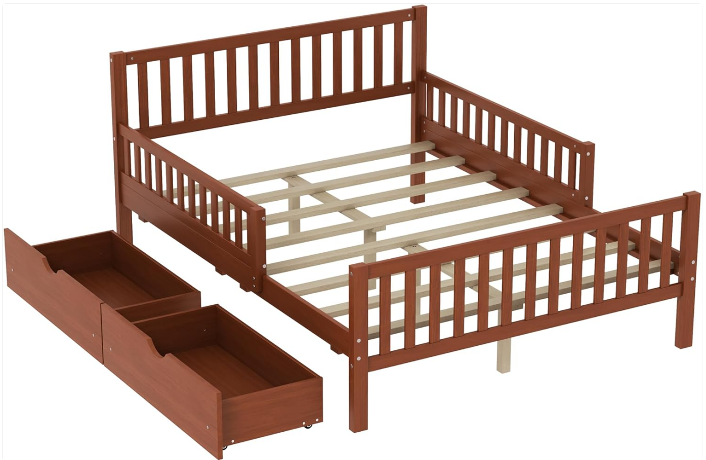
Image 3.1: Overview of the bed frame components, including the main frame and two large storage drawers.