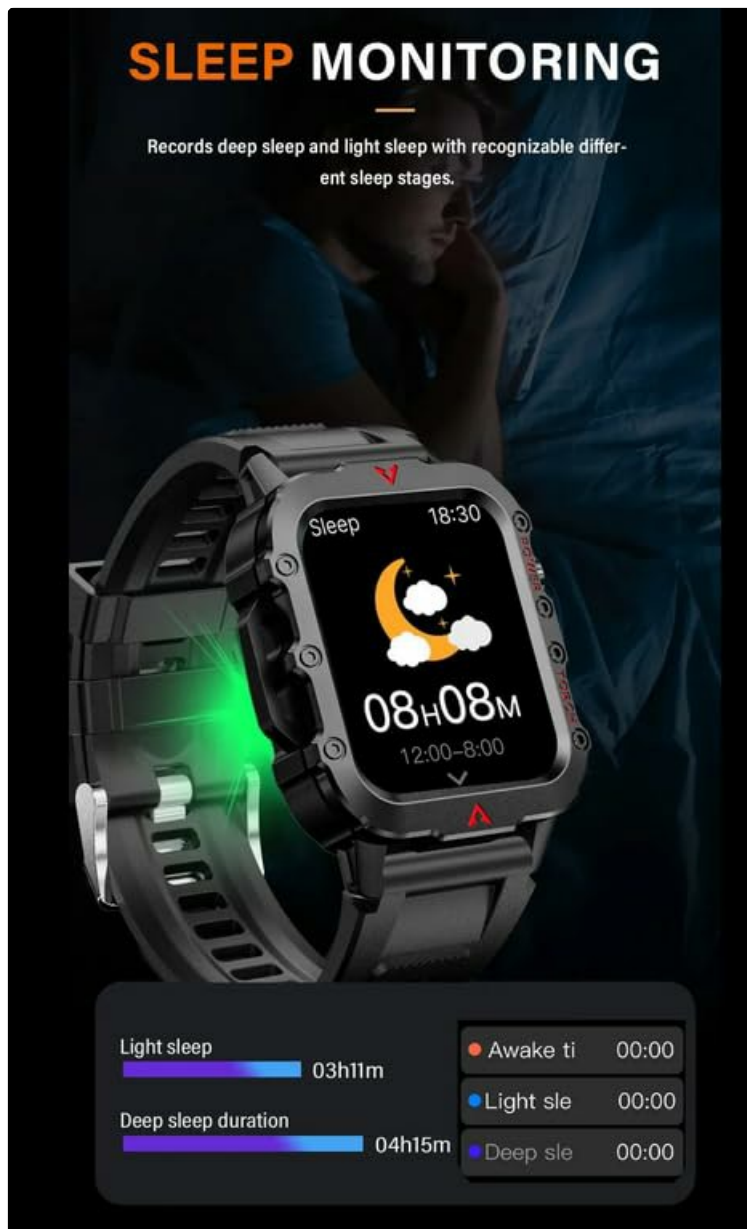
Figure 3.2: The smartwatch screen showing sleep duration, including light sleep and deep sleep, along with awake time.