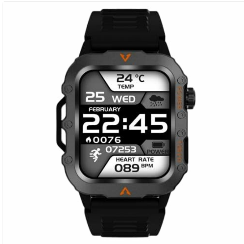
Figure 1.1: Front view of the LAXAFIT Q11 Digital Sports Smartwatch, displaying time, date, temperature, steps, and heart rate.

This manual provides essential instructions for the proper setup, operation, and maintenance of your LAXAFIT Q11 Digital Sports Smartwatch. Designed for fitness tracking and daily wear, this smartwatch features a rugged design, real-time health monitoring, and smart notifications. Please read this manual thoroughly before using your device to ensure optimal performance and longevity.