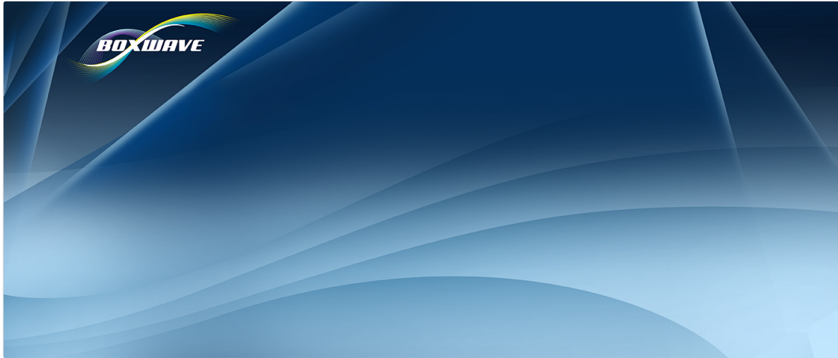
Image: Overview of the BoxWave ClearTouch Crystal ToughShield 9H, highlighting color brilliance, clarity, precision, and reusability.