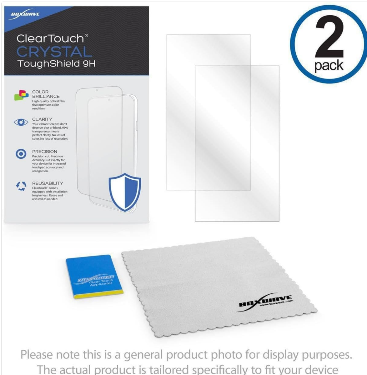
Image: Contents of the BoxWave ClearTouch Crystal ToughShield 9H 2-pack, including two screen protectors, a microfiber cloth, and an applicator card.