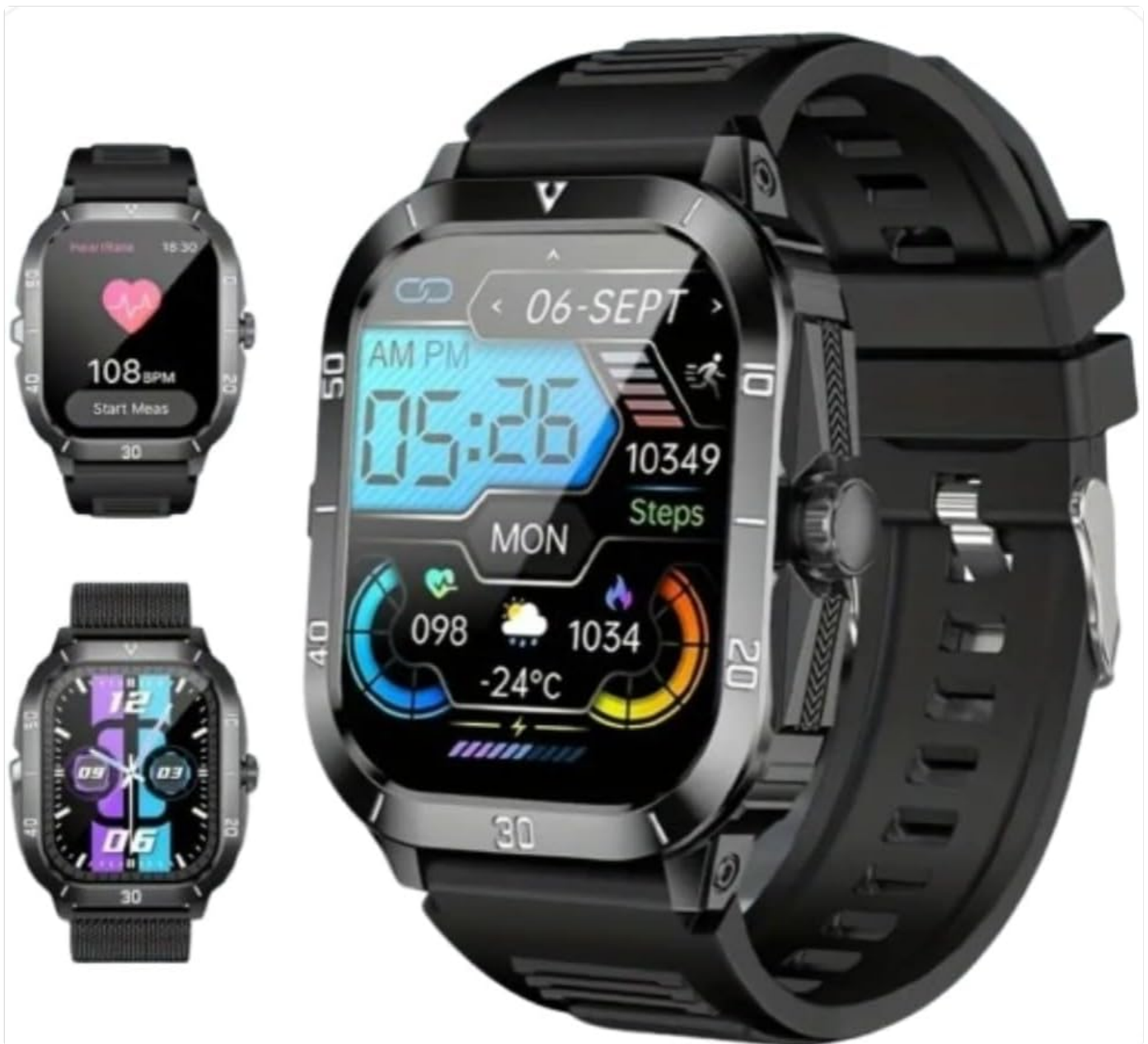
Image: The SENBONO KT71 Smartwatch showcasing its large display with various watch faces, including a health tracking interface showing heart rate and steps, and a time/weather display.