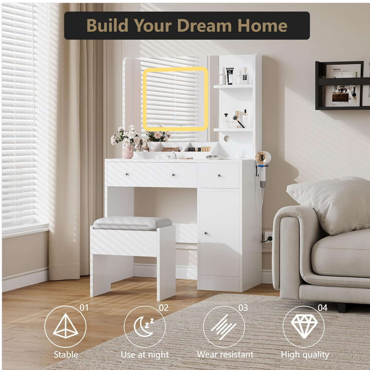
Figure 3.2: Vanity Desk in a Bedroom Setting. This image provides a visual context of the vanity desk and stool in a typical bedroom, emphasizing its stable construction and suitability for daily use.