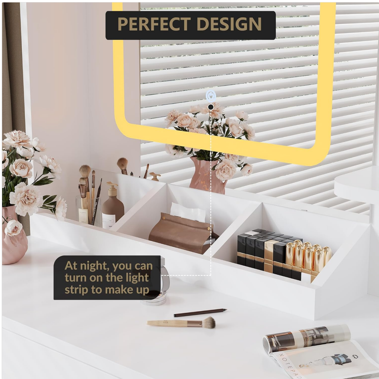
Figure 4.2: Desktop Storage Organization. This close-up view highlights the integrated compartments on the vanity desktop, designed for efficient organization of makeup and small accessories.