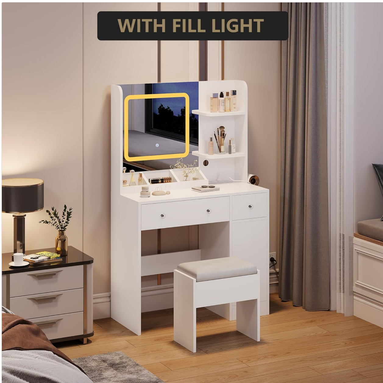
Figure 4.1: LED Mirror in Operation. This image demonstrates the vanity desk with its LED mirror lights activated, illustrating the illumination feature for makeup application.