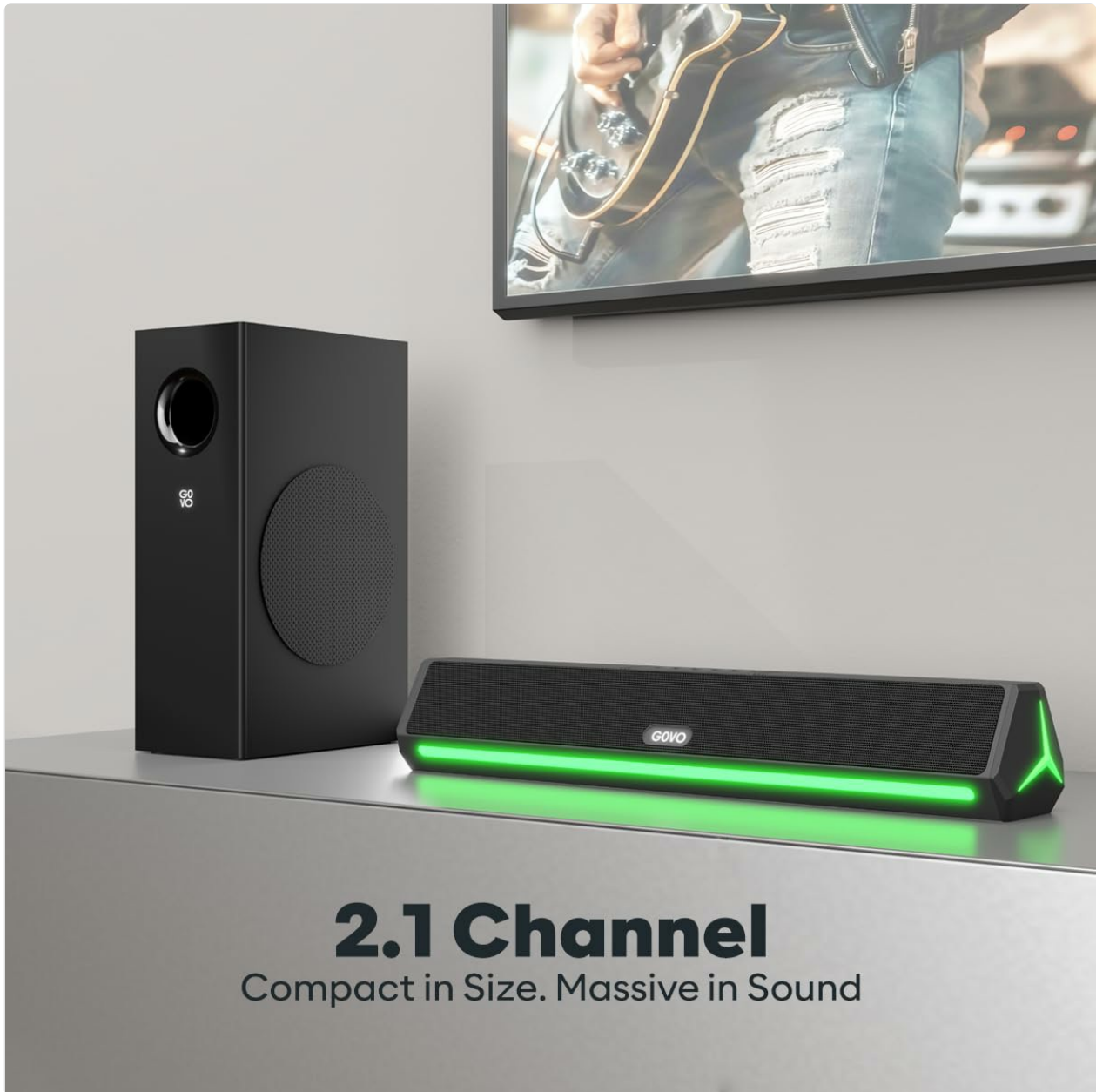
Figure 3.1: The GOVO GOSURROUND 600 Soundbar and its accompanying wired subwoofer.

The GOVO GOSURROUND 600 system consists of a soundbar and a wired subwoofer, designed to enhance your audio experience with 2.1 channel sound and deep bass.