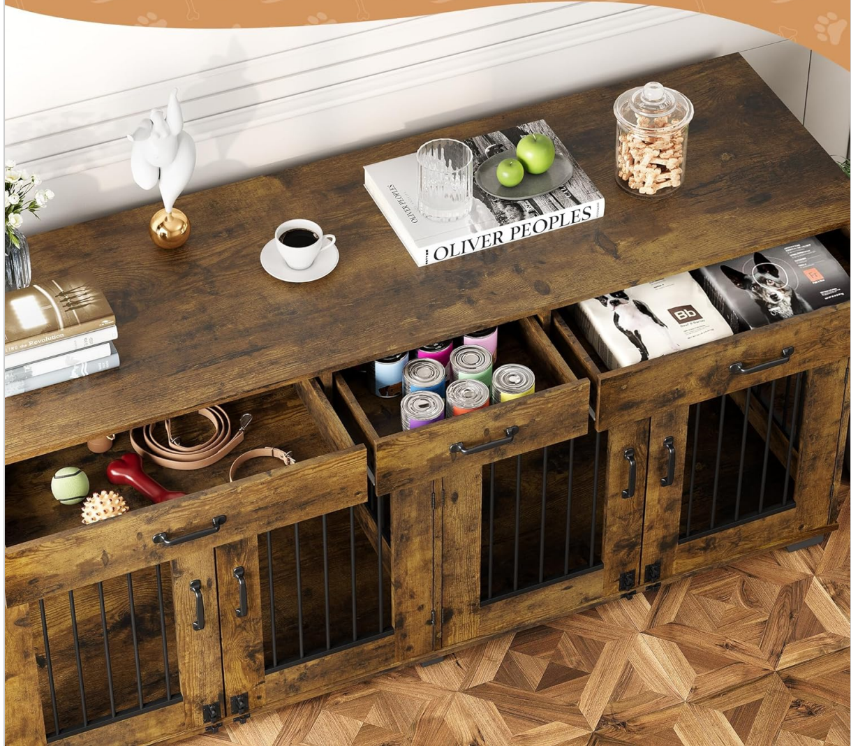
Image: The three storage drawers open, displaying various pet accessories and supplies, highlighting the additional storage capacity.

3 big drawers are great places to store dog supplies