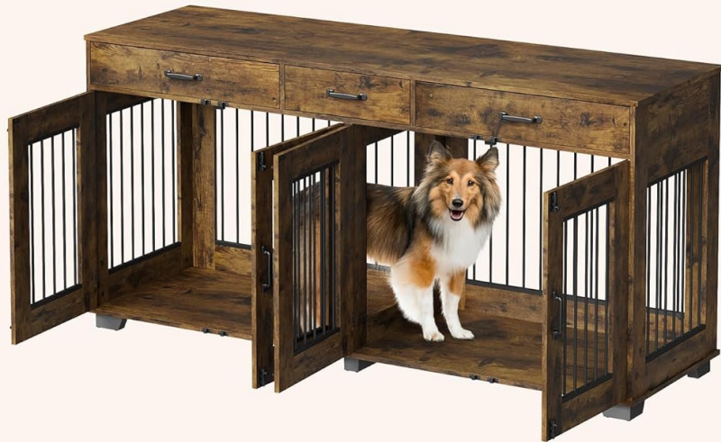
Image: Illustration of the removable divider, demonstrating how the crate can be configured into two separate rooms or one large space.