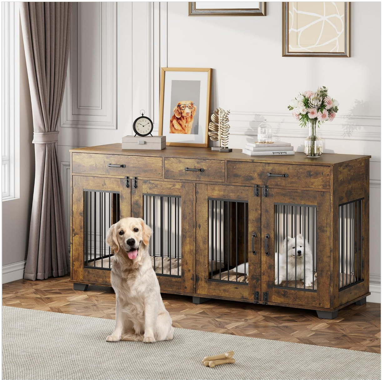
Image: The dog crate furniture integrated into a home environment, highlighting its aesthetic appeal and functionality.