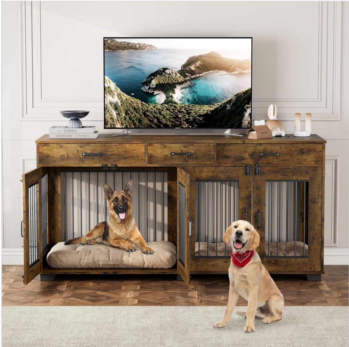
Image: The assembled GAOMON 71" XXL Double Dog Crate Furniture, showcasing its use as a TV stand with two dogs comfortably housed within the crates.