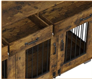
Three Storage Drawers