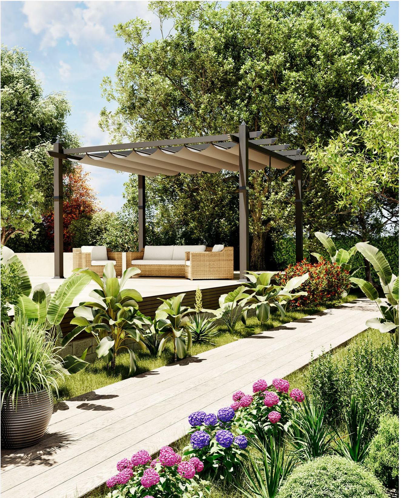
Figure 2.1: Overview of the Garvee 10x13 ft Aluminum Pergola with Retractable Canopy.