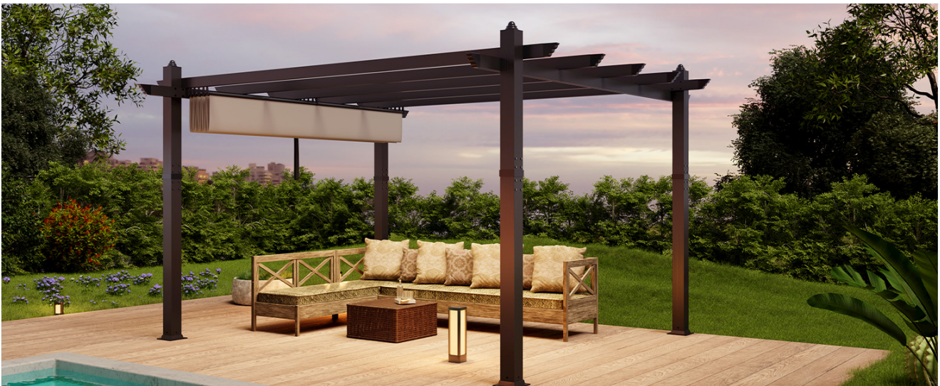
Figure 4.1: The retractable canopy in its fully retracted position, secured by a strap.