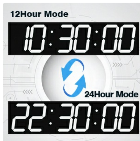
Image: Switching between 12-hour and 24-hour time formats.