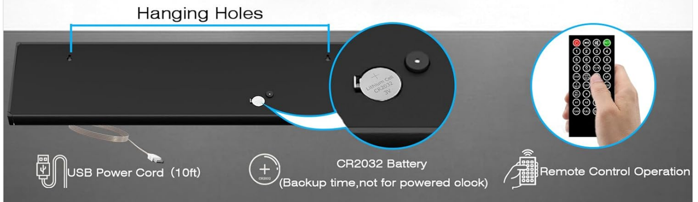
Image: Rear view of the clock showing power input and battery compartment.