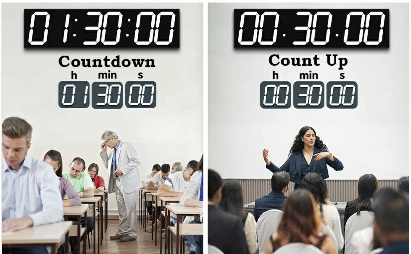
Image: Examples of countdown and count-up timer functions.