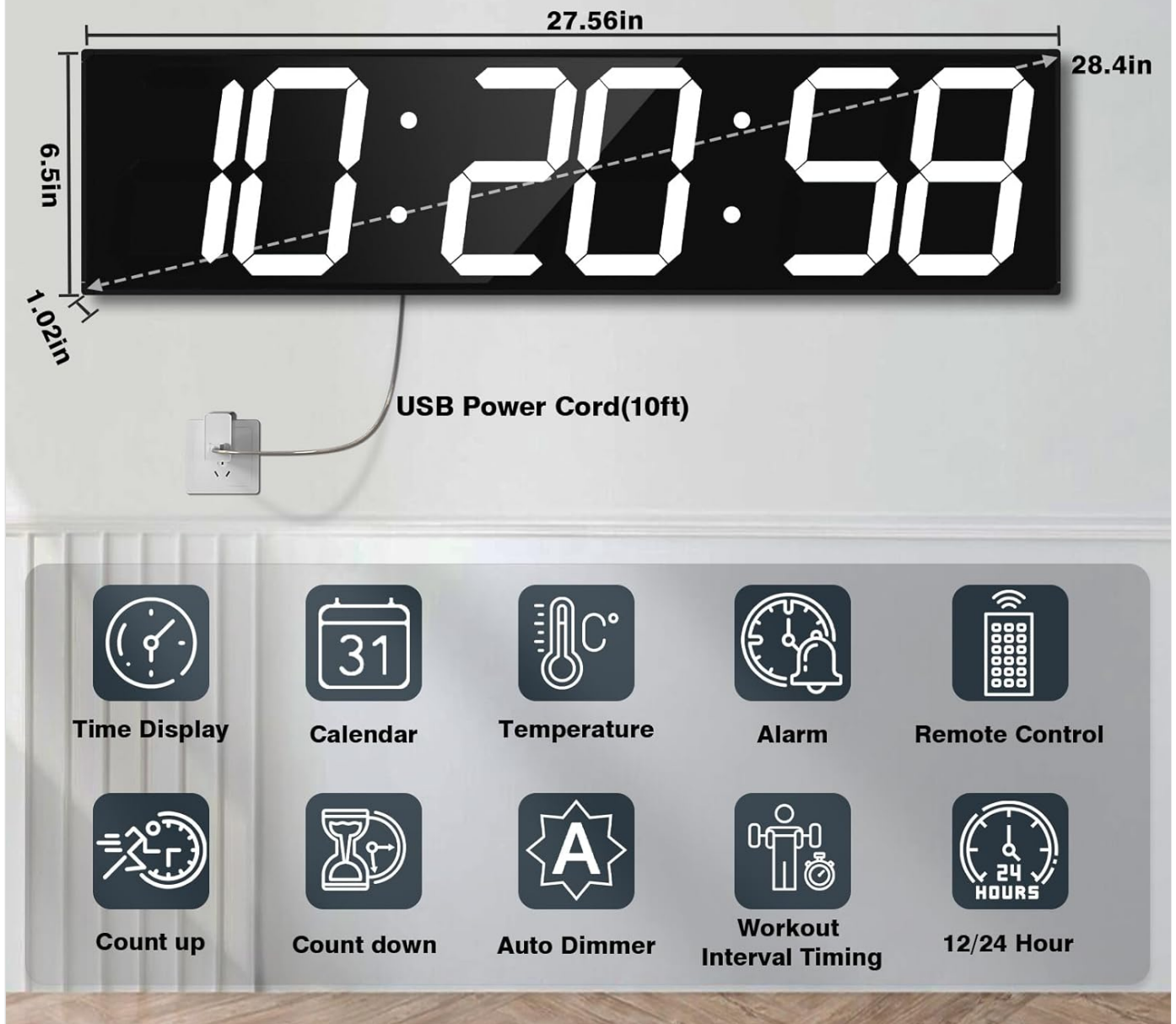
Image: Overview of the CHKOSDA CH3389 Digital Wall Clock's dimensions and multifunctional features.