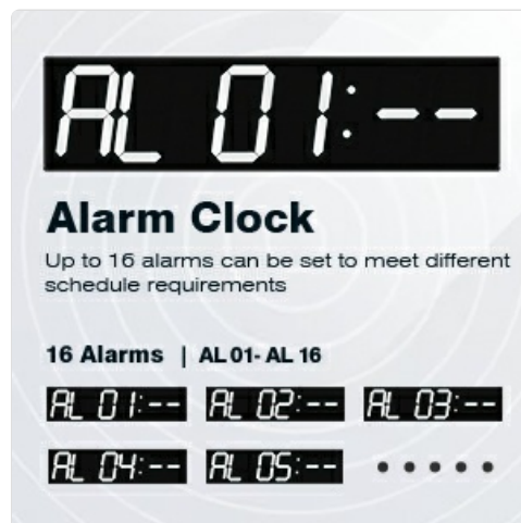
Image: Setting multiple alarms on the digital clock.