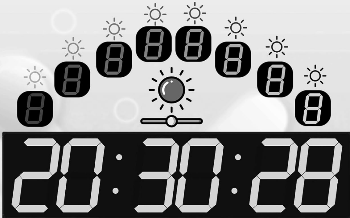
Image: Fixed and automatic brightness adjustment modes.

Automatically adjusts brightness according to light changes