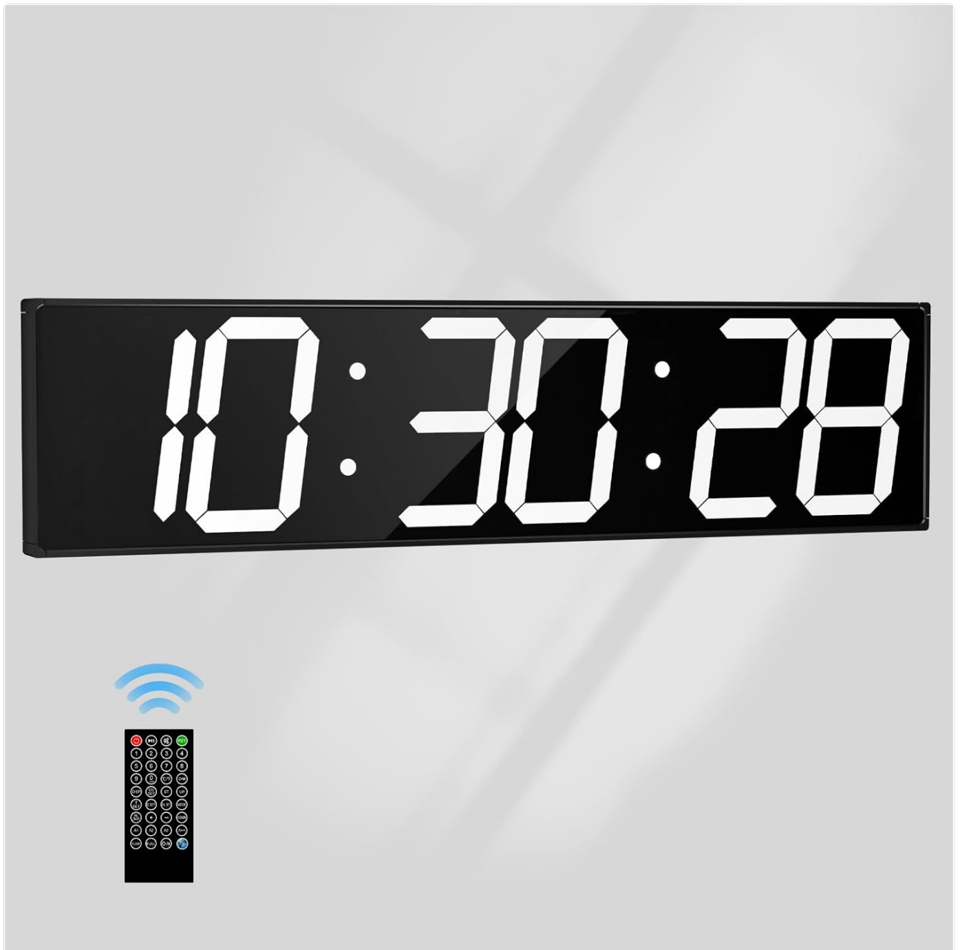
Image: Front view of the CHKOSDA CH3389 Digital Wall Clock and its remote control.