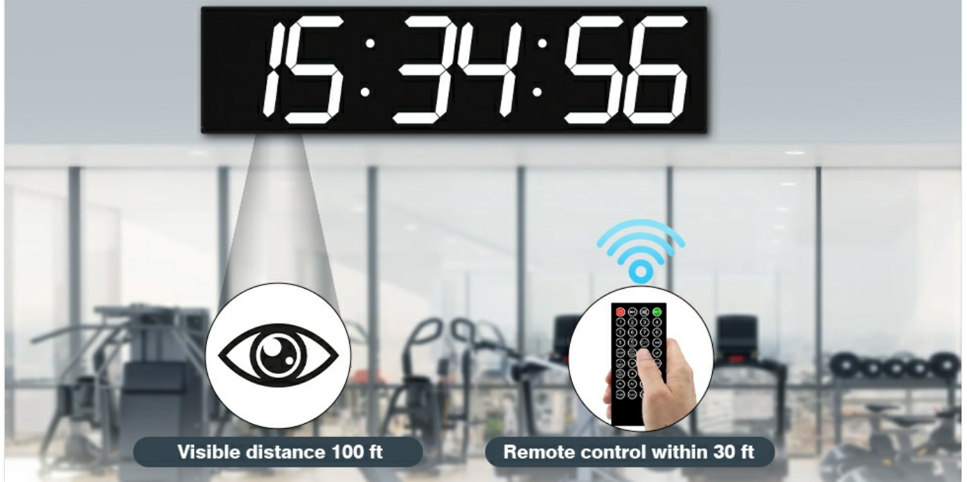
Image: The clock's high visibility and remote control range.

Narrow bezel, large digits for a better reading experience