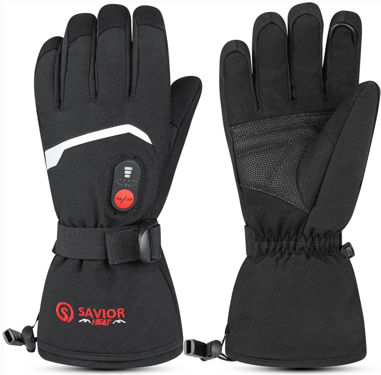
Figure 1: SAVIOR HEAT S66B Heated Gloves, front and back view.