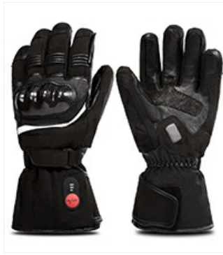
Figure 5: Touchscreen-compatible fingertip for device interaction.