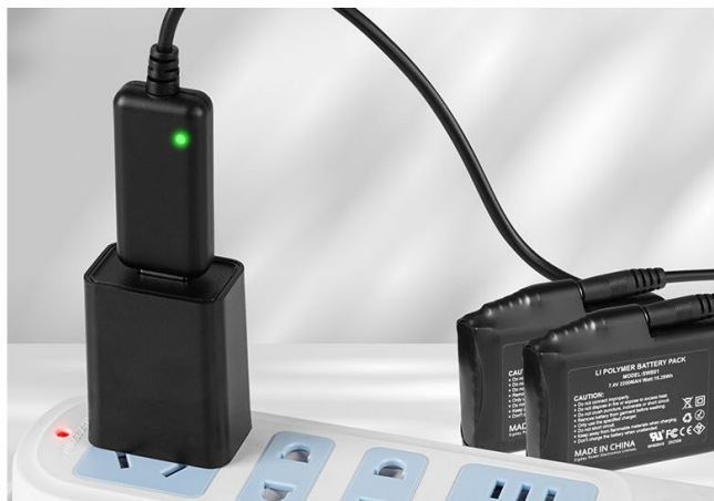
Figure 2: Connect batteries to the dual charger and plug into a power source. Ensure batteries are fully charged before initial use.

Charge the batteries every 3 months to keep it function well