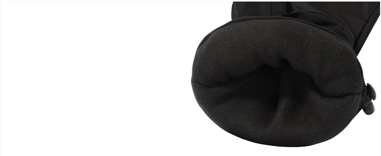
Figure 6: Hand washing is recommended for glove maintenance.

It is recommended to hand wash the SAVIOR HEAT Heated Gloves. Remove batteries before washing. If the surface is dirty, wipe it clean and air dry. Do not machine wash or tumble dry, as this may damage the heating elements.