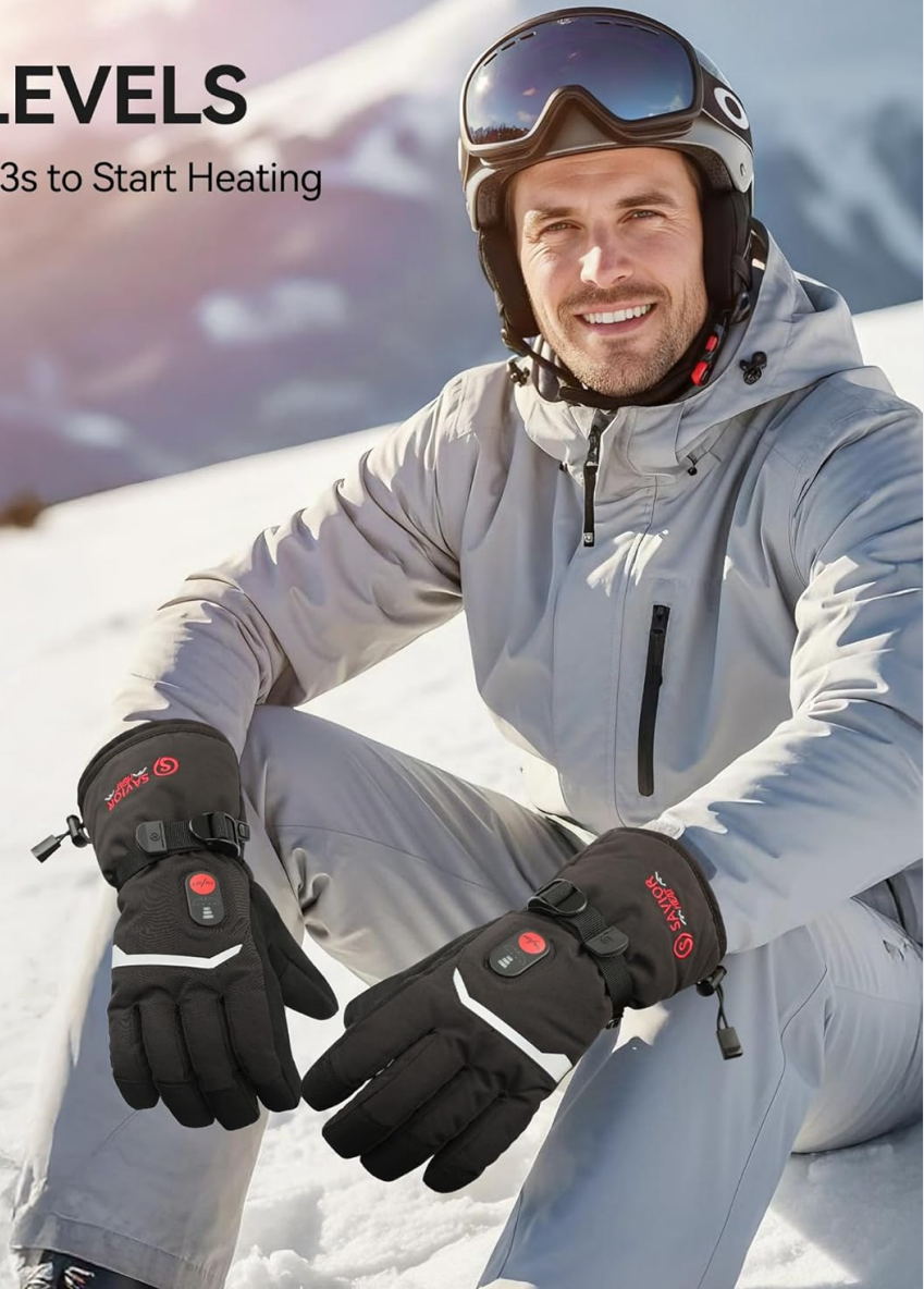
Figure 4: Control button and heat level indicators on the glove.