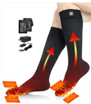
Figure 3: Battery insertion and connection process.

Locate the zippered pocket on the cuff of each glove. Insert a fully charged battery into each pocket and connect it to the plug inside the pocket.