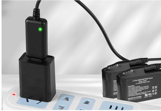
Figure 7: Regular charging helps maintain battery health.

Charge the batteries every 3 months to keep it function well