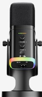
Gaming Streaming Mic*1