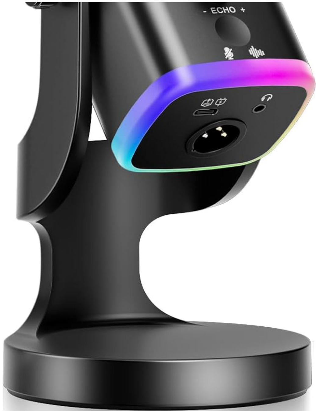
Image: The Facmogu YU8 Dynamic Microphone in black, featuring its integrated desktop stand and vibrant RGB lighting. The microphone has control knobs for volume and echo, and a mute button.