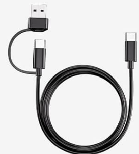
USB-C to USB-A/C Cable*1

Image: An overview of the Facmogu YU8 microphone package contents, showing the microphone, its desktop stand, a USB-C to USB-A/C cable, and the user manual.