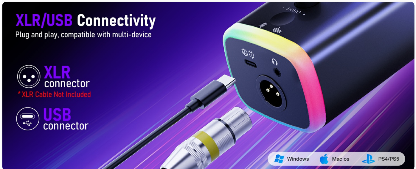
Image: A visual representation of the Facmogu YU8 microphone's USB and XLR connectivity, illustrating connections to computers, tablets, smartphones, and gaming consoles.

For studio-quality audio with stable, balanced transmission, connect an XLR cable (not included) from the microphone's XLR port to a 48V mixer or audio interface. This allows for integration into professional audio setups.