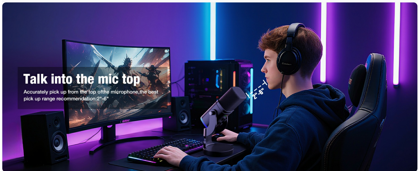
Image: A user demonstrating the correct speaking position, directly into the top of the microphone, for best audio quality.

The YU8 features a top-addressed capsule design. For optimal vocal pickup, speak directly into the top of the microphone. Maintain a distance of approximately 2-6 inches from the microphone for clear and crisp audio.