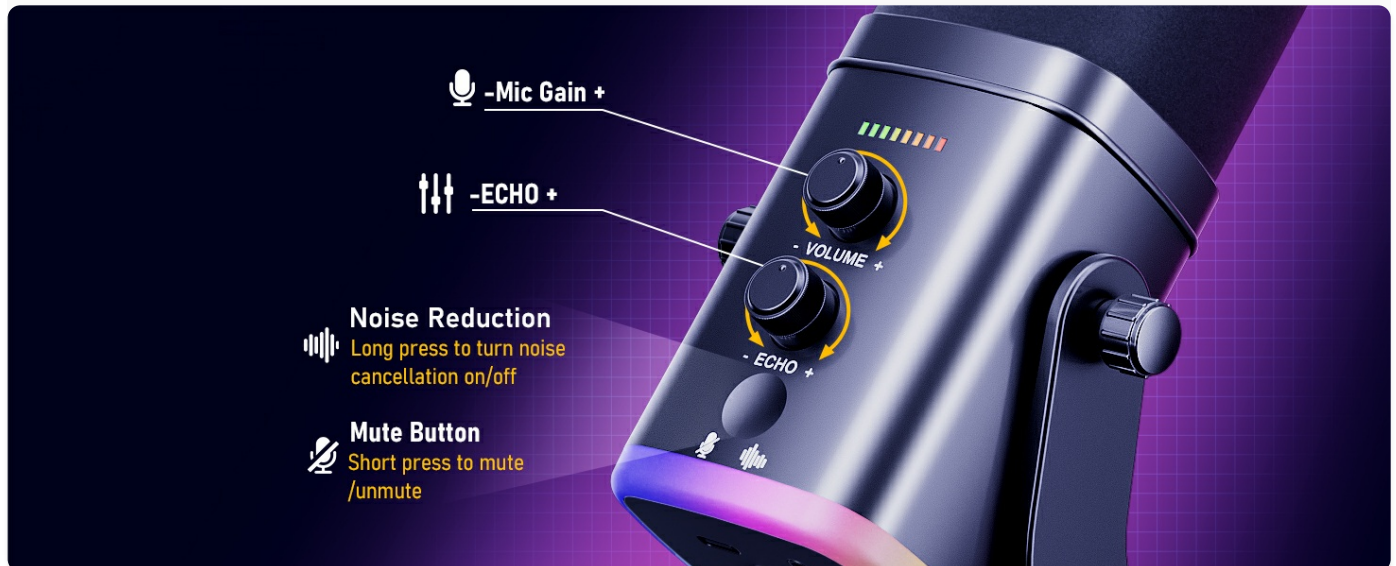
Image: Detailed view of the microphone's control panel, showing the gain and echo knobs, mute button, and noise reduction indicator.