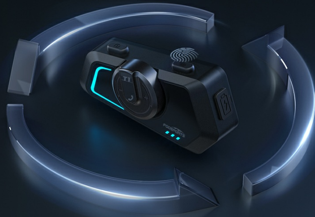
Image: Diagram illustrating the one-click mode switching feature of the Fodsports T1, showing transitions between Bluetooth Intercom, Universal Pairing, and Music Sharing modes.