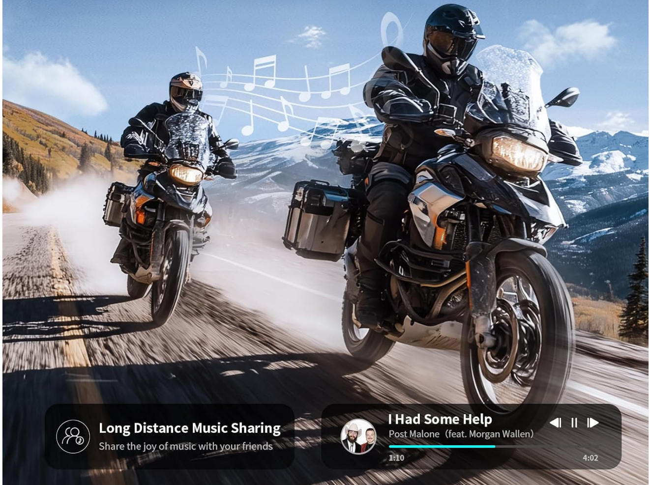
Image: Two motorcyclists riding together, with musical notes flowing between their helmets, symbolizing the music sharing feature of the Fodsports T1 intercom.

Support music sharing between two riders