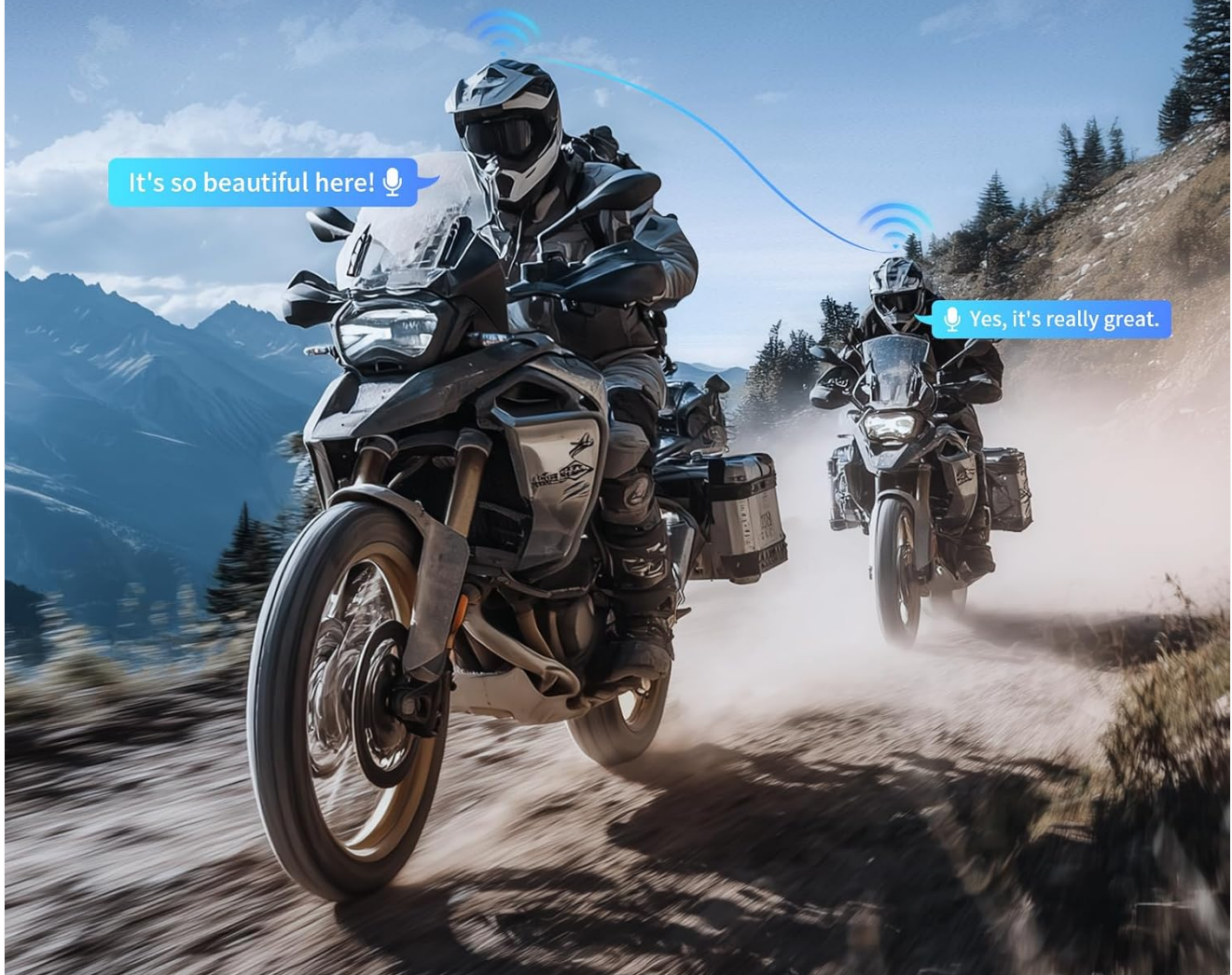
Image: Two motorcyclists communicating via the Fodsports T1 intercom system, illustrating its 2-way communication capability over a distance of up to 1000 meters.

Your browser does not support the video tag.