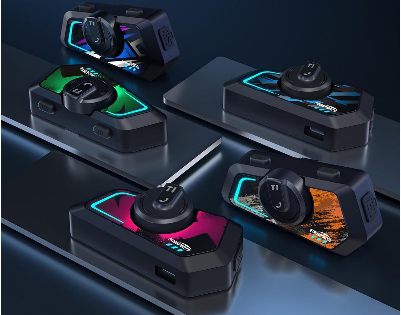
Image: The Fodsports T1 intercom unit displayed with five different interchangeable sticker designs, allowing for personalization.

Includes 5 free stickers for easy style switching