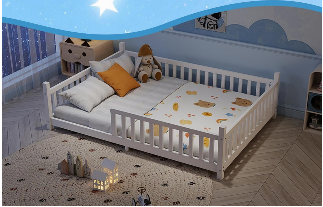
Image: The OYUMOENTS Full Size Tent-Shaped Montessori Floor Bed with its roof removed, demonstrating its flexibility as a floor bed.

You can install or remove the roof according to your and your Kids needs.