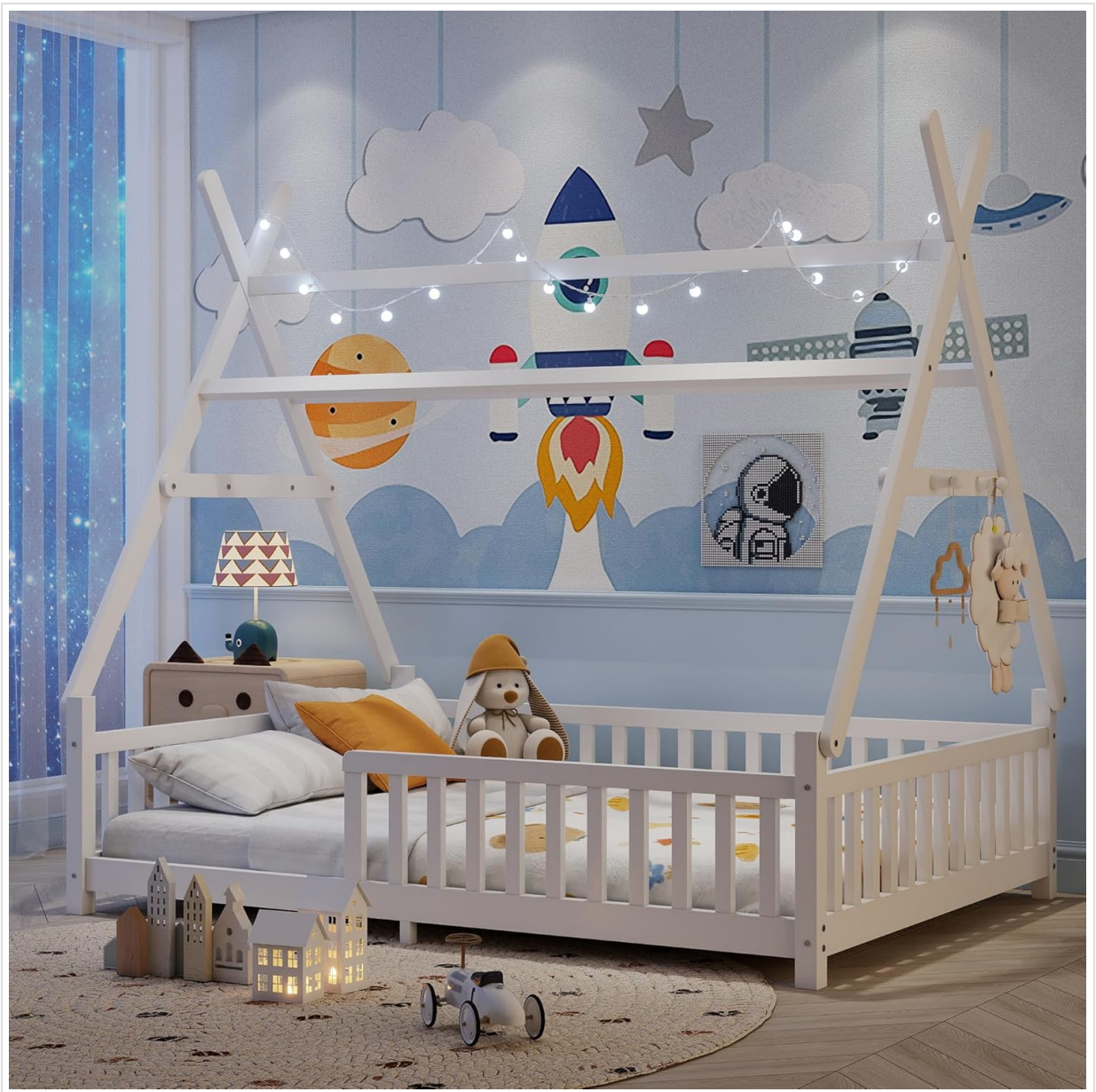
Image: OYUMOENTS Full Size Tent-Shaped Montessori Floor Bed in white, fully assembled and decorated in a child's room.