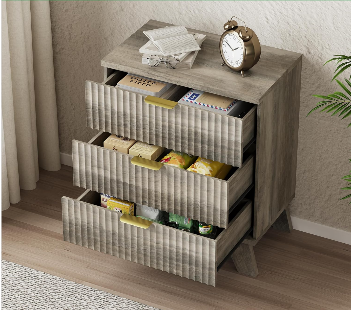
Image: The nightstand with drawers open, illustrating its large storage capacity for various items.