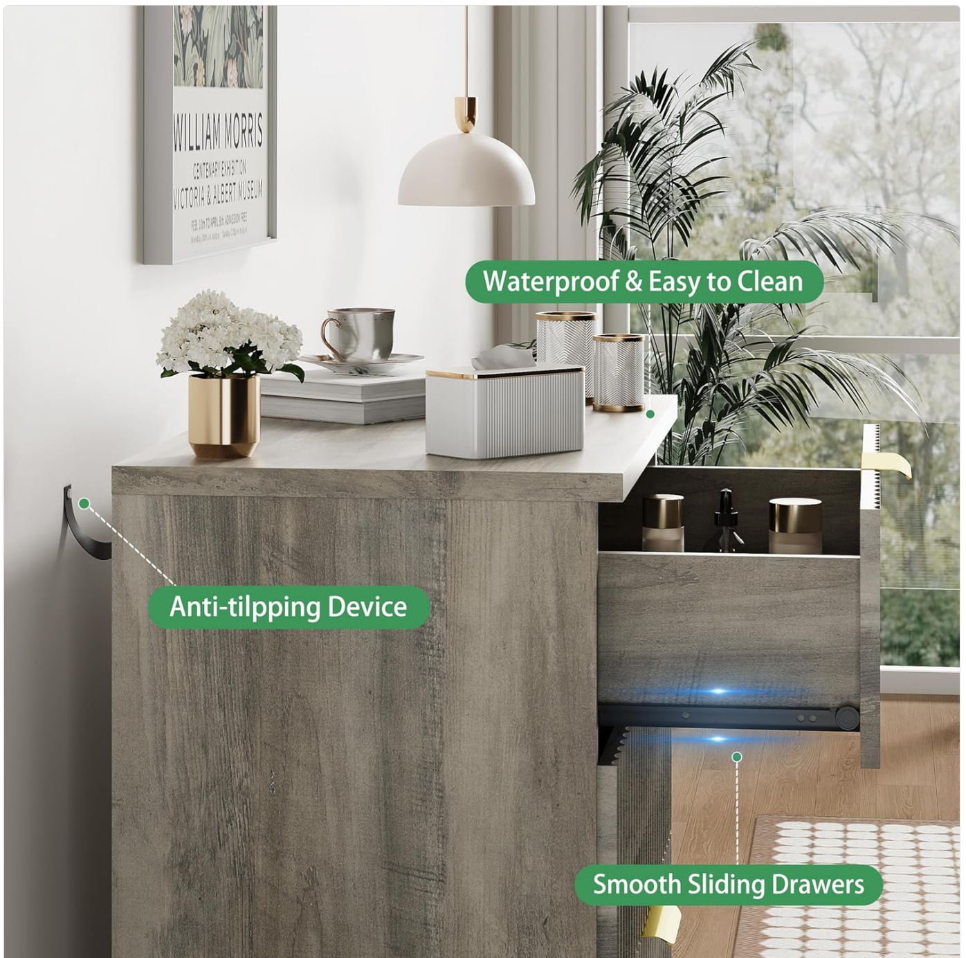
Image: Features demonstrating the waterproof and easy-to-clean surface of the nightstand.