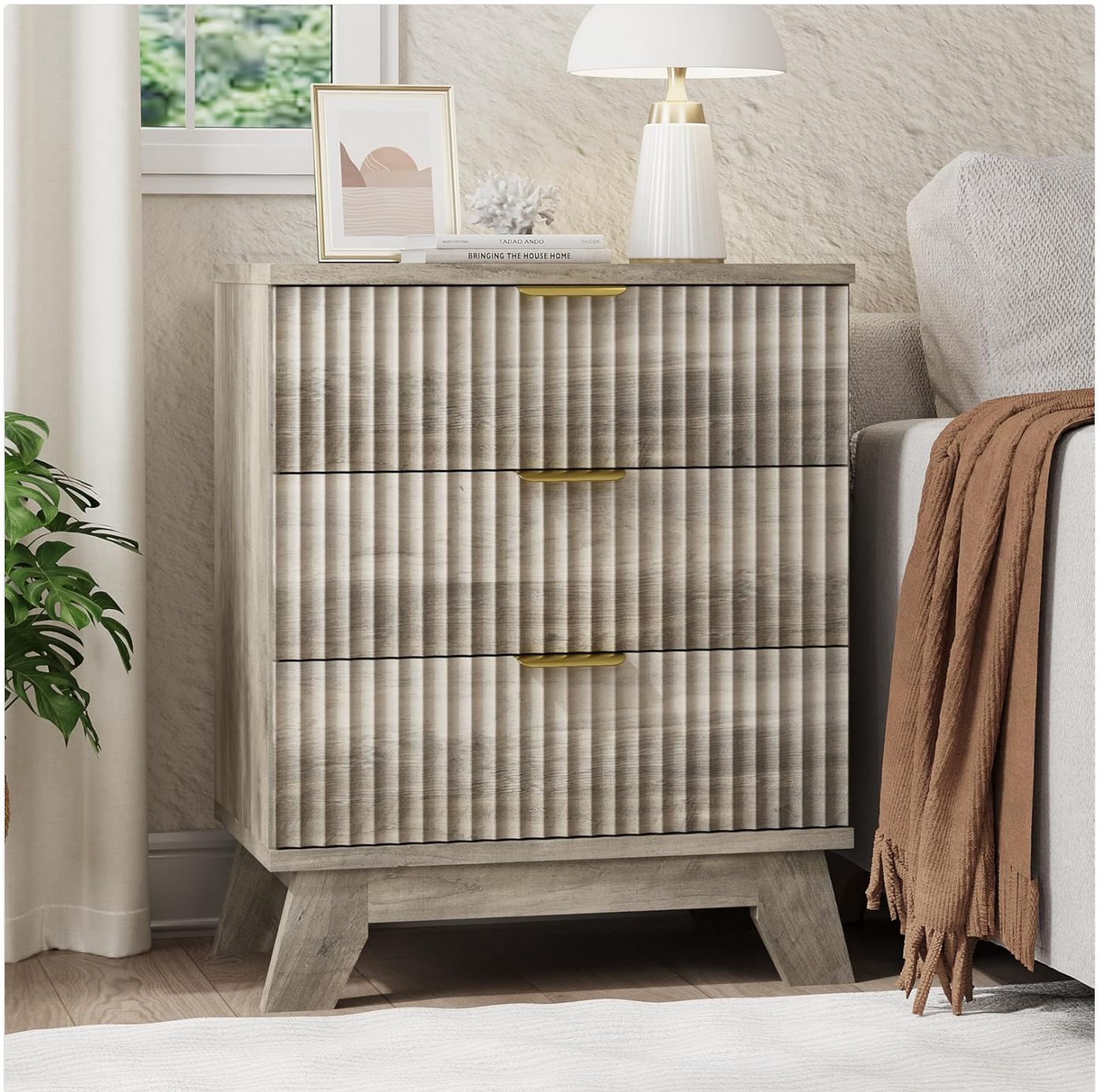
Image: The Xixini Fluted Nightstand, Model HLG047-GOK, positioned next to a bed in a modern bedroom setting.