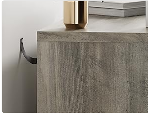
Image: Detail of the smooth-gliding drawer slides for easy operation.