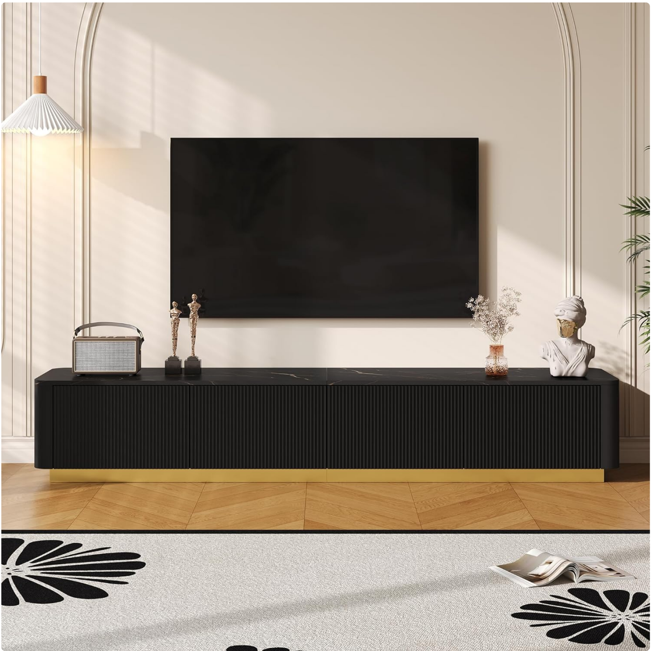
Figure 4.1: Fully assembled Merax Modern Wood TV Stand.