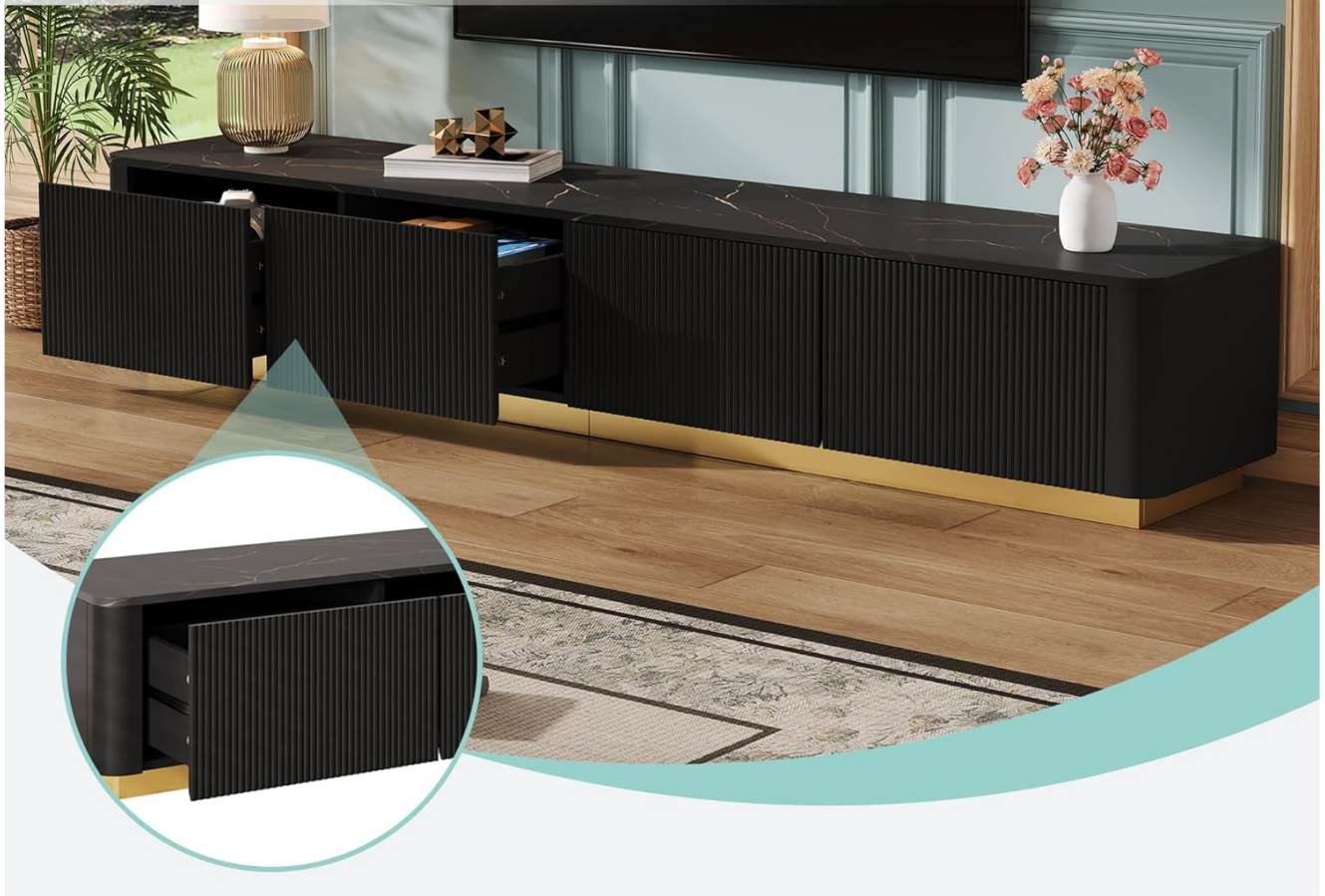
Figure 5.1: Drawers open, demonstrating generous storage capacity.

The drawers feature angled pull handles beneath the door panels, ensuring easy opening and closing—blending practicality with sleek design.