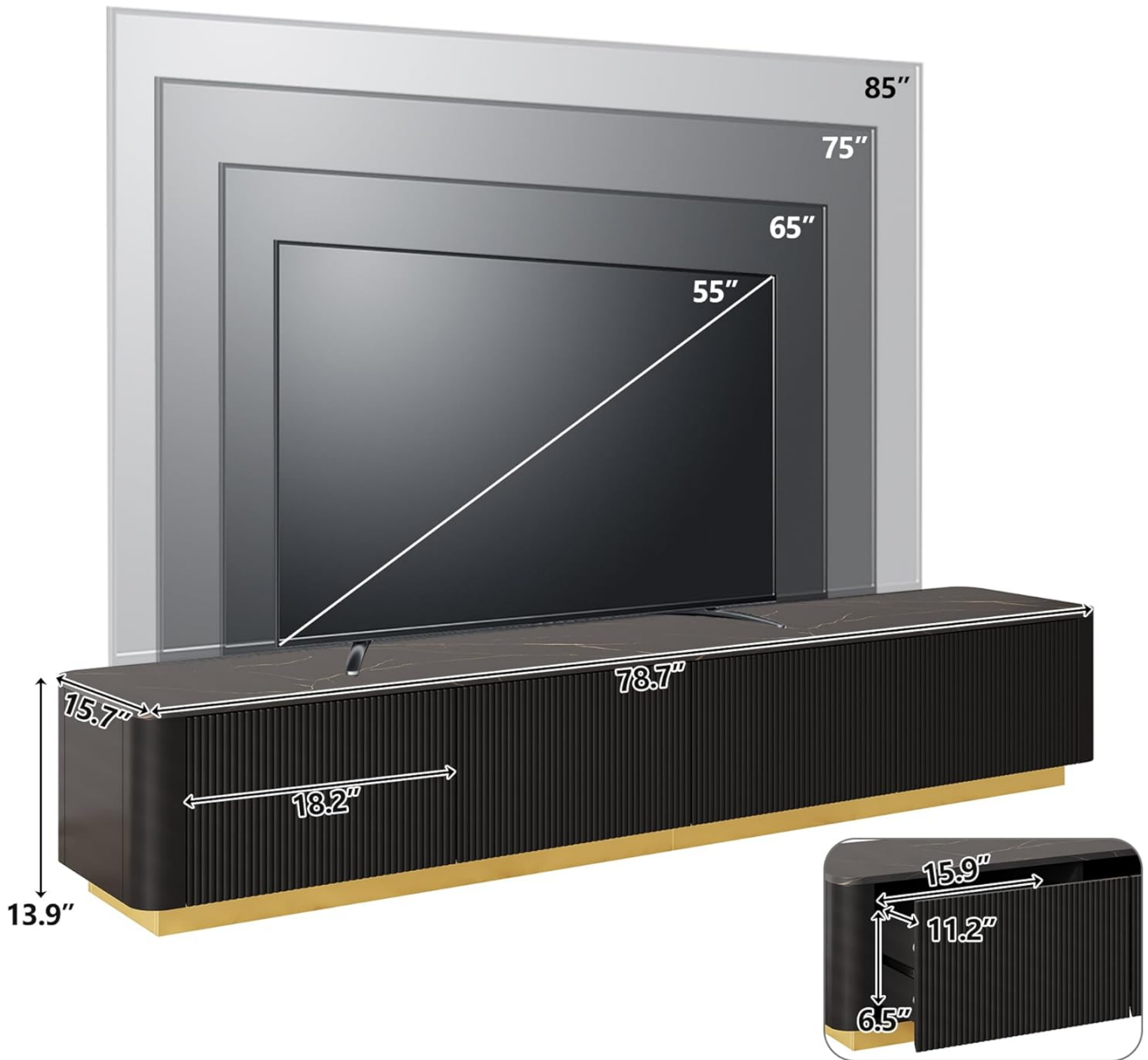
Figure 8.1: Detailed dimensions of the TV stand.

Note:Manual measurements have been used and there may be some reasonable errors.