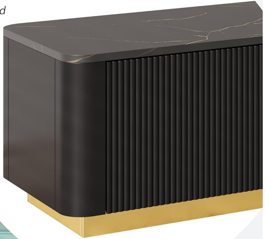
Figure 6.1: Detail of the well-finished fluted doors.