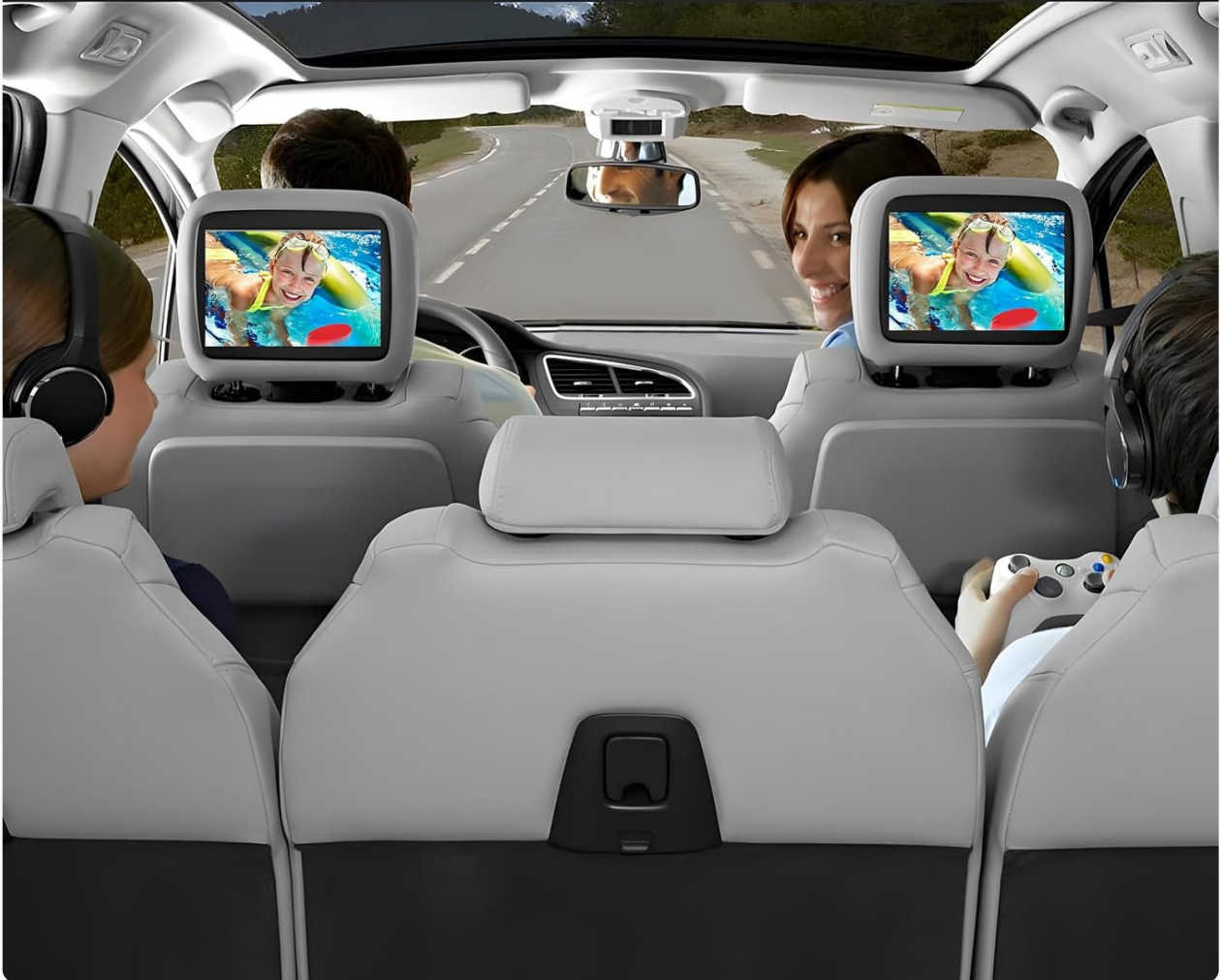
Image 6.4: Depicts the video output feature, showing the car stereo's display mirrored onto two headrest monitors for rear passengers.

Supports real-time mirroring of video from the car radio to headrest monitors.