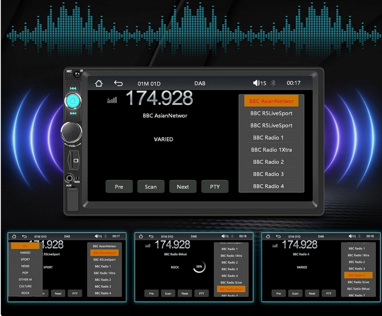
Image 6.1: Screenshot of the DAB Radio interface, showing station frequency, signal strength, and a list of available digital radio channels.

Provides CD-quality sound that is resistant to noise, interference, and guarantees the quality of the received signal while on the move.