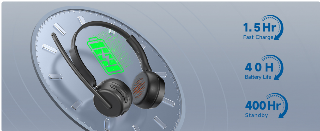
Image: Visual representation of headset charging time and battery life (40 hours play, 400 hours standby).