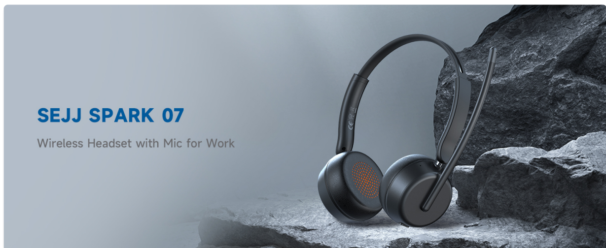
Image: The SEJJ Spark 07 Wireless Headset, showcasing its sleek design and microphone boom.

Thank you for choosing the SEJJ Spark 07 Wireless Headset. This headset is designed to provide clear audio and reliable connectivity for your work and communication needs. Featuring advanced Bluetooth technology and environmental noise-canceling (ENC) microphones, it ensures your voice is heard clearly in various environments. Please read this manual carefully to ensure proper use and optimal performance of your device.