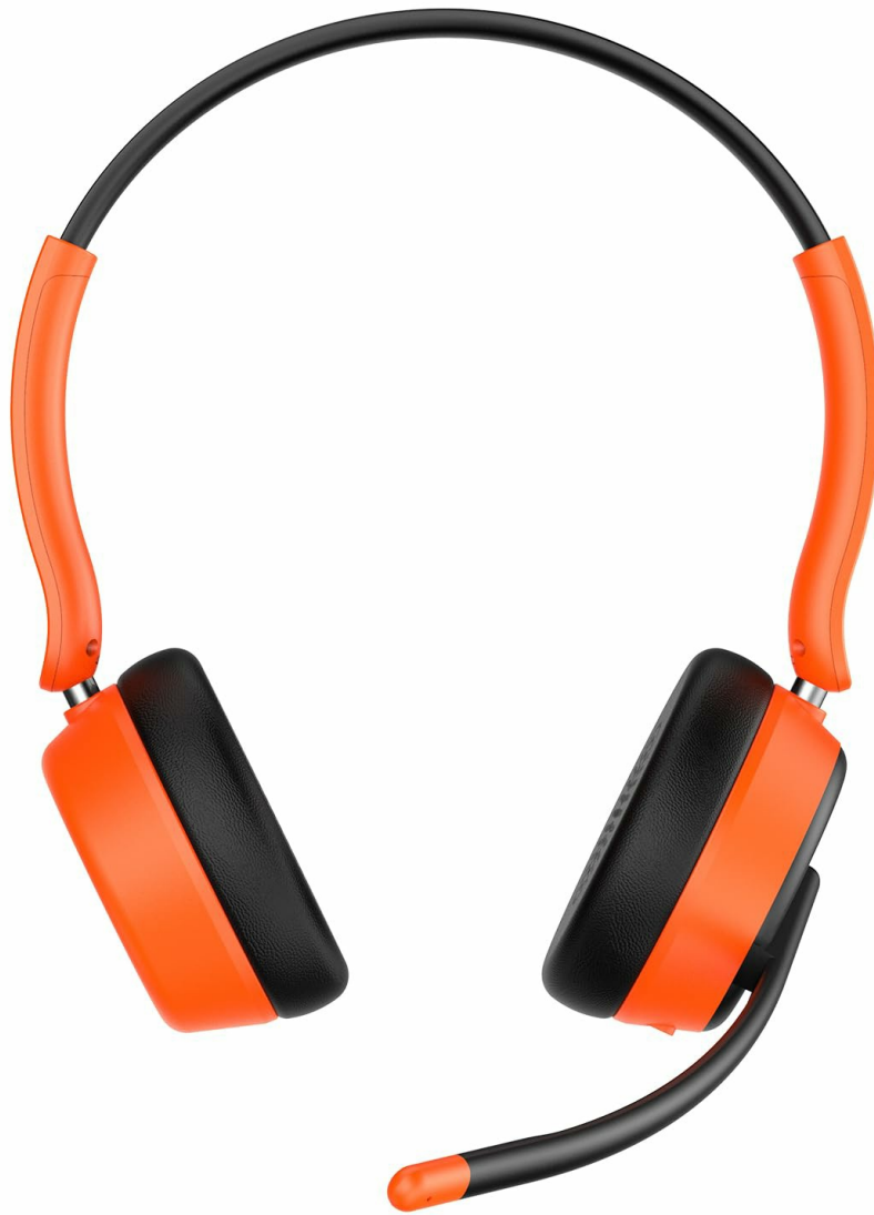
Image: Close-up of the SEJJ Spark 07 headset, highlighting the earpieces and flexible microphone arm.