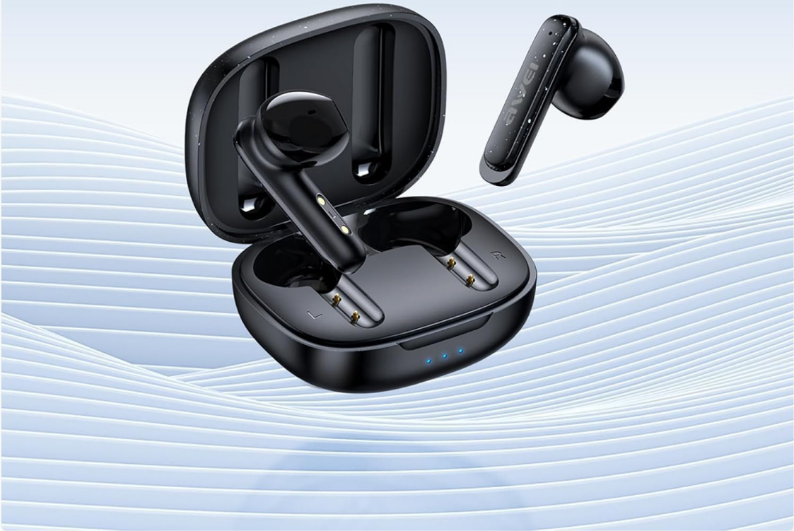
Image: AWEI T66 Wireless Earbuds in their open charging case, showcasing the design.