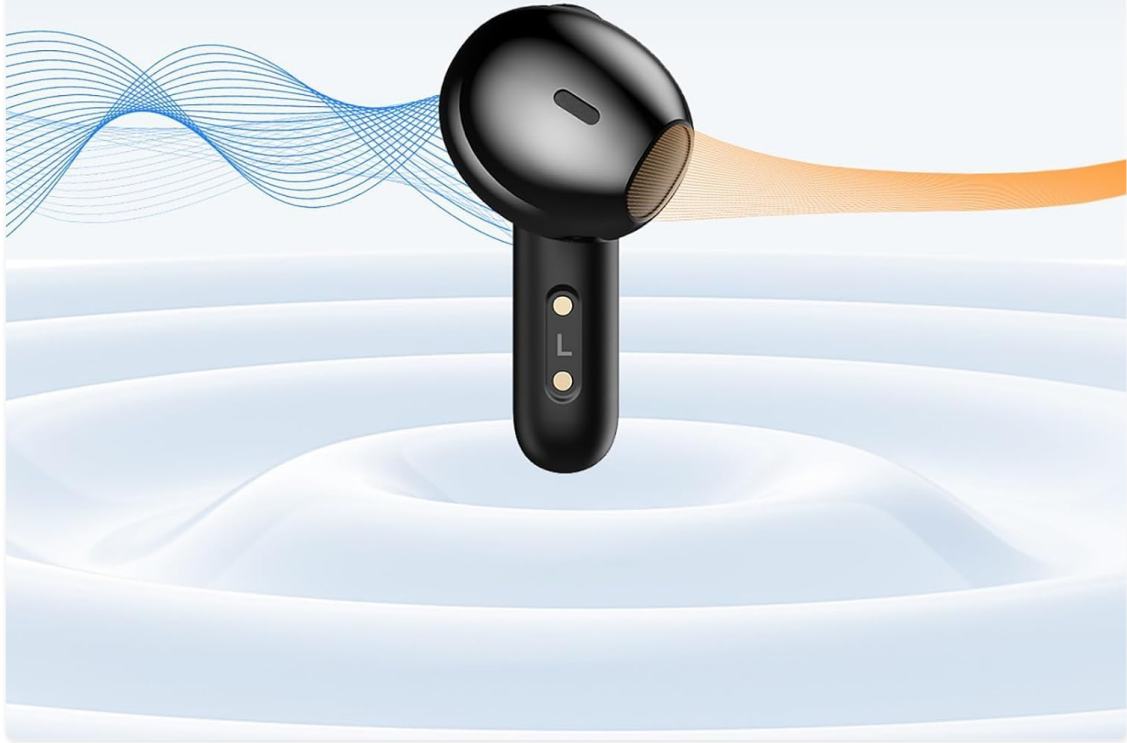
Image: Diagram illustrating the ENC (Environmental Noise Cancellation) feature of the AWEI T66 earbuds.

25dB environmental noise cancellation effectively counteract 90% of the environmental noise