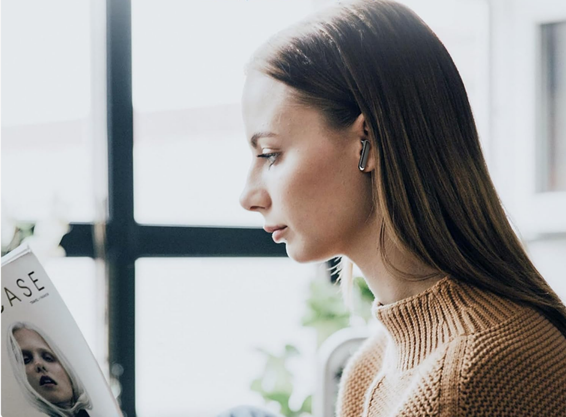
Image: A woman wearing AWEI T66 earbuds, demonstrating clear voice calls with dual ENC microphone technology.

Beam forming array, real-time filtering of environmental noise, precise voice pickup