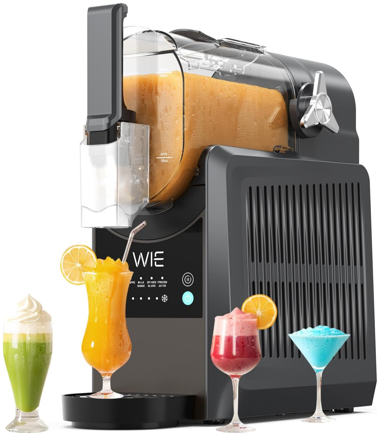
Image: The WIE Slushie Machine on a kitchen counter, surrounded by different frozen beverages.