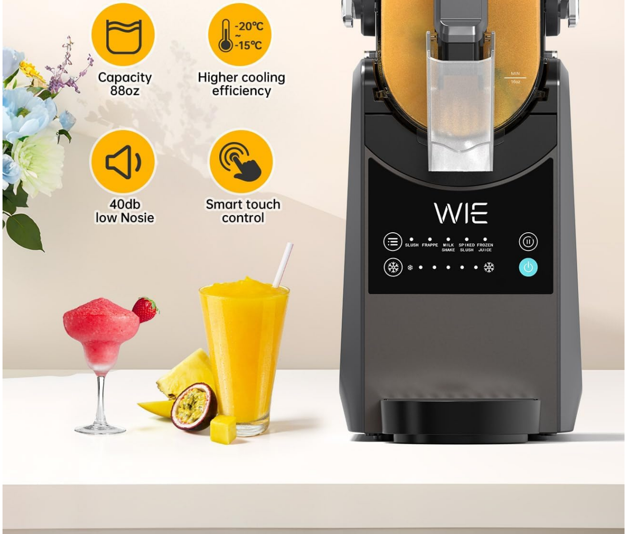
Image: Front view of the WIE Slushie Machine highlighting its 88oz vessel, 360° spiral blending, low noise, and smart touch control panel.