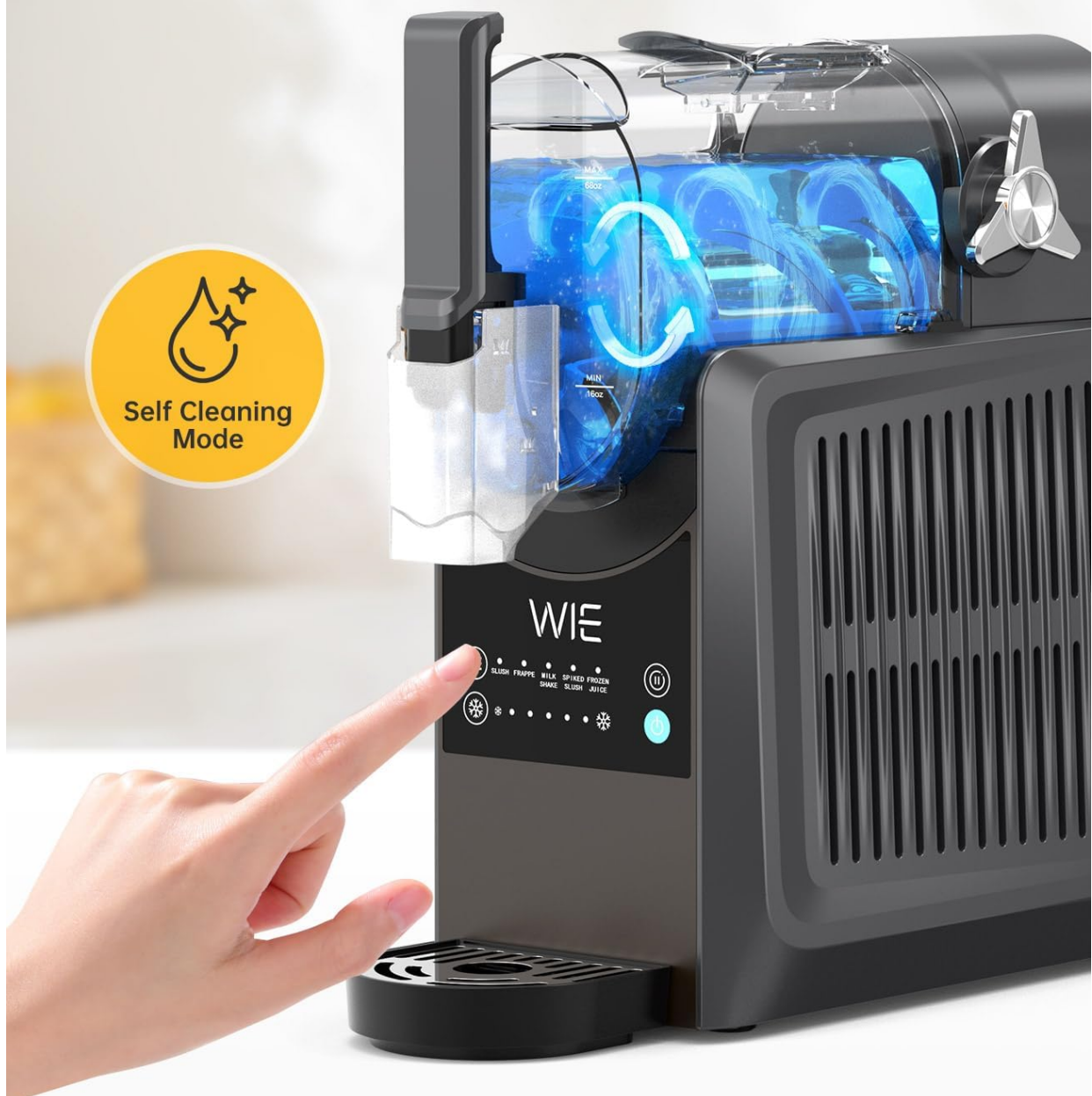
Image: A hand activating the self-cleaning mode on the WIE Slushie Machine, with water circulating inside the vessel.