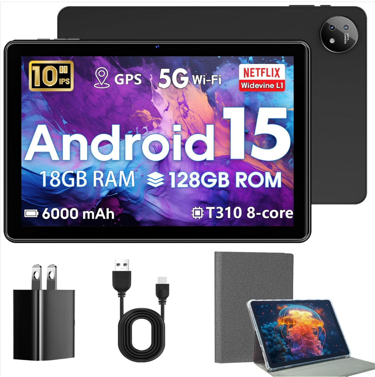
Image: Hasskya K30 Tablet with its included accessories, including a protective case, charging cable, and power adapter.