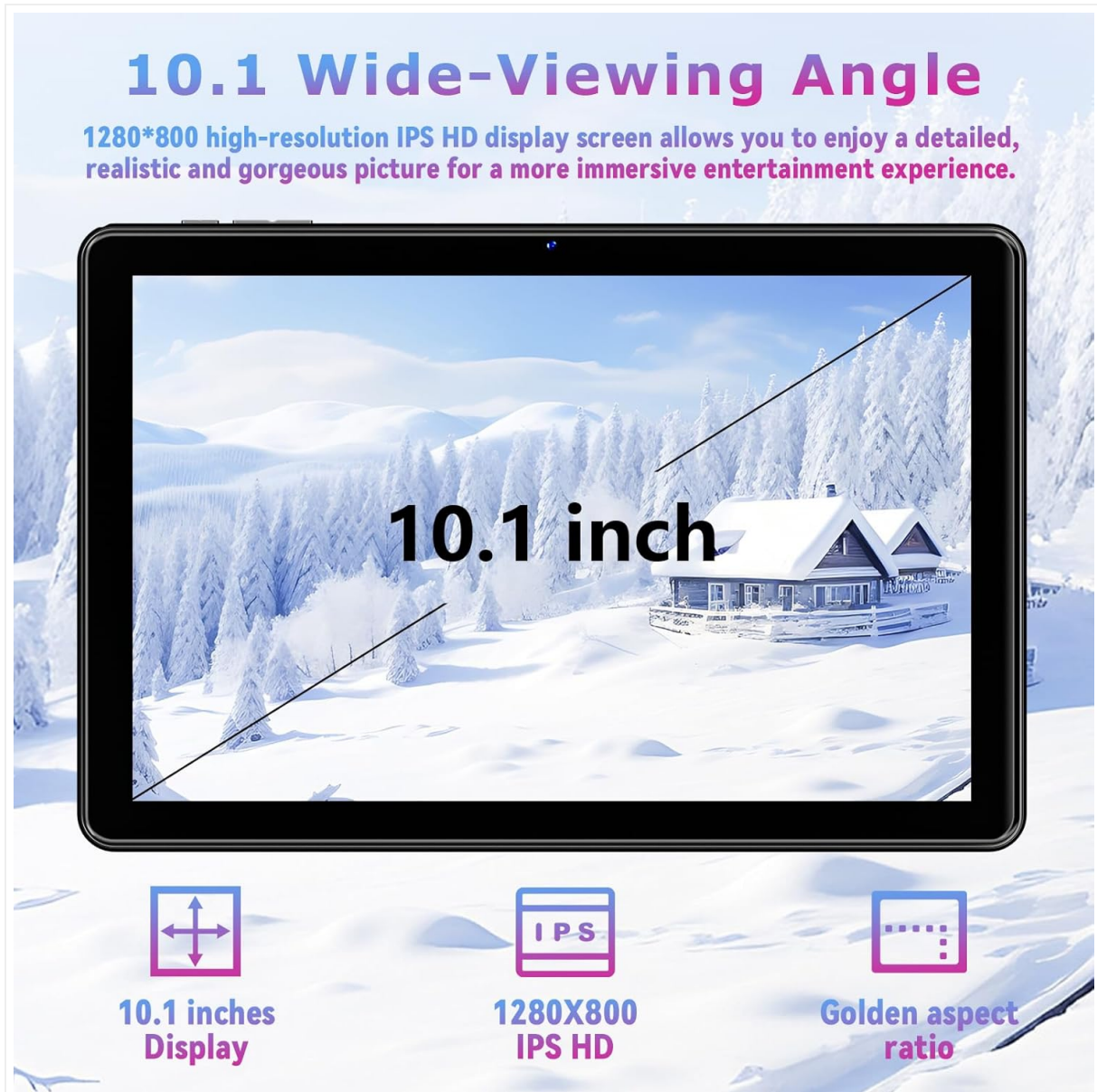
Image: The Hasskya K30 Tablet showcasing its 10.1-inch IPS HD display with a resolution of 1280x800 pixels.