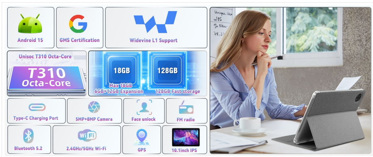
Image: A user demonstrating the face unlock feature on the Hasskya K30 tablet.