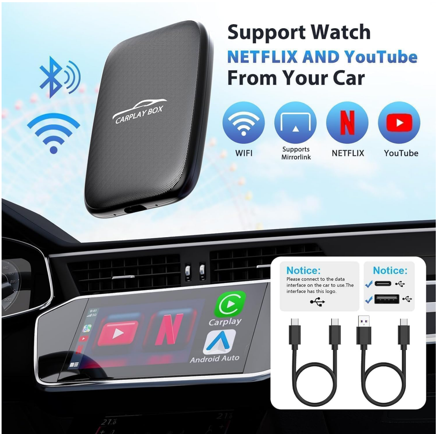
Figure 3: Built-in Entertainment Features