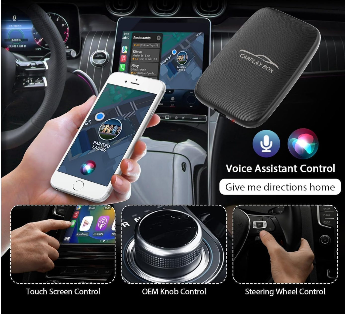
Figure 2: Retained Original Vehicle Controls