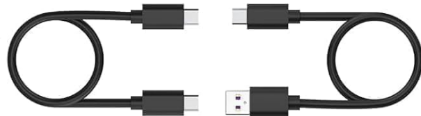
Figure 4: Broad Compatibility with Vehicles and Smartphones