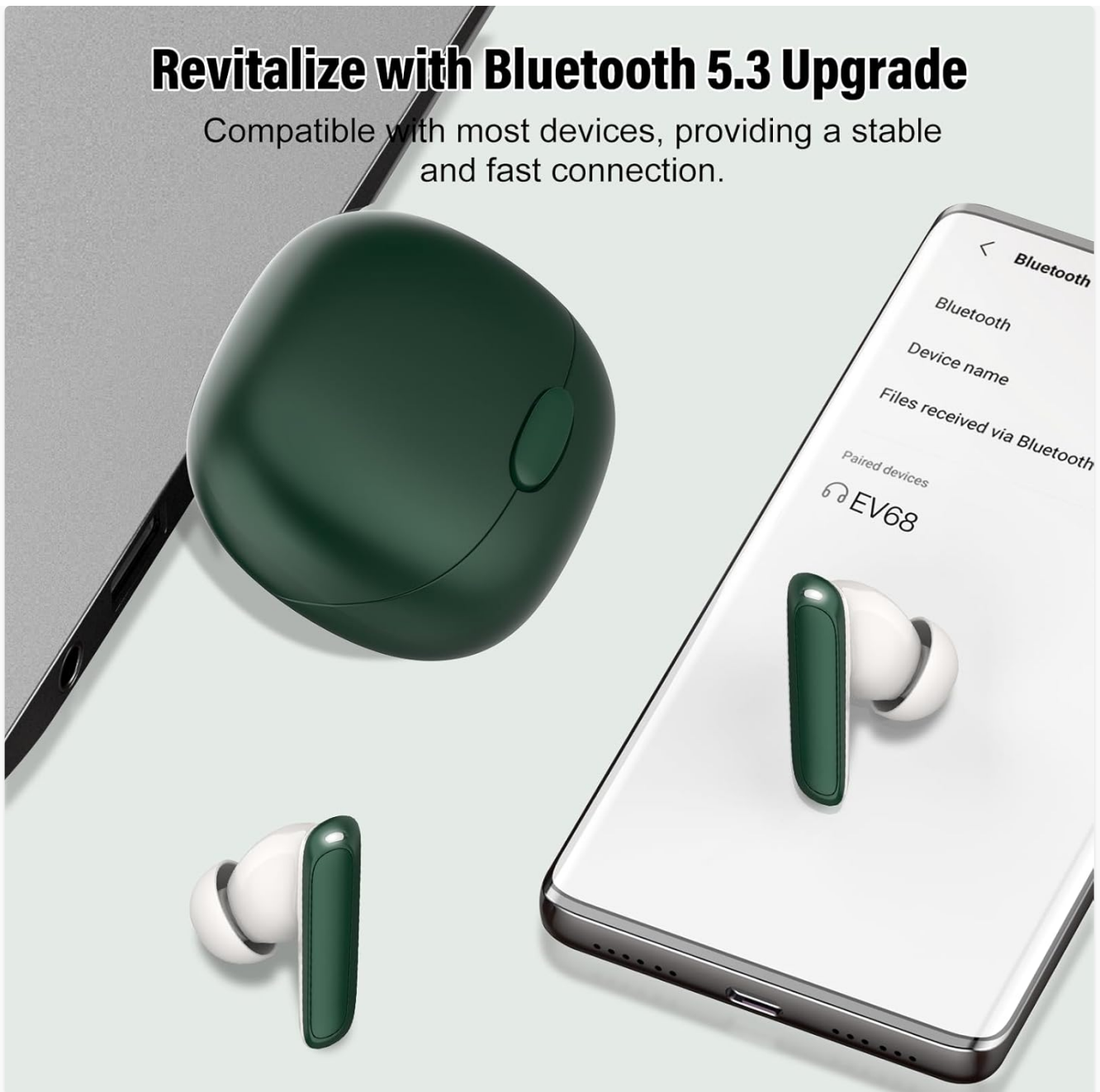
Image: Bluetooth 5.3 pairing with a mobile device.

Compatible with most devices, providing a stable and fast connection.