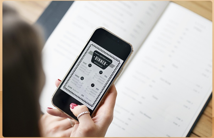
Image: Camera Translation Mode for text recognition.

The photo translation mode can instantly recognize and translate text through the camera.