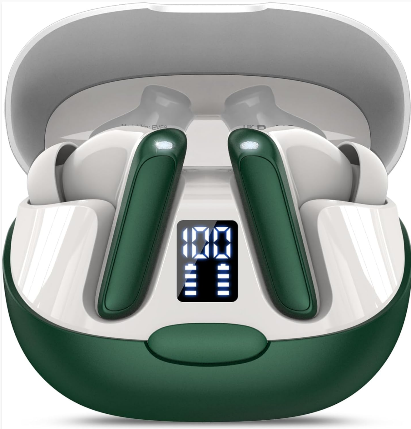
Image: Puqo EV68 Earbuds in charging case.

The Puqo EV68 earbuds are designed for versatility, offering 3-in-1 functionality for translation, calls, and music. They support real-time translation in 164 languages and feature Bluetooth 5.3 for stable connectivity and ENC noise cancellation for clear audio.